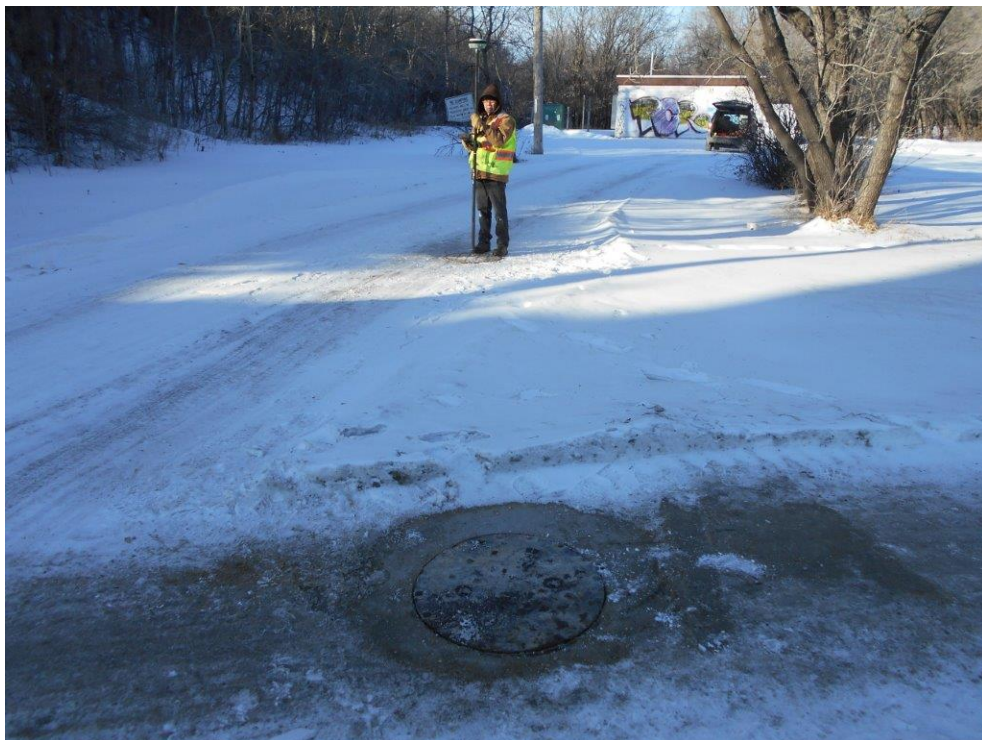
Figure 2 - Mission Trunk weir manhole, facing west