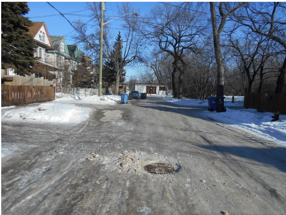
Figure 9 – O/S No. 125 Selkirk Avenue, at manhole MH00012339, facing east