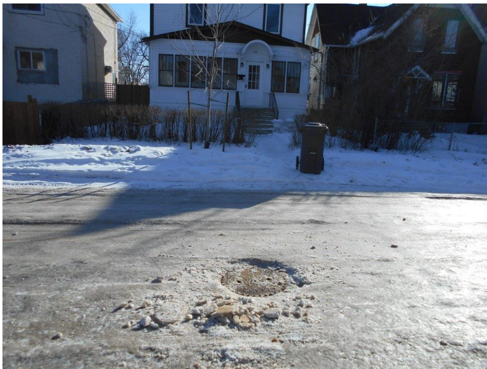
Figure 11 – Selkirk Avenue looking at manhole MH00012339, facing south