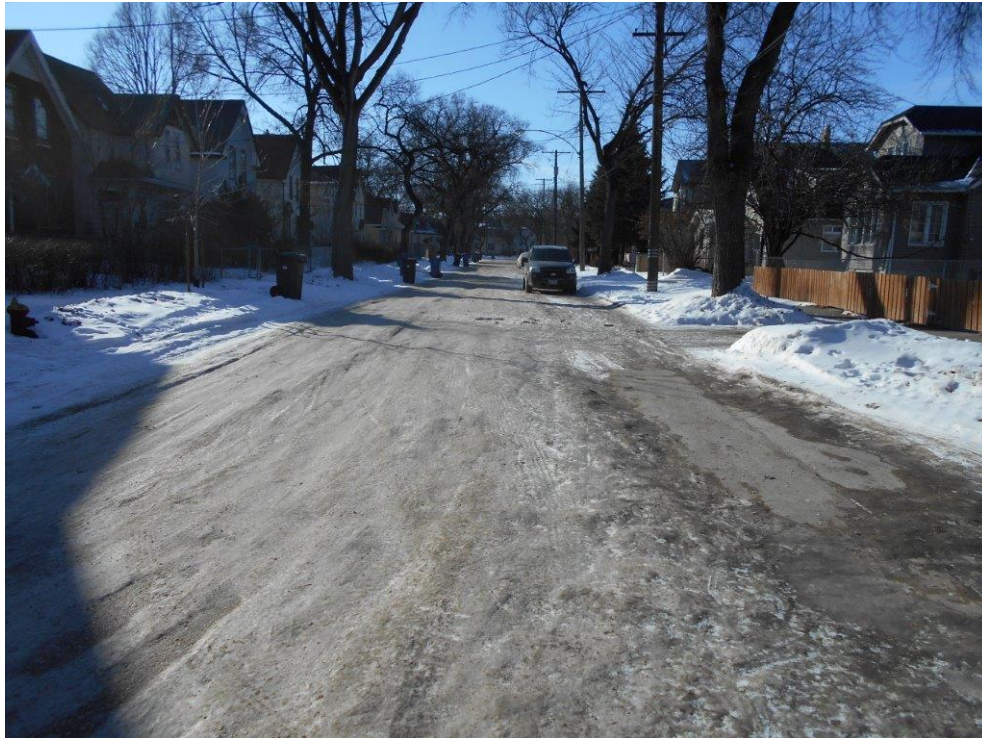
Figure 10 – Selkirk Avenue looking at manhole MH00012339, facing west