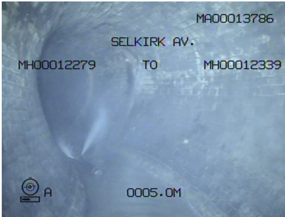
Figure 12 – Selkirk Ave Trunk, 5.0m downstream of MH00012279, facing east