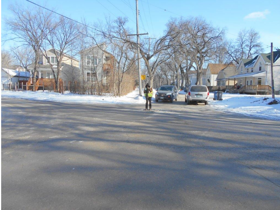
Figure 8 – Selkirk Ave Trunk and Austin Street North, facing east