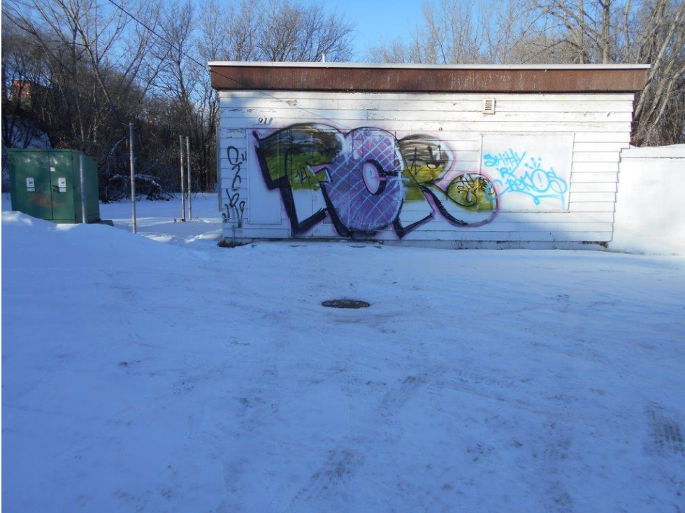
Figure 3 - Mission Flood Pumping Station, facing west