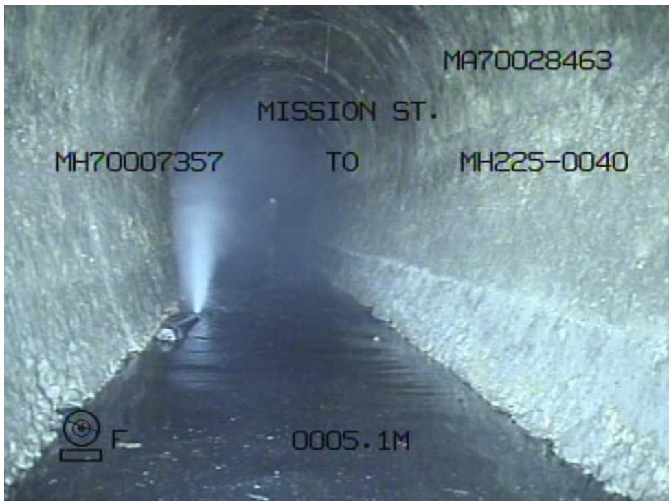
Figure 5 – Mission Trunk, 5.1m downstream of weir manhole, facing west