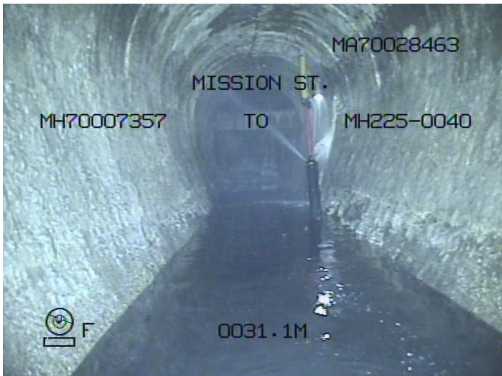
Figure 7 – Mission Trunk, 31.1m downstream of weir manhole, facing west