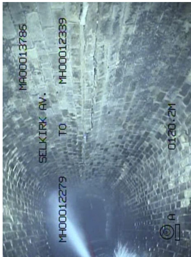
Figure 17 – Selkirk Ave Trunk, 120.2m downstream of MH00012279, facing east