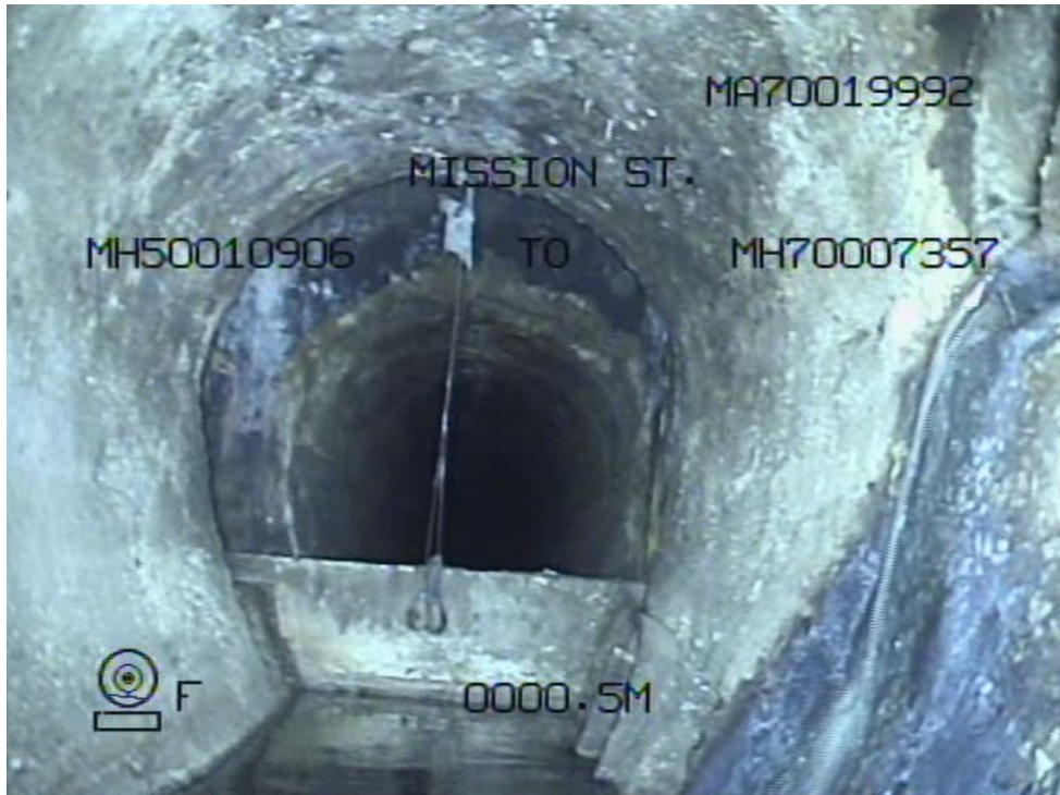
Figure 4 – Mission Trunk, upstream of weir manhole, facing west