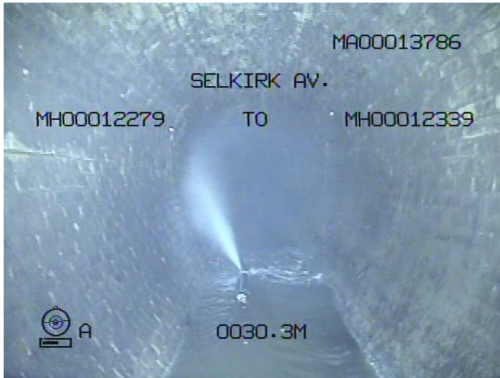
Figure 14 – Selkirk Ave Trunk, 30.3m downstream of MH00012279, facing east