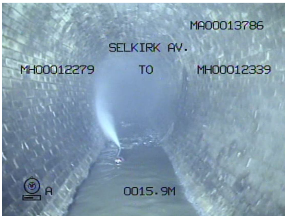
Figure 13 – Selkirk Ave Trunk, 15.9m downstream of MH00012279, facing east