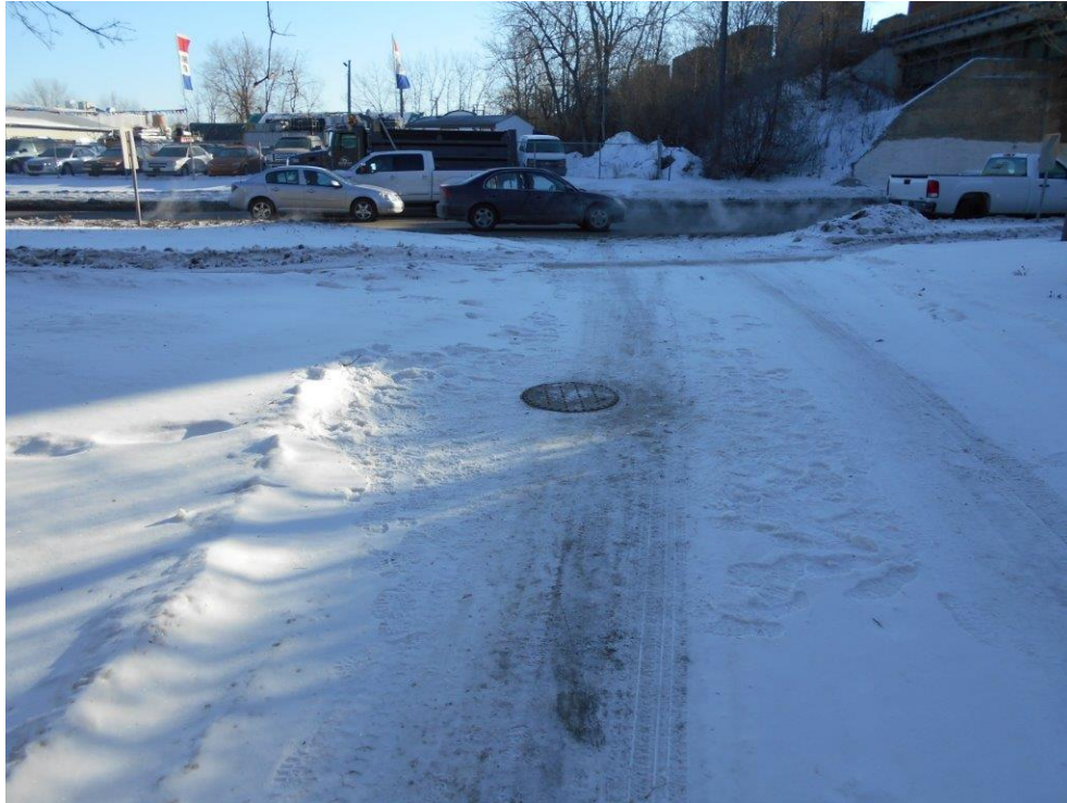
Figure 1 - Mission Trunk weir manhole, facing east