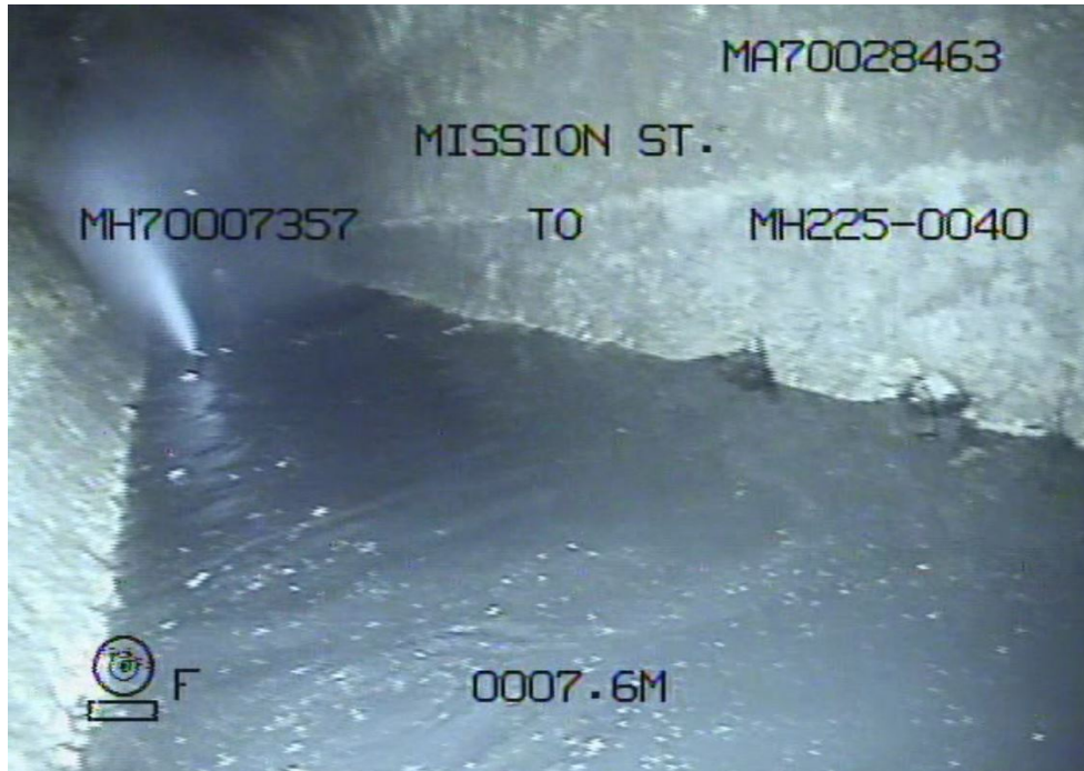
Figure 6 – Mission Trunk, 7.6m downstream of weir manhole, facing west