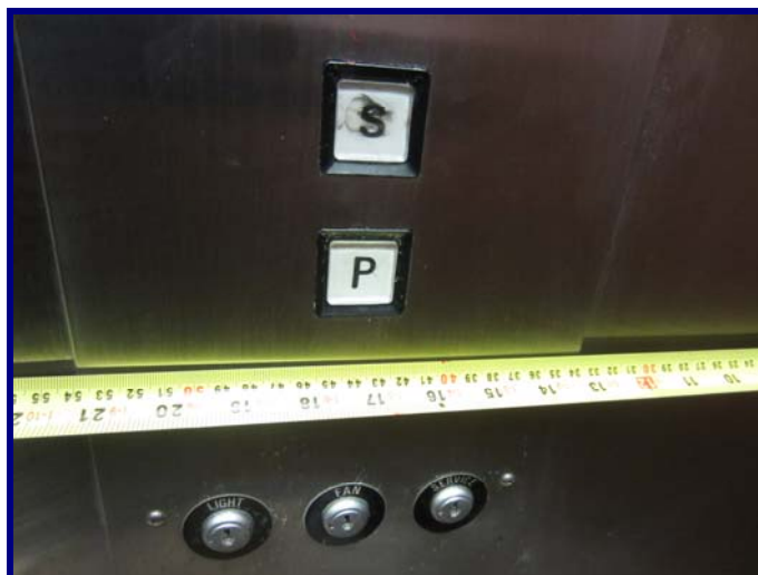
FIGURE — 5 — Location and width of existing Car Station