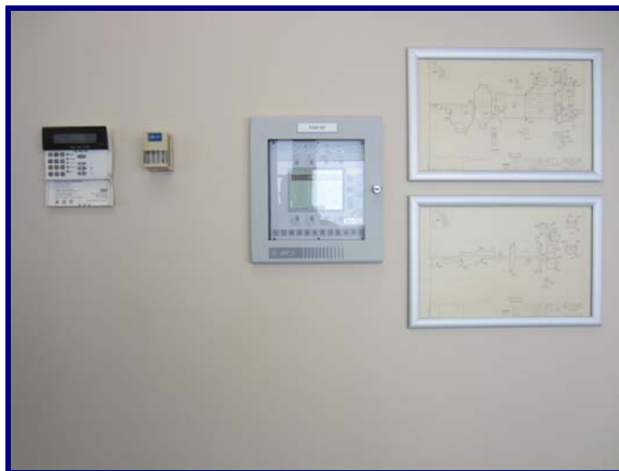
FIGURE — 7 — Fire Alarm Annunciator Panel in North Entrance Lobby