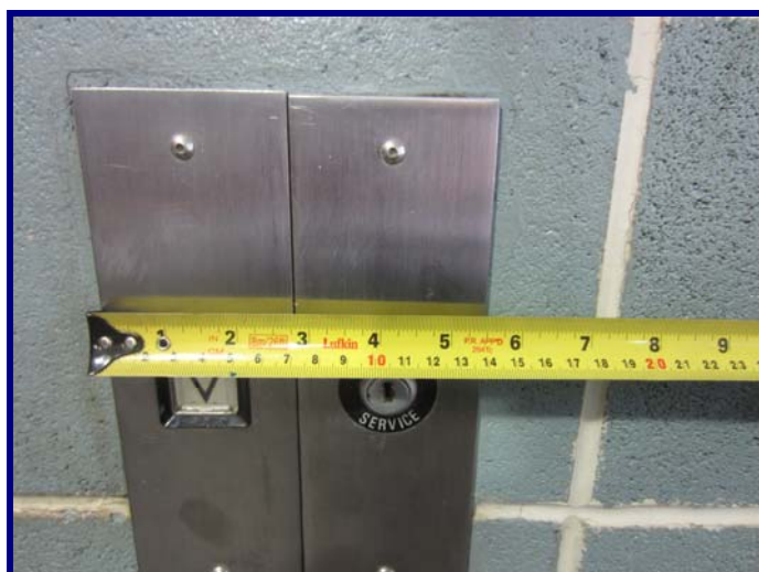
FIGURE — 10 — Existing Hall Push Button fixture at Main floor