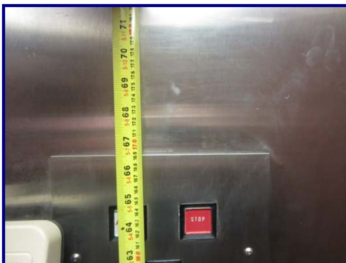
FIGURE — 6 — Height of Existing Car Station