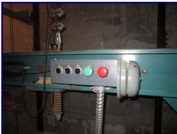
FIGURE — 3 — Existing Car Top Station