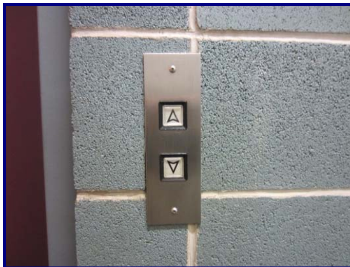
FIGURE — 9 — Typical Existing Hall Push Button fixture