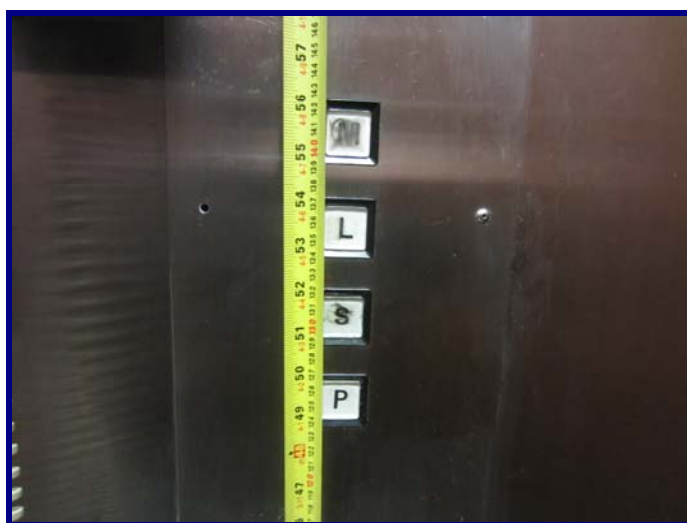
FIGURE — 4 — Existing Car Station