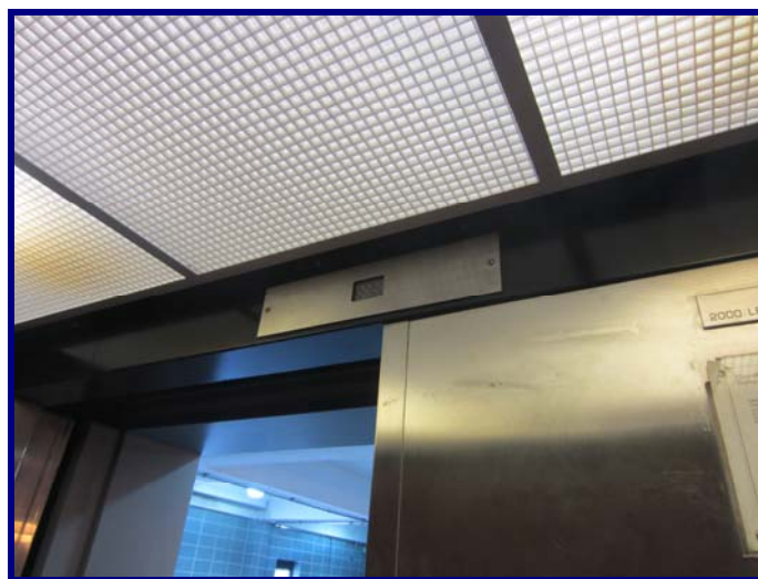
FIGURE — 8 — Existing Car Position Indicator