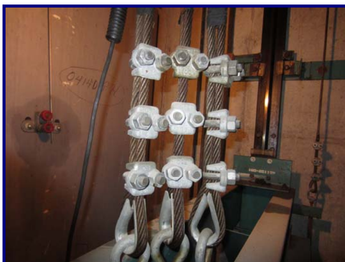
FIGURE — 2 — Existing cable terminations