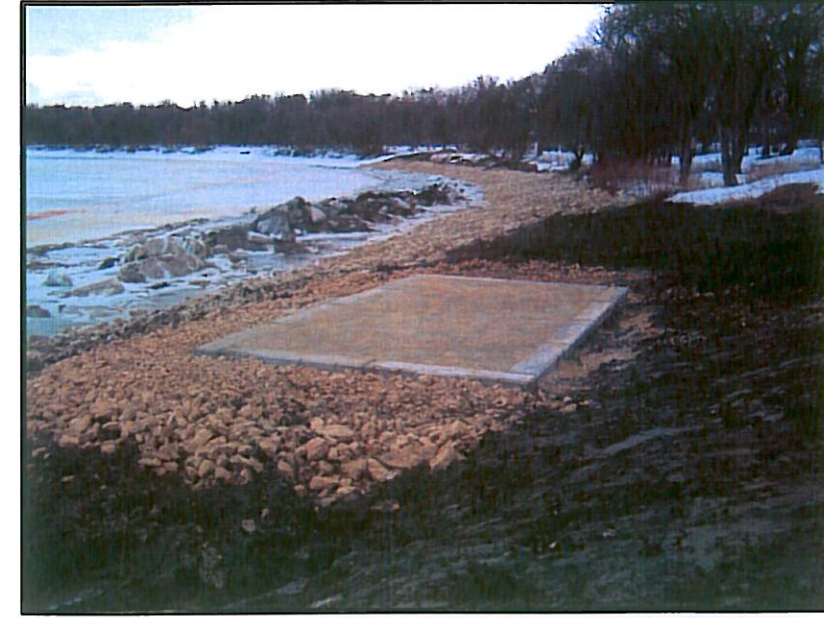
PHOTOGRAPH A: CONCEPTUAL WORK SHOWING DURAHOLD 2 TRIM CONFINING INTERLOCKING PAVE STONES. THIS WAS INSTALLED ALONG THE RED RIVER SHORELINE.