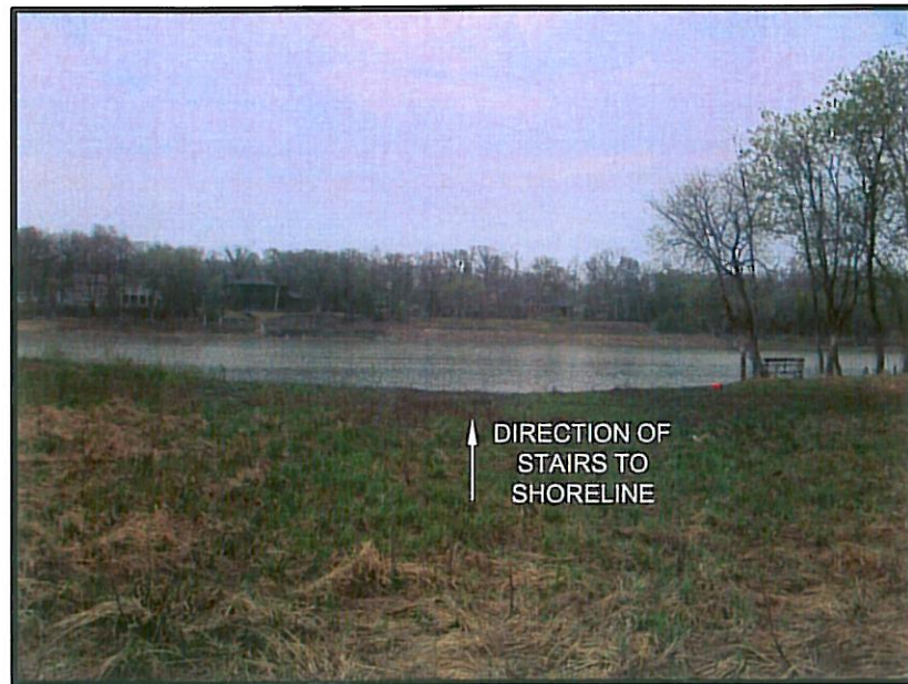
PHOTOGRAPH 4: FACING NORTHEAST SHOWING MID BANK, THE LOCATION AND DIRECTION OF STAIRS TO THE CANOE LAUNCH.