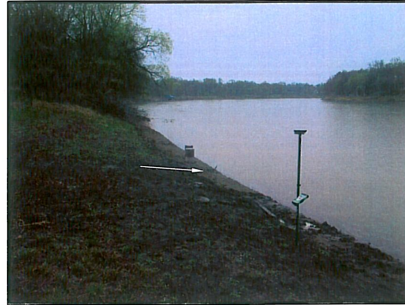
PHOTOGRAPH 2: FACING NORTHWEST NEAR SHORELINE WHERE AT LOCATION OF PROPOSED CANOE LAUNCH LOCATED BETWEEN PAIRS OF PILLARS.