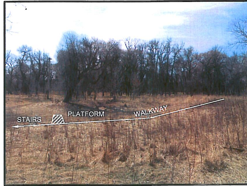
PHOTOGRAPH 5: FACING SOUTH SHOWING LOCATIONS FOR RAMPS FOR CANOE LAUNCH.