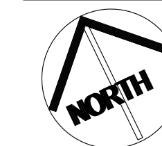
KEY PLAN SCALE: NTS