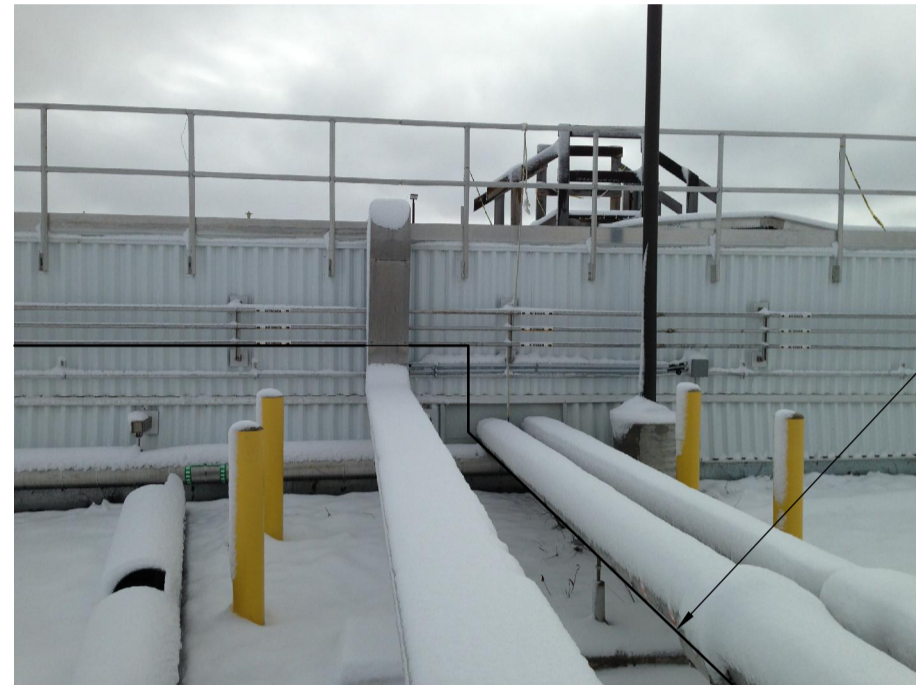
1 INSTRUMENT AIR SCALE NONE

SUPPORT ON EXISTING PIPE AS APPLICABLE. SEE DRAWING D-1005 FOR CONTINUATION