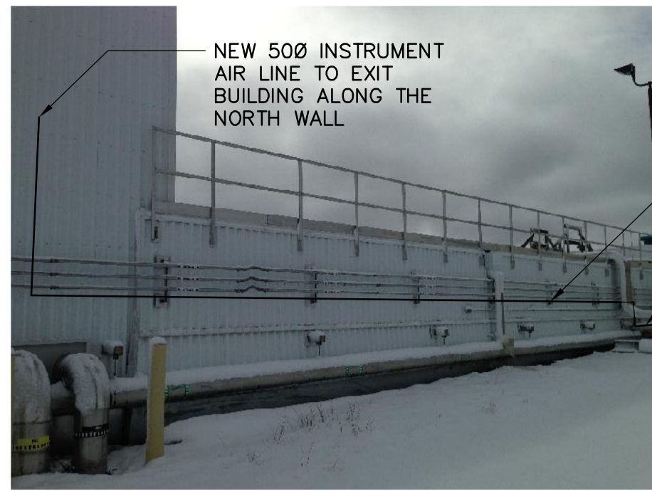
NEW 500 INSTRUMENT AIR LINE TO EXIT BUILDING ALONG THE NORTH WALL