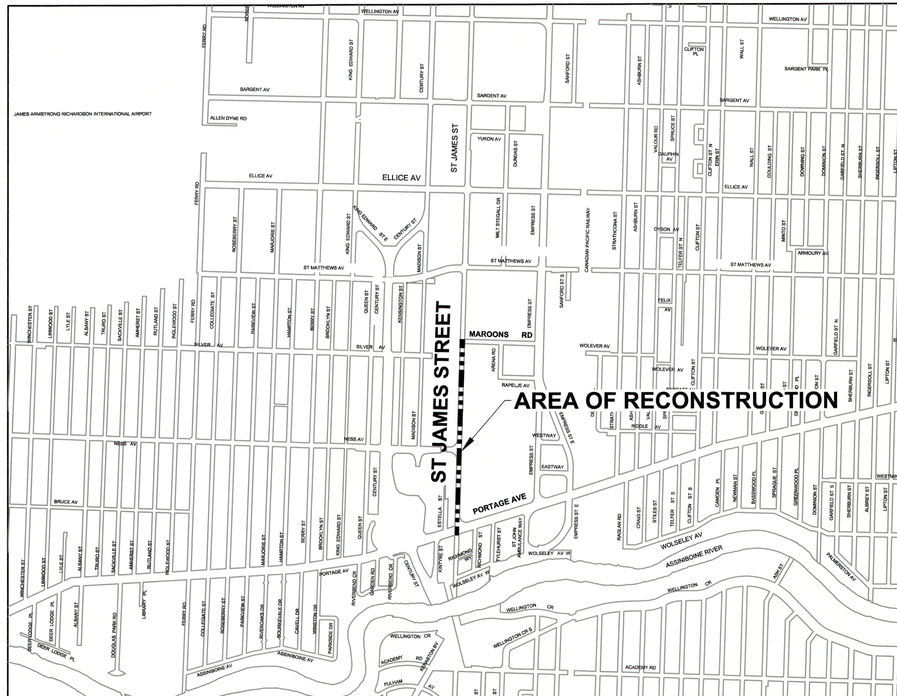
LOCATION PLAN SCALE: 1:10,000 0 250 500m