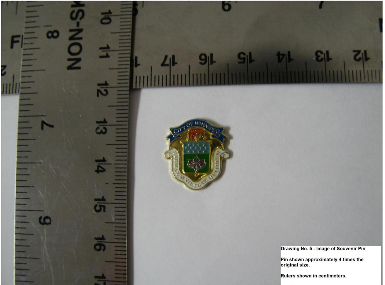
Drawing No. 5 - Image of Souvenir Pin

Pin shown approximately 4 times the original size.