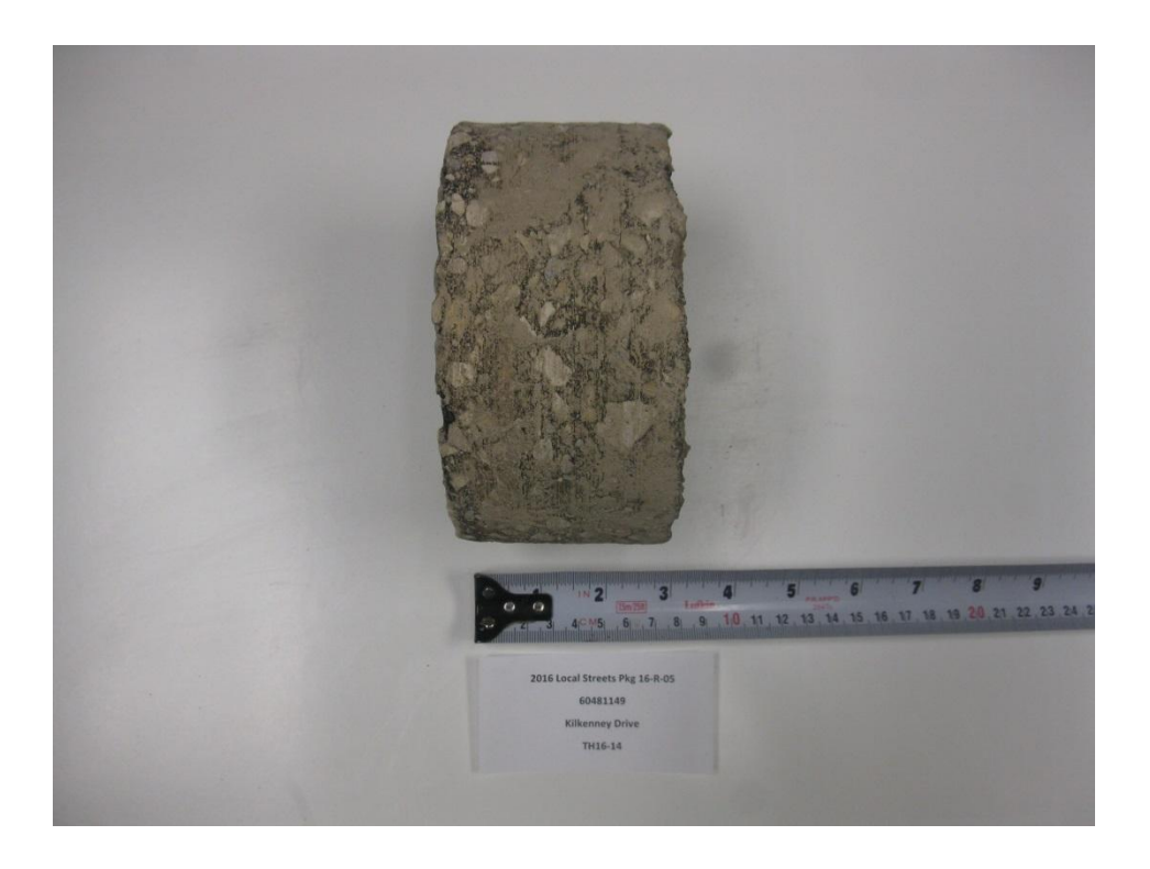
Photograph 4. Kilkenny Drive – TH16-14