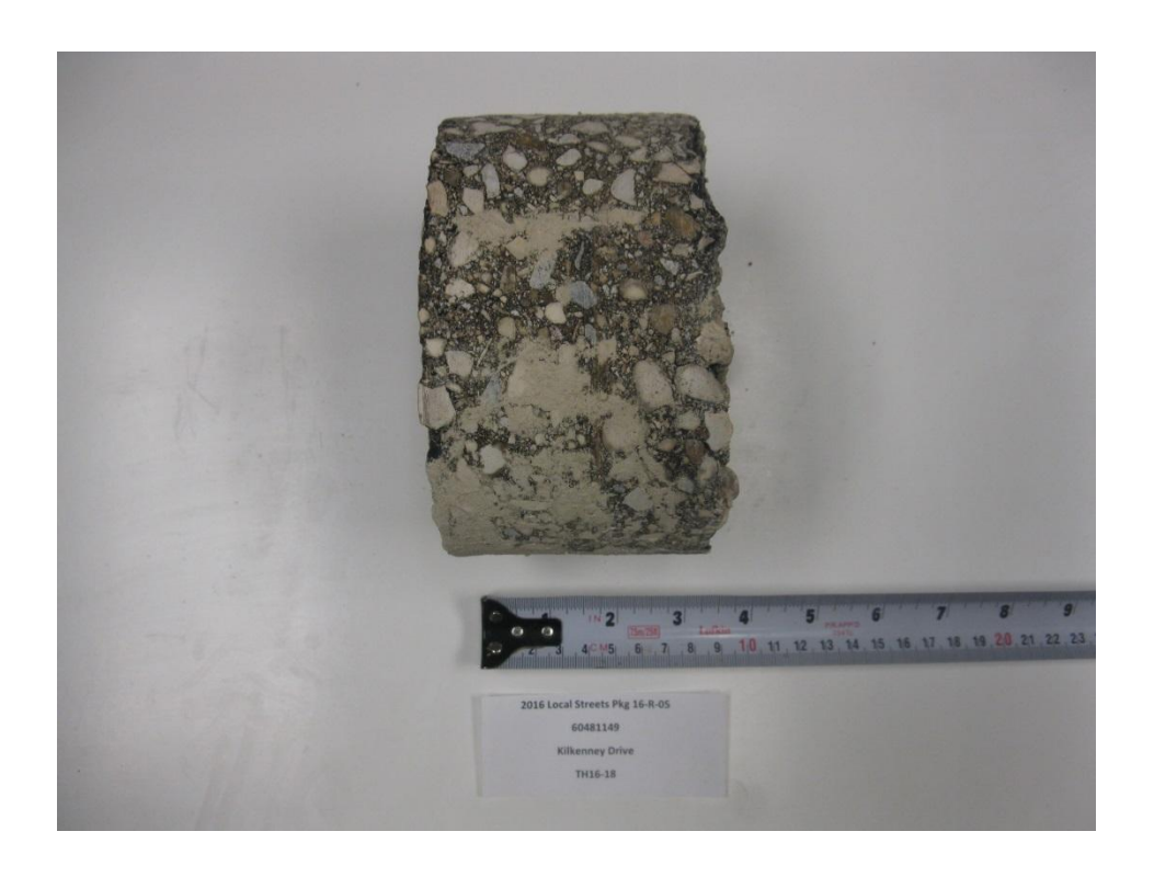
Photograph 8. Kilkenny Drive – TH16-18