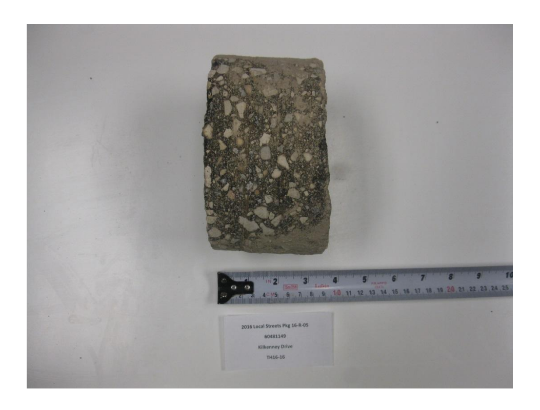
Photograph 6. Kilkenny Drive - TH16-16