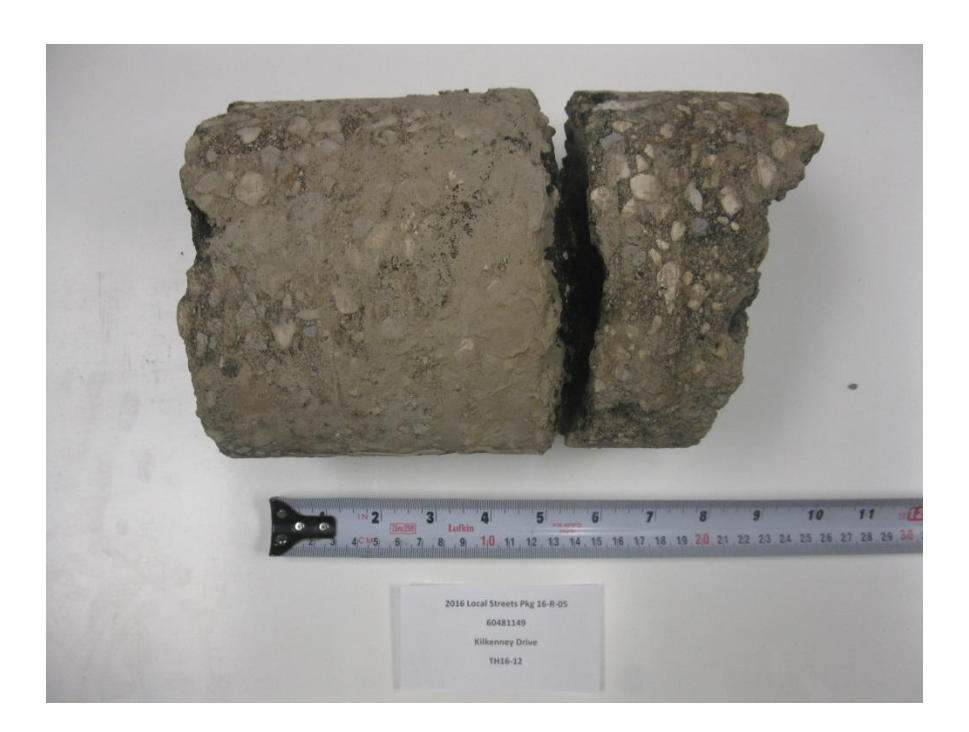
Photograph 2. Kilkenny Drive – TH16-12