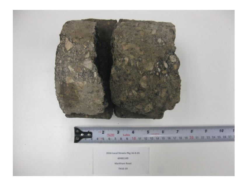
Photograph 11. Markham Road – TH16-19