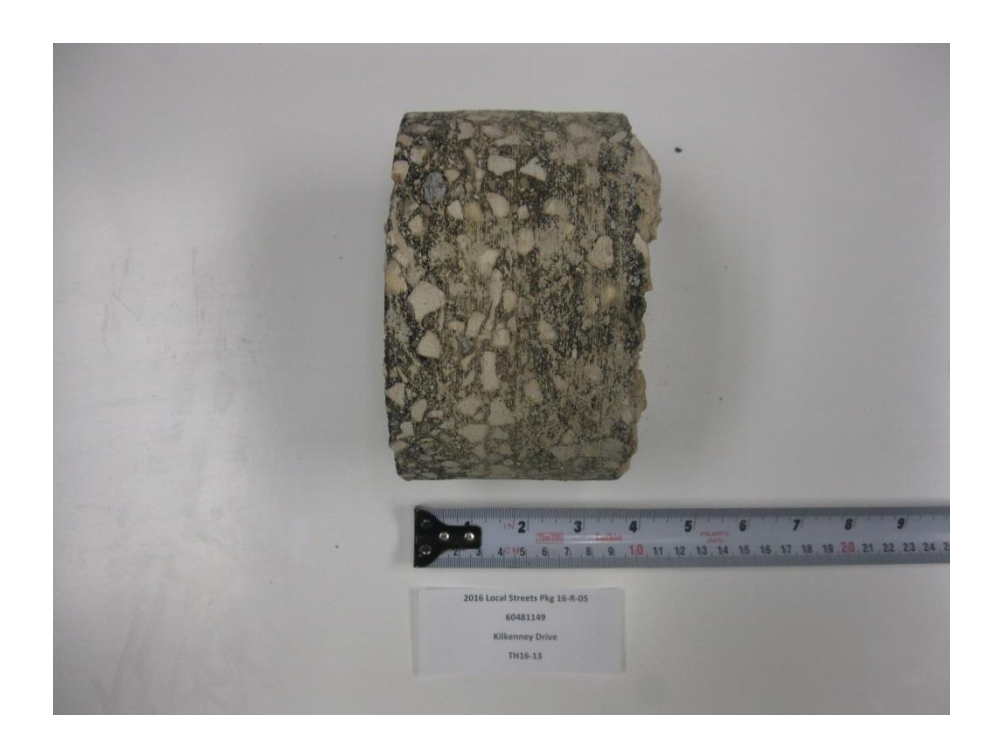
Photograph 3. Kilkenny Drive – TH16-13