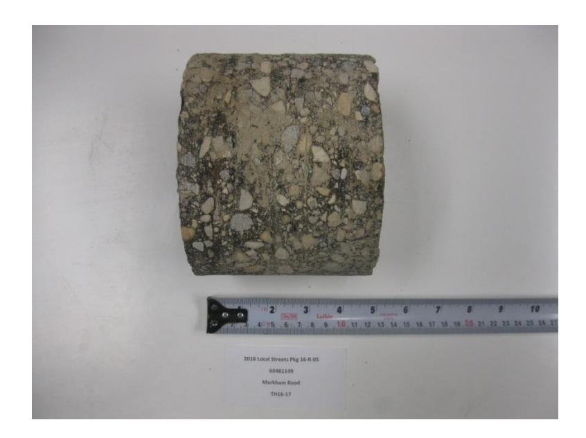
Photograph 9. Markham Road – TH16-17