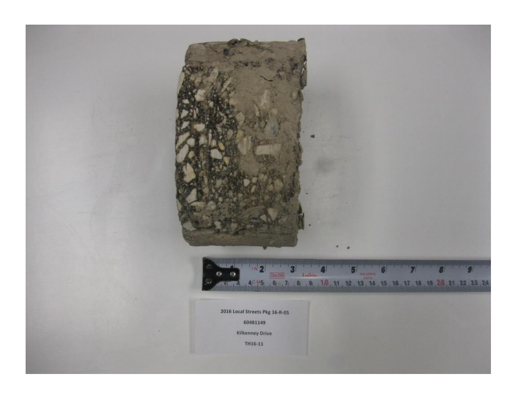
Photograph 1. Kilkenny Drive – TH16-11