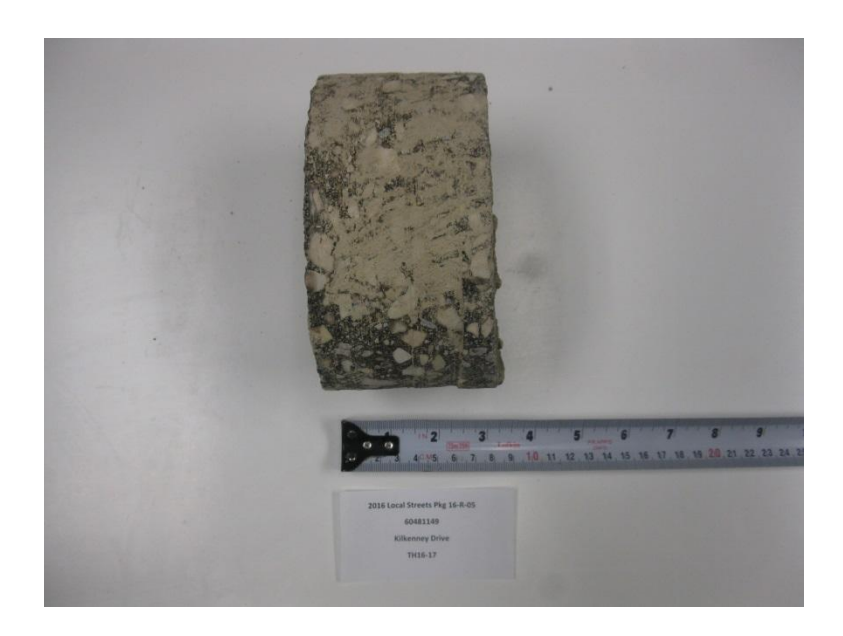
Photograph 7. Kilkenny Drive – TH16-17