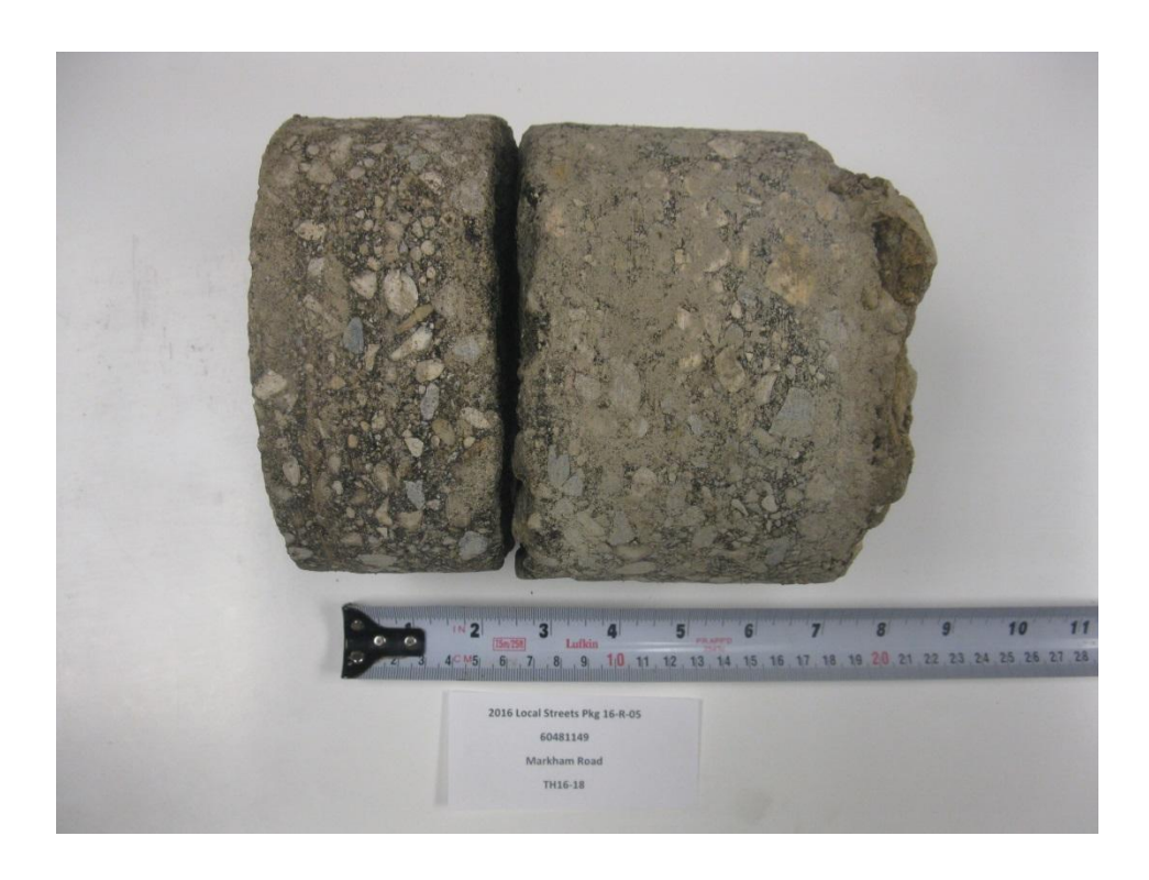
Photograph 10. Markham Road - TH16-18