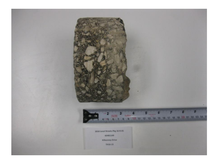
Photograph 5. Kilkenny Drive – TH16-15