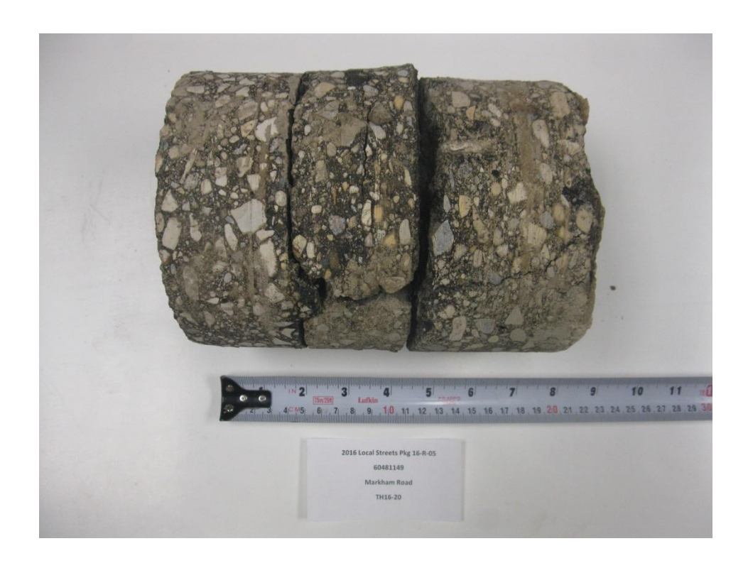
Photograph 12. Markham Road – TH16-20