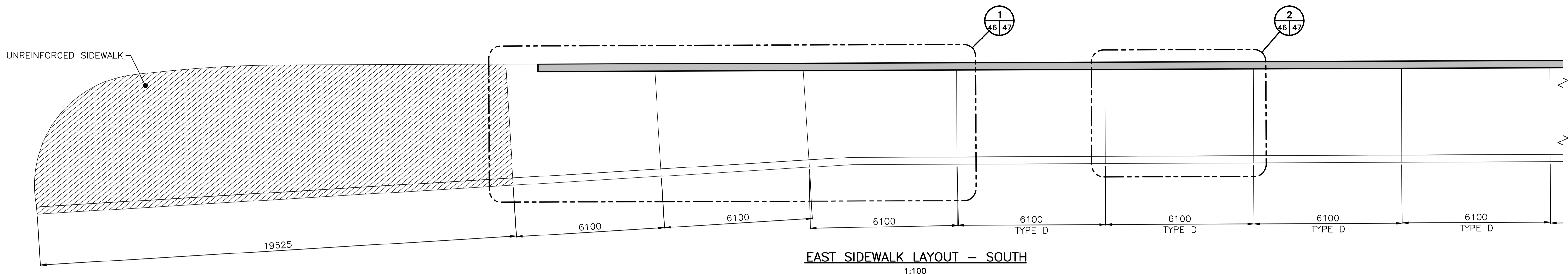
EAST SIDEWALK LAYOUT - SOUTH 1:100