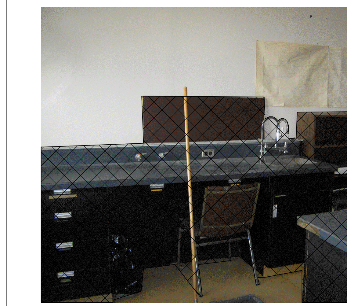
PHOTO EXISTING WORKSTATION/ MILLWORK TO BE REMOVED. EXISTING FUME HOODS TO BE REMOVED & DISCONNECTED. REFER TO MECHANICAL DRAWINGS.