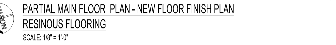
PARTIAL MAIN FLOOR PLAN - NEW FLOOR FINISH PLAN RESINOUS FLOORING SCALE: 1/8" = 1'-0"