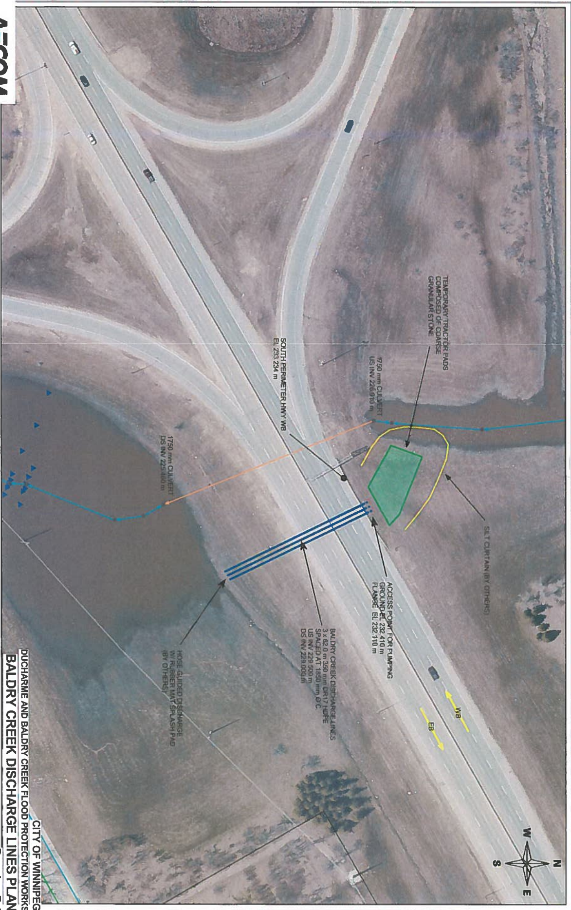
CITY OF WINNIPEG DUCARNE AND BALDRY CREEK FLOOD PROTECTION WORKS BALDRY CREEK DISCHARGE LINES PLAN Drawing D-3