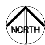
PARTIAL SITE PLAN - BUILDING LOCATION SCALE: N.T.S.