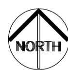
1 SITE PLAN - LANDSCAPING SCALE: 1:500