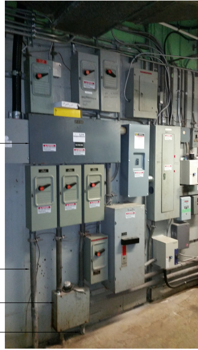
2 BOILER ROOM ELECTRICAL LAYOUT - DEMOLITION SCALE: NTS E1-R0