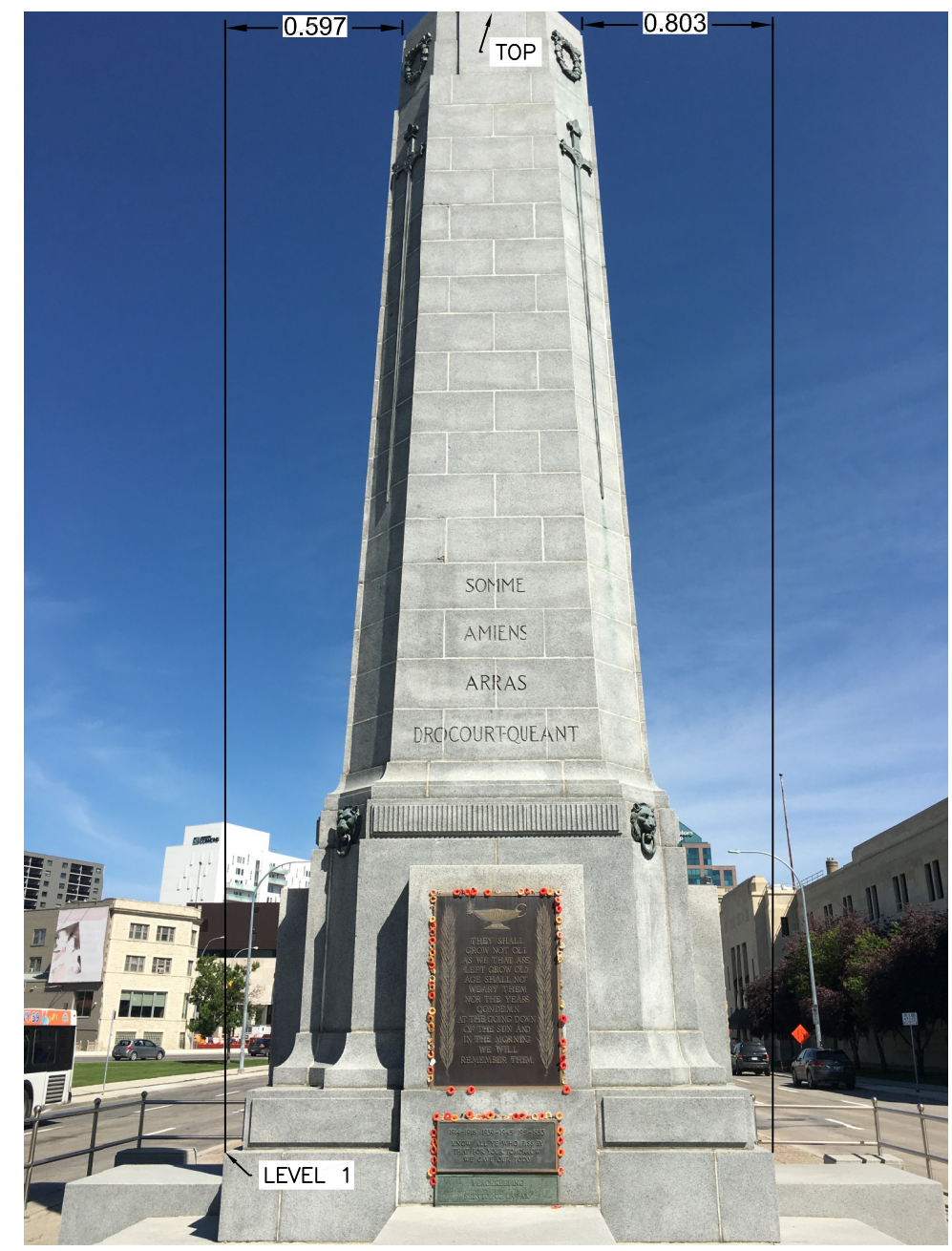
PHOTO: SOUTH ELEVATION N.T.S.

BENCHMARK ..... 232.642m TOP OF OPERATING NUT OF HYDRANT AT THE NORTHEAST CORNER OF MEMORIAL BLVD AND YORK AVE.