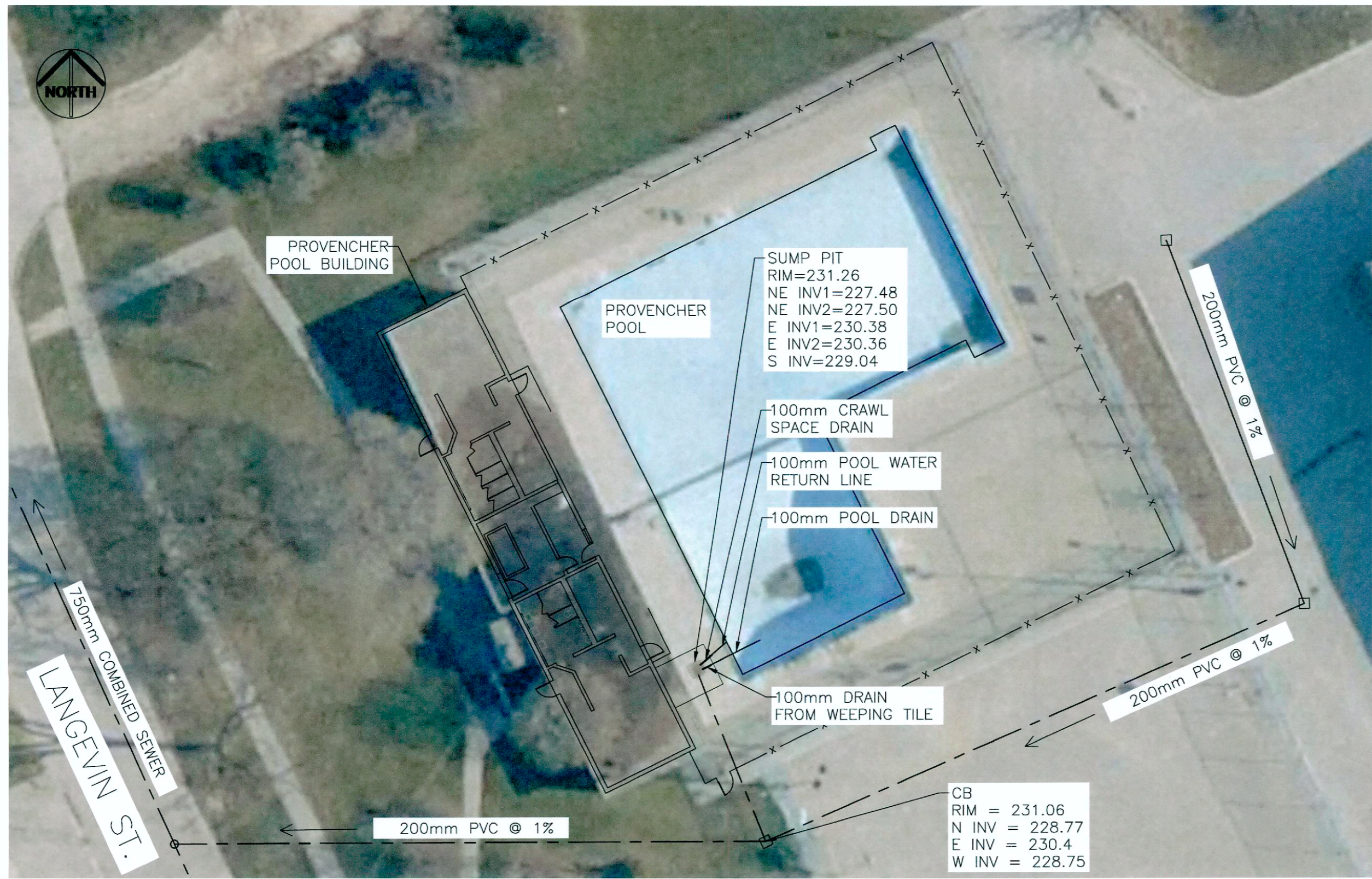
EXISTING GENERAL SITE PLAN SCALE 1:250