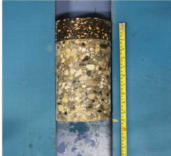
Photo 1 - TH01 Core