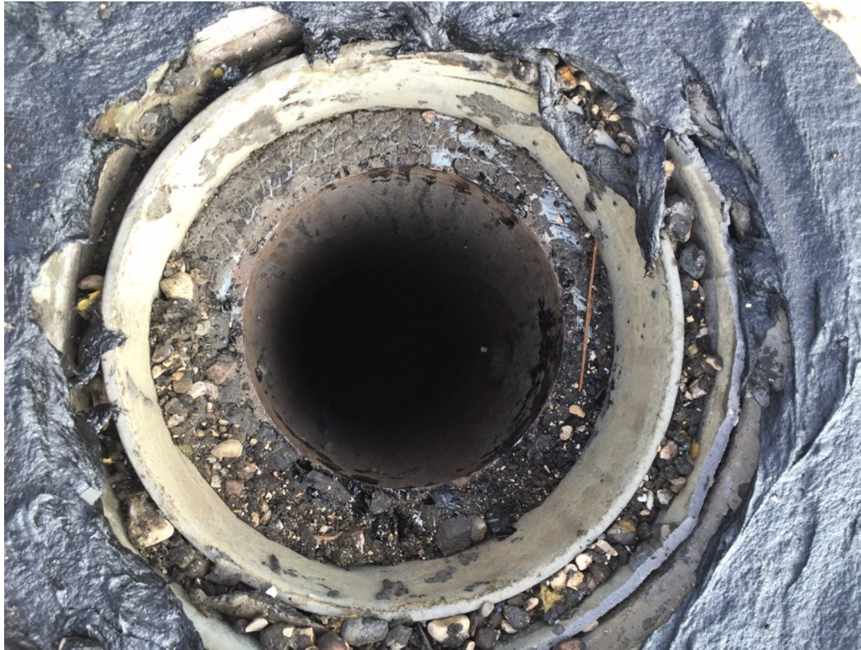
TYPICAL EXISTING DRAIN HUB