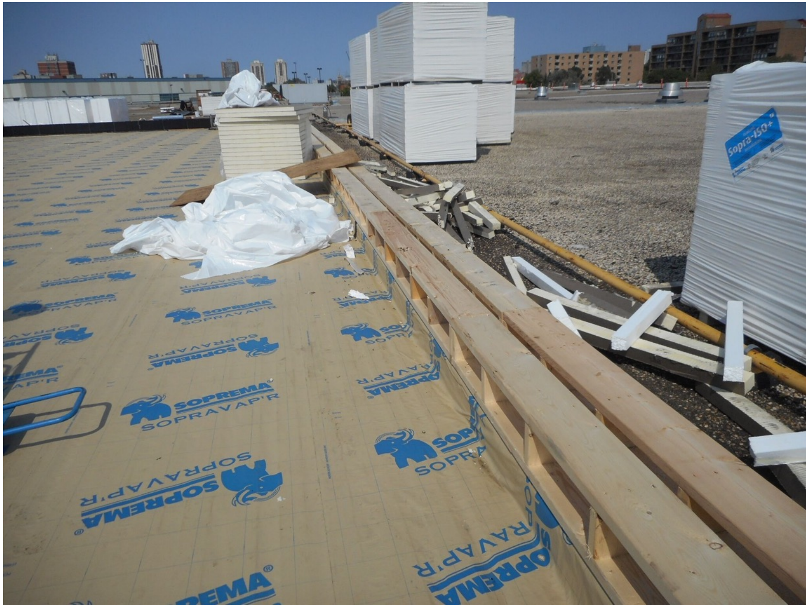
2016 EXPANSION JOINT TYPICAL