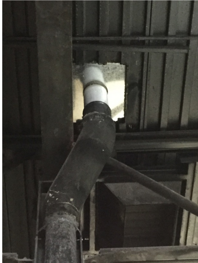
DRAIN LINE TO BE CUT & NEW INTERNAL DRAIN HUB & INSULATION INSTALLED.