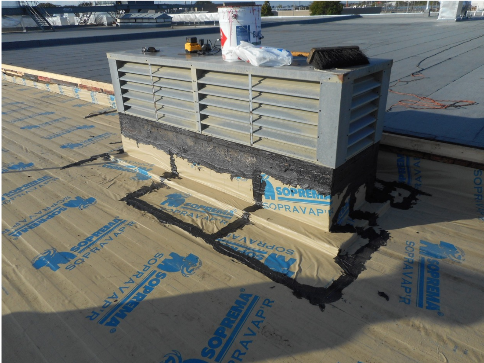
2016 TYPICAL DOGHOUSE VENT CURB