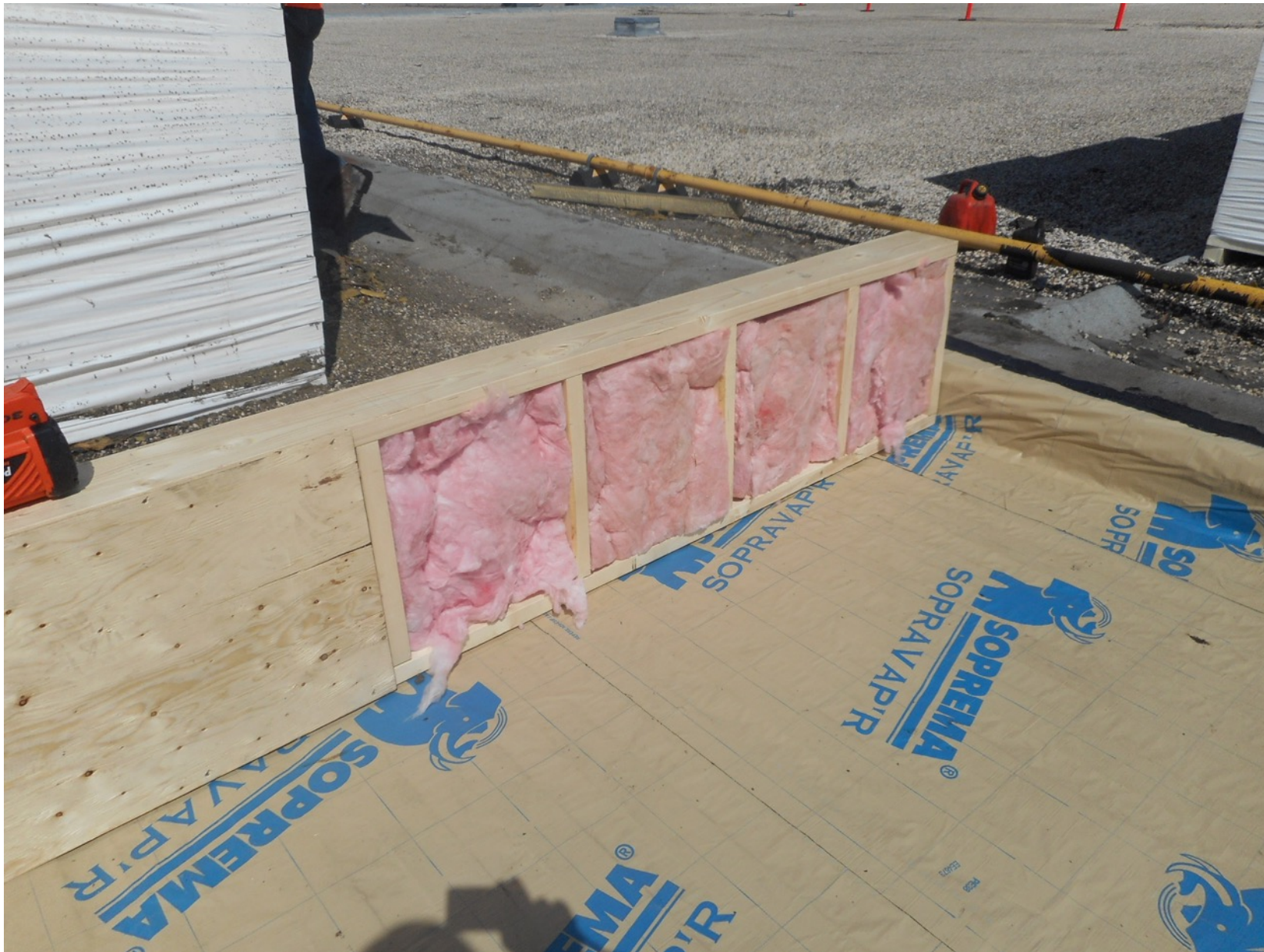
2016 NEW DIVIDER CONSTRUCTION TYPICAL