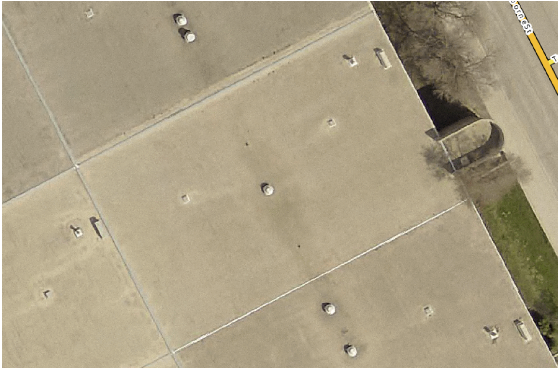
ROOF-B5 & B5a