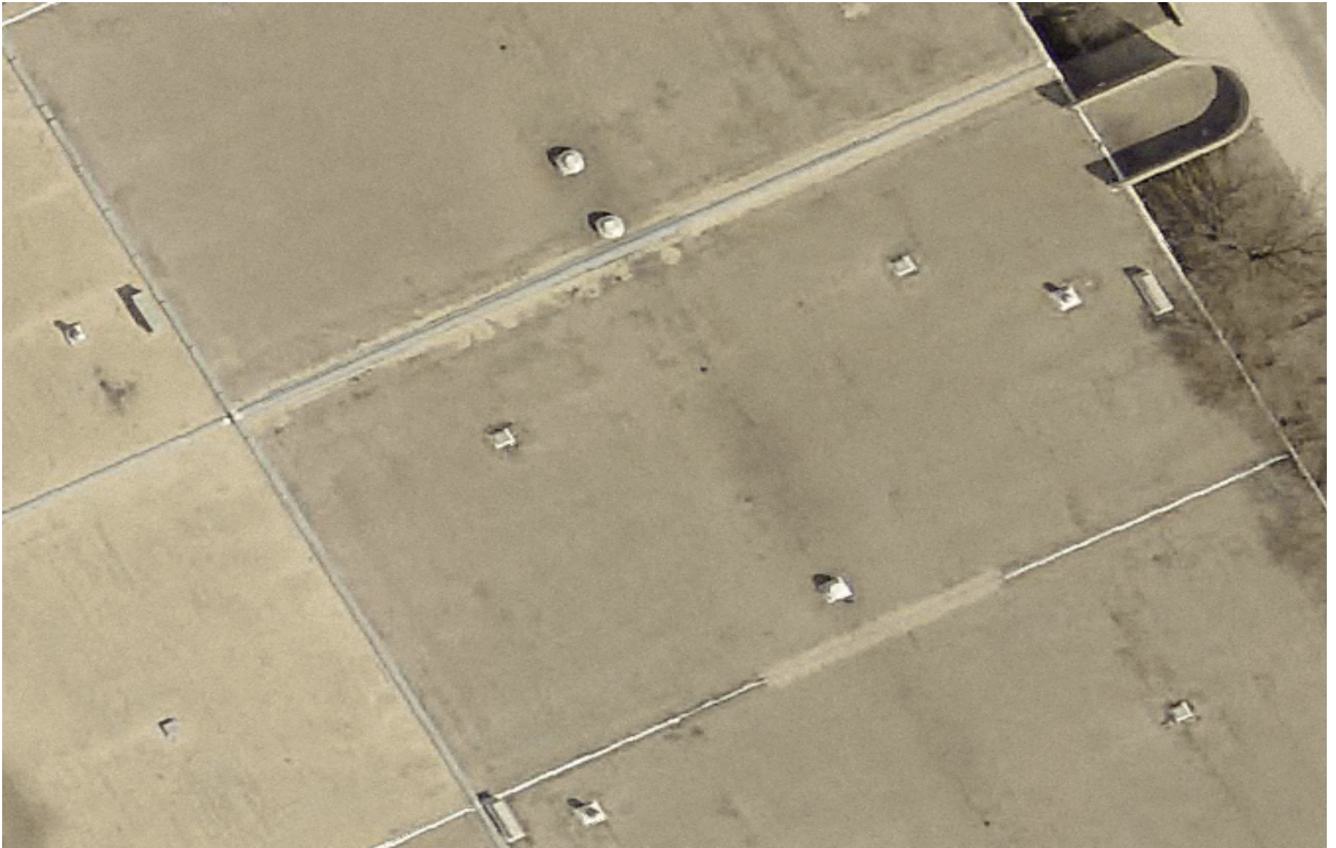
ROOF-B3 & B3a