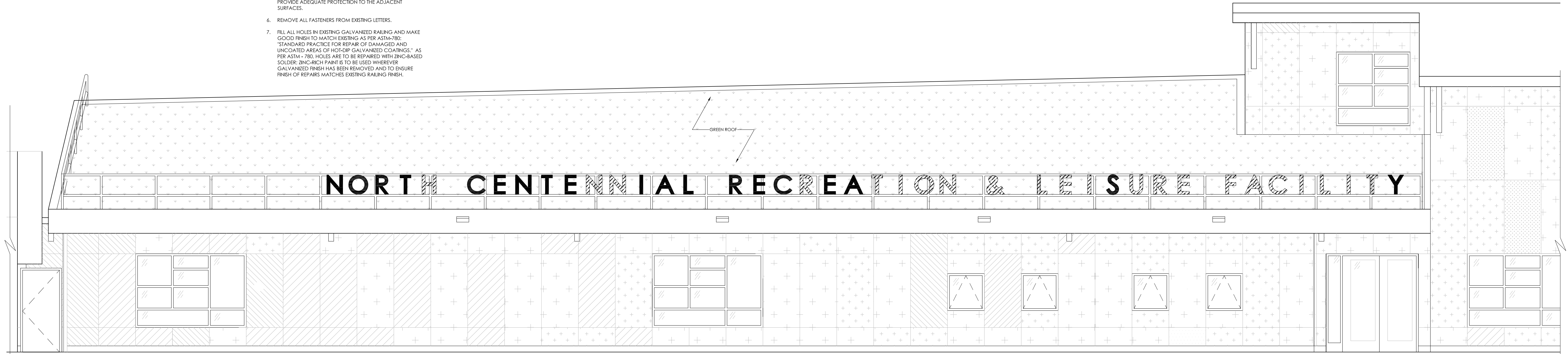
1 NORTH ELEVATION - EXISTING LETTERING 1/4" = 1'-0"