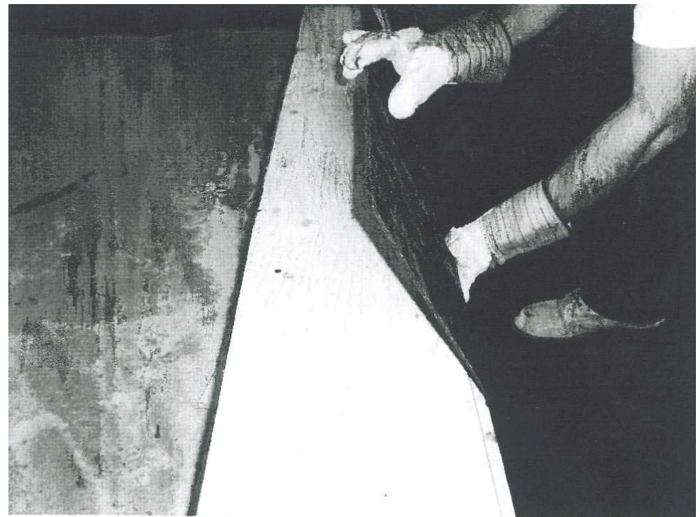
Step 3: Bending the board.