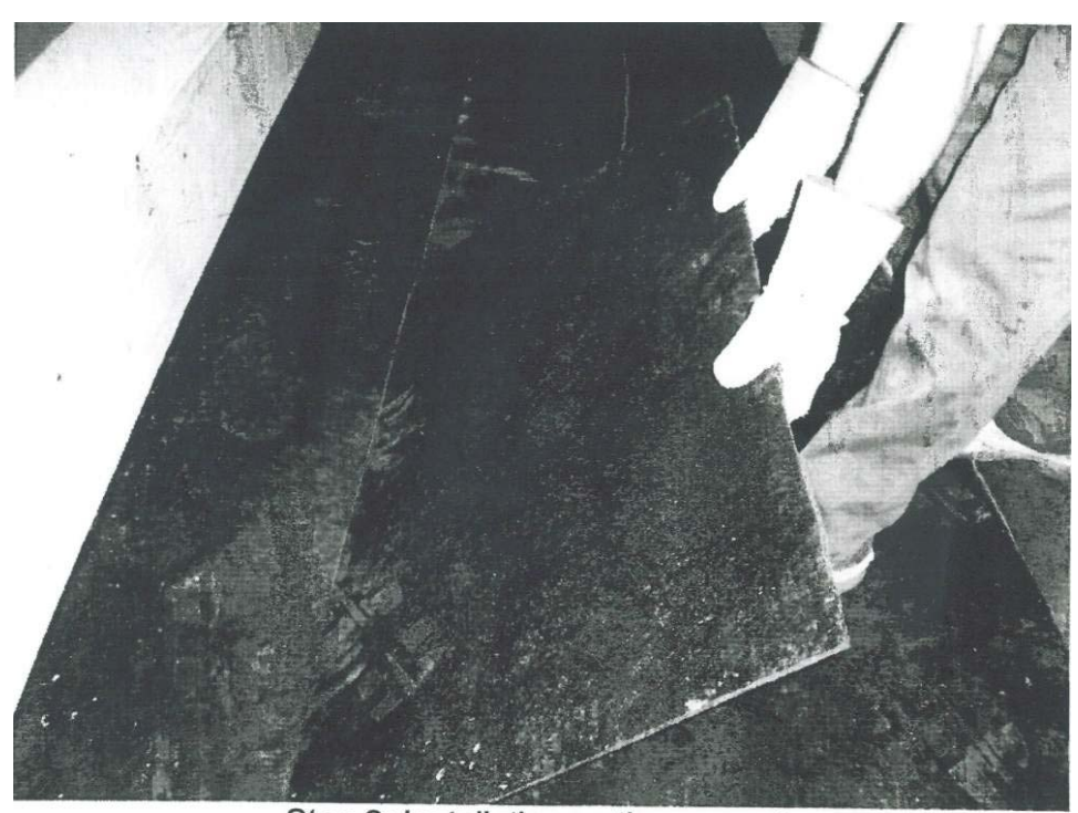
Step 2: Installation on the parapet.