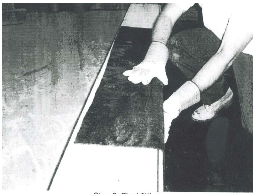
Step 3: Final fitting.