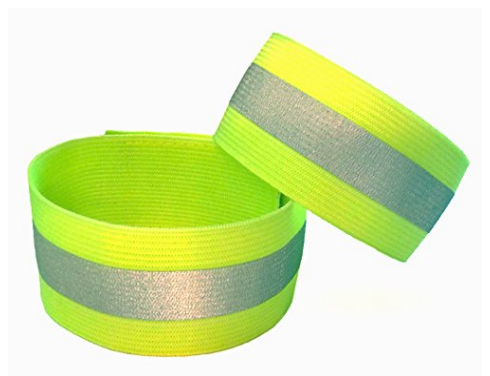
Example of ankle band meeting retroreflective standard