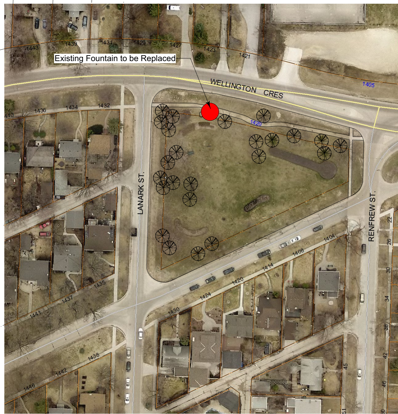
Fountain Location - Lanark Site