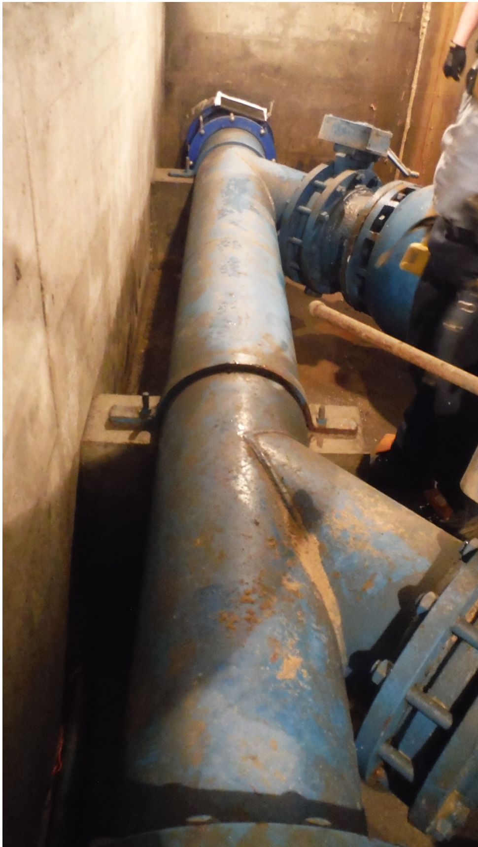
Figure 7 – Discharge Header