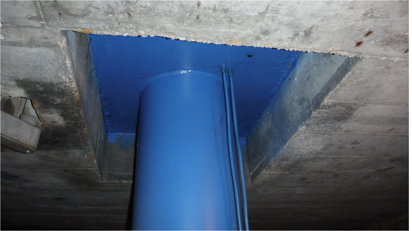
Figure 3 – Underside of Foundation Plate