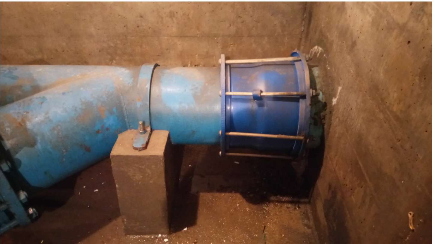
Figure 9 – Station Discharge