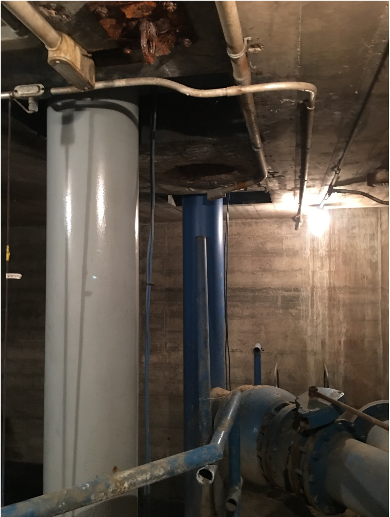
Figure 13 – Pump Columns