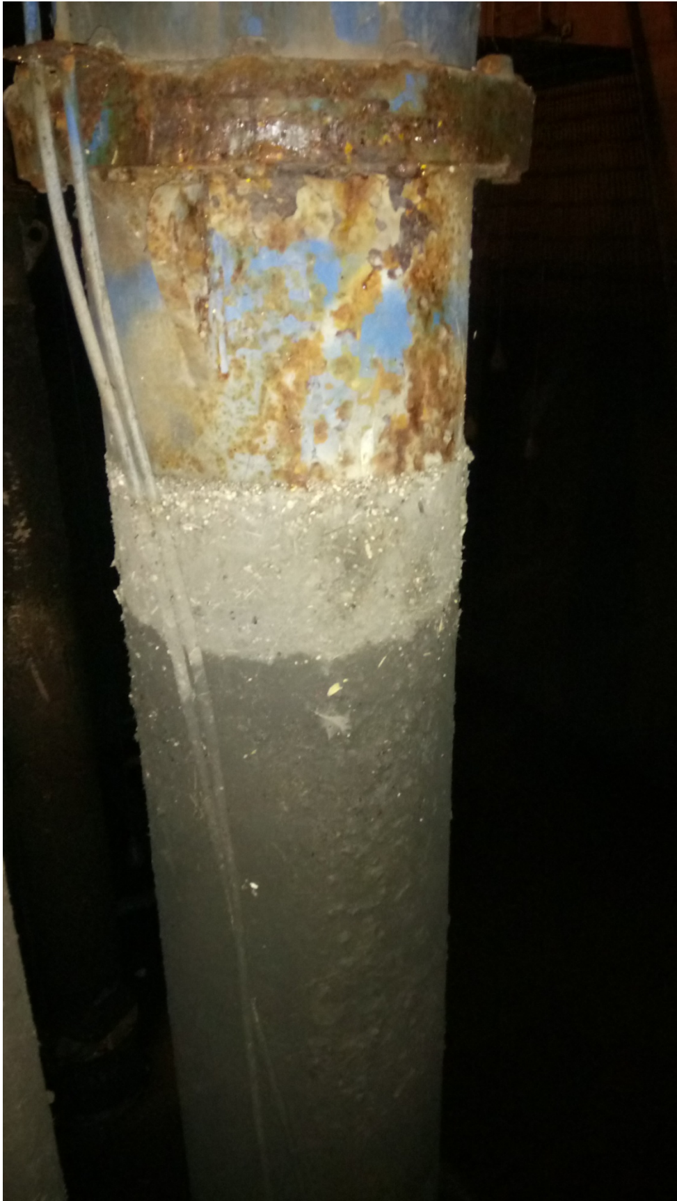
Figure 12 – Pump Column