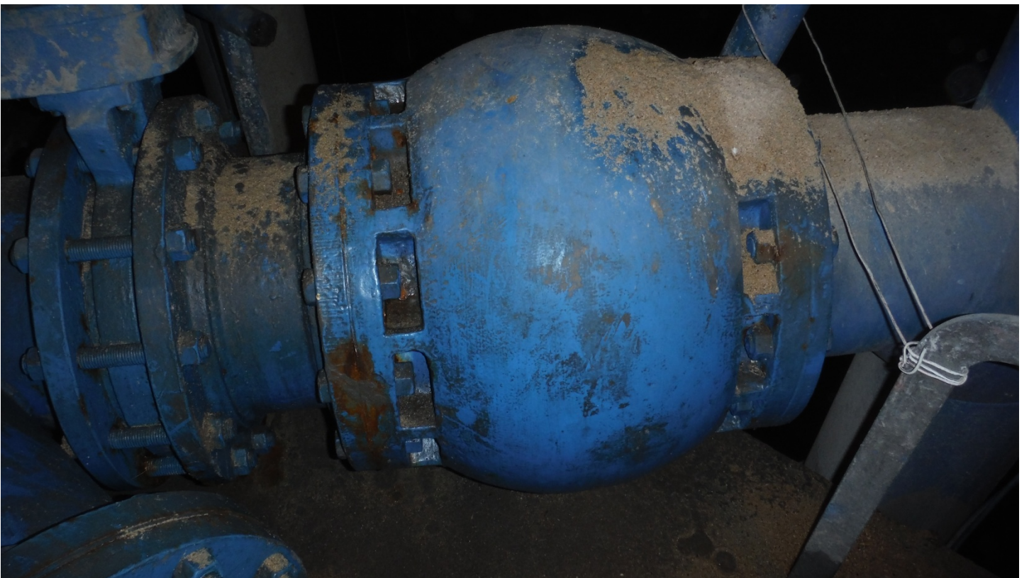
Figure 6 – Discharge Check Valve and Butterfly Valve