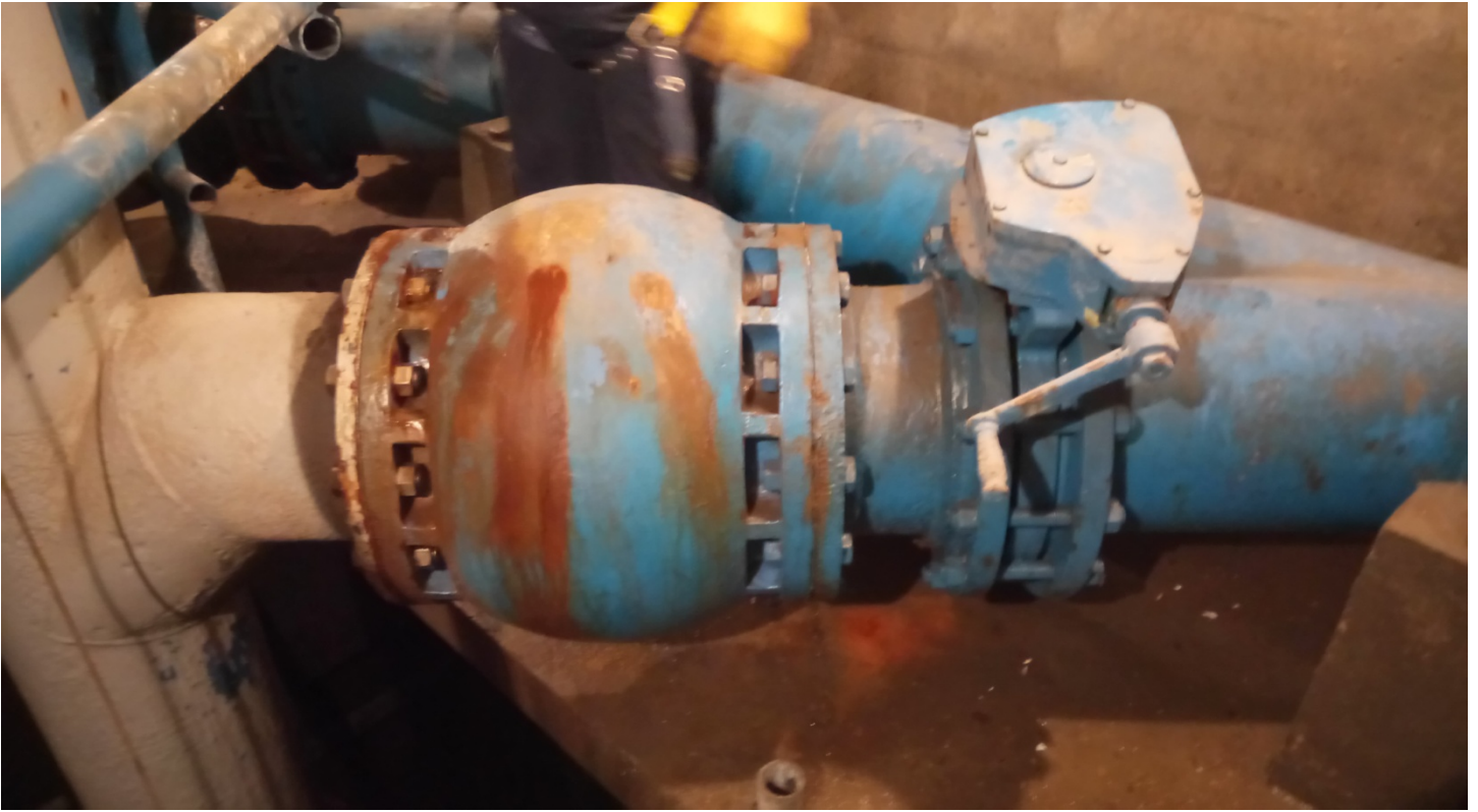
Figure 5 – Discharge Check Valve and Butterfly Valve