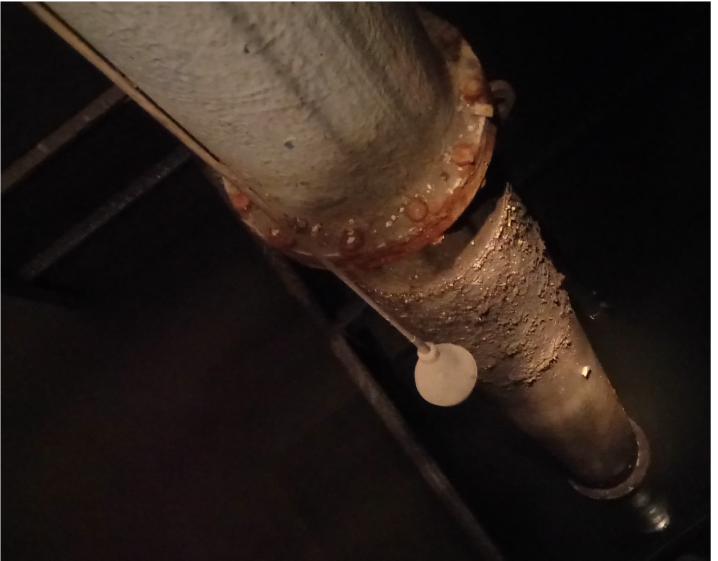
Figure 14 – Pump Column