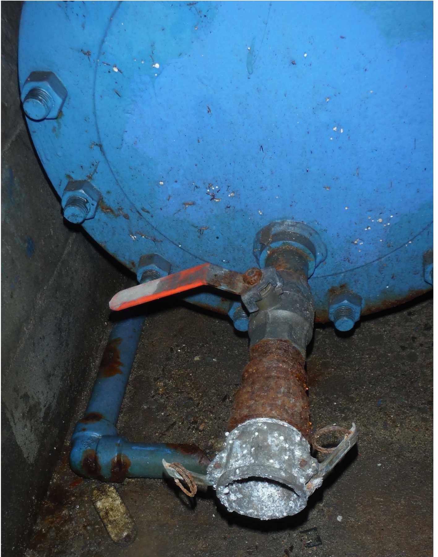
Figure 16 – Discharge Header Drain