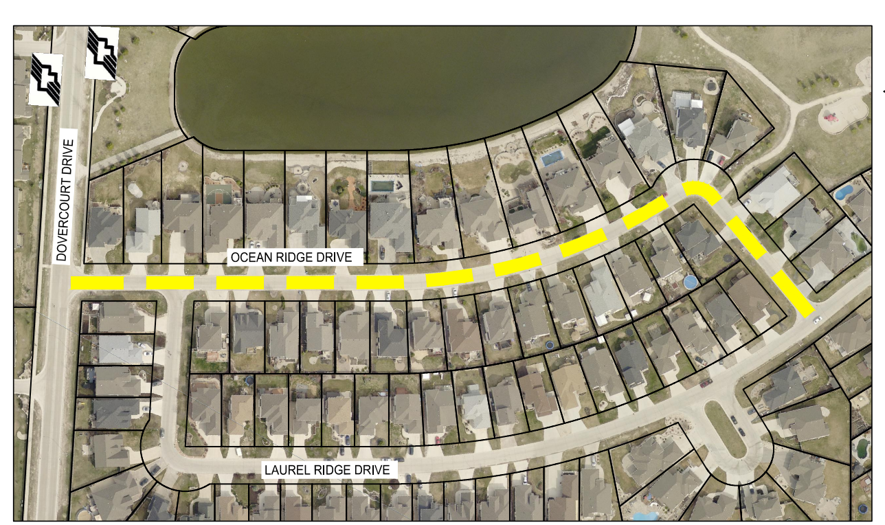
OCEAN RIDGE DRIVE - DOVERCOURT DRIVE TO LAUREL RIDGE DRIVE SCALE 1:2500