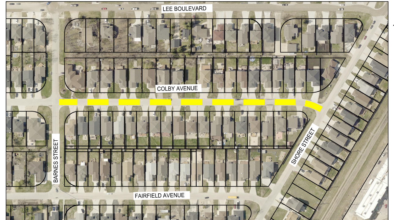
COLBY AVENUE - BARNES STREET TO SHORE STREET