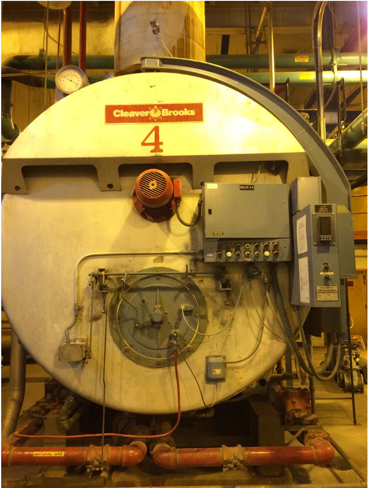
Figure 4: Boiler #4