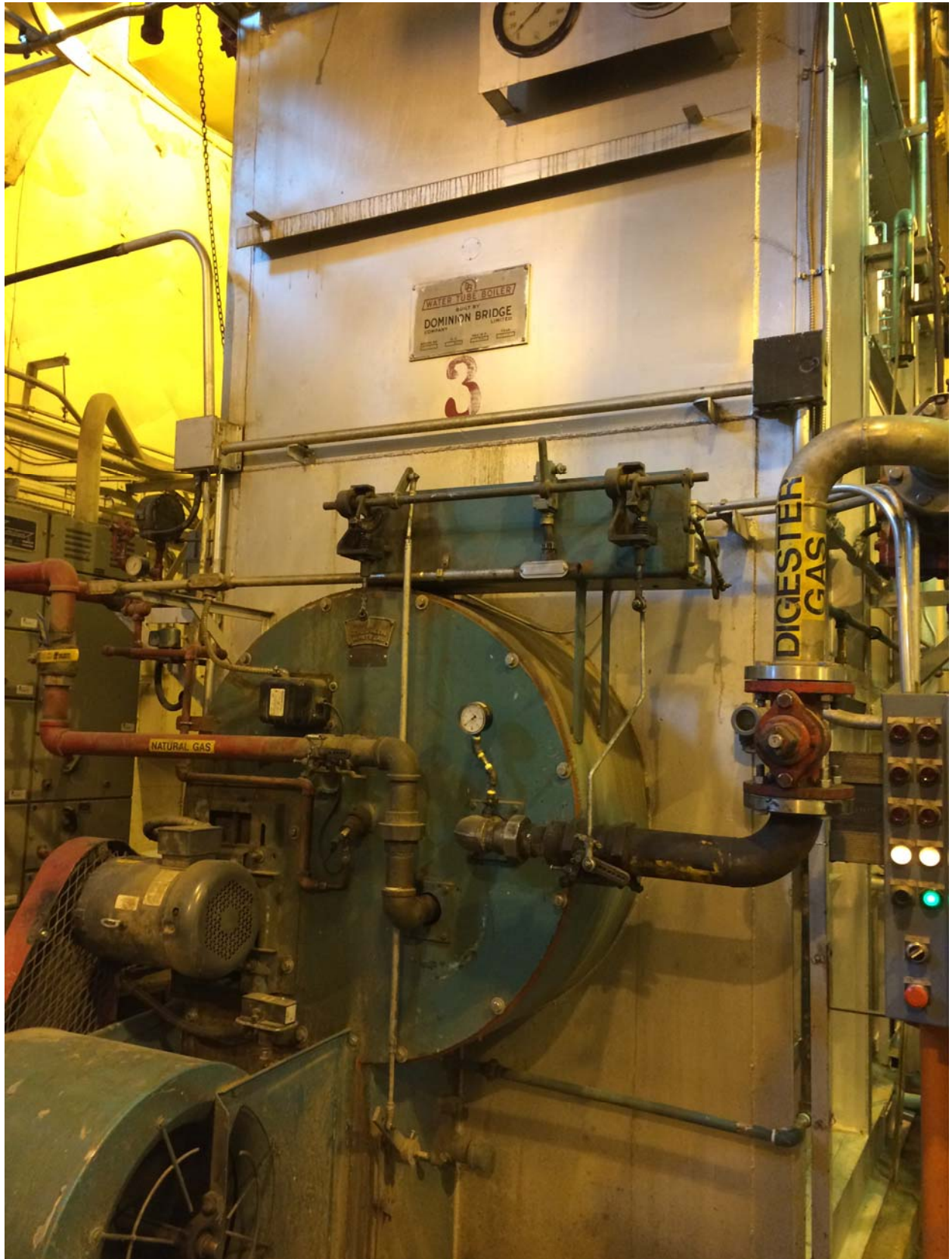
Figure 3: Boiler 3 combustion system (Typical of Boilers 1, 2 &3)