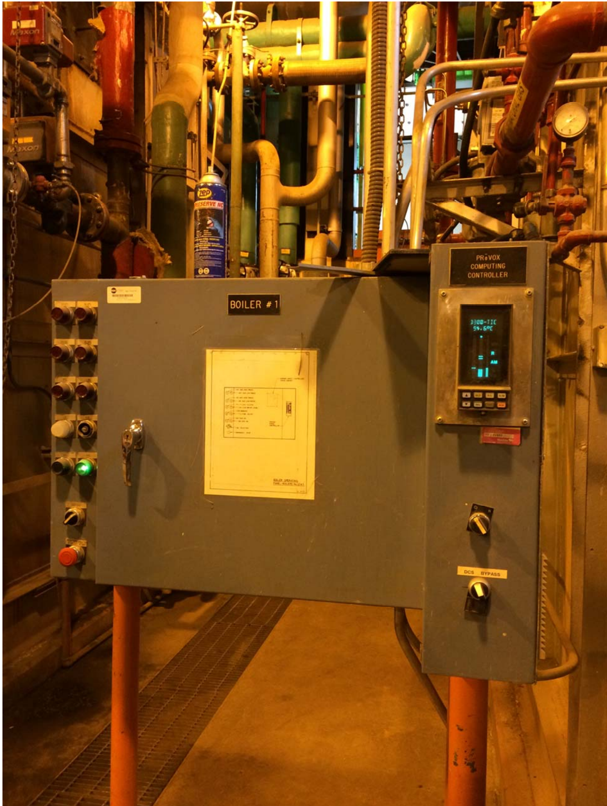
Figure 1: Boiler 1 Local Control Panel (Typical of Boilers 1, 2 & 3)