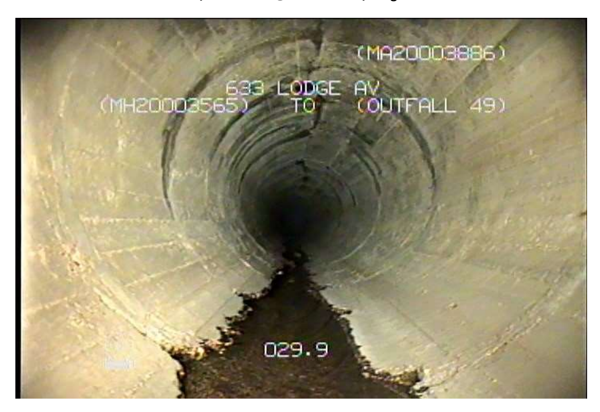
35.6 M D/S from MH @ Booth Drive/Lodge Avenue