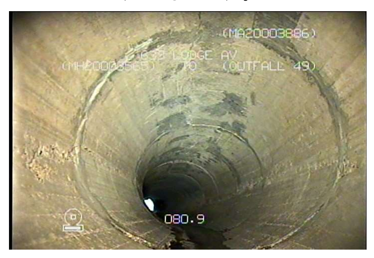
87.5 M D/S from MH @ Booth Drive/Lodge Avenue