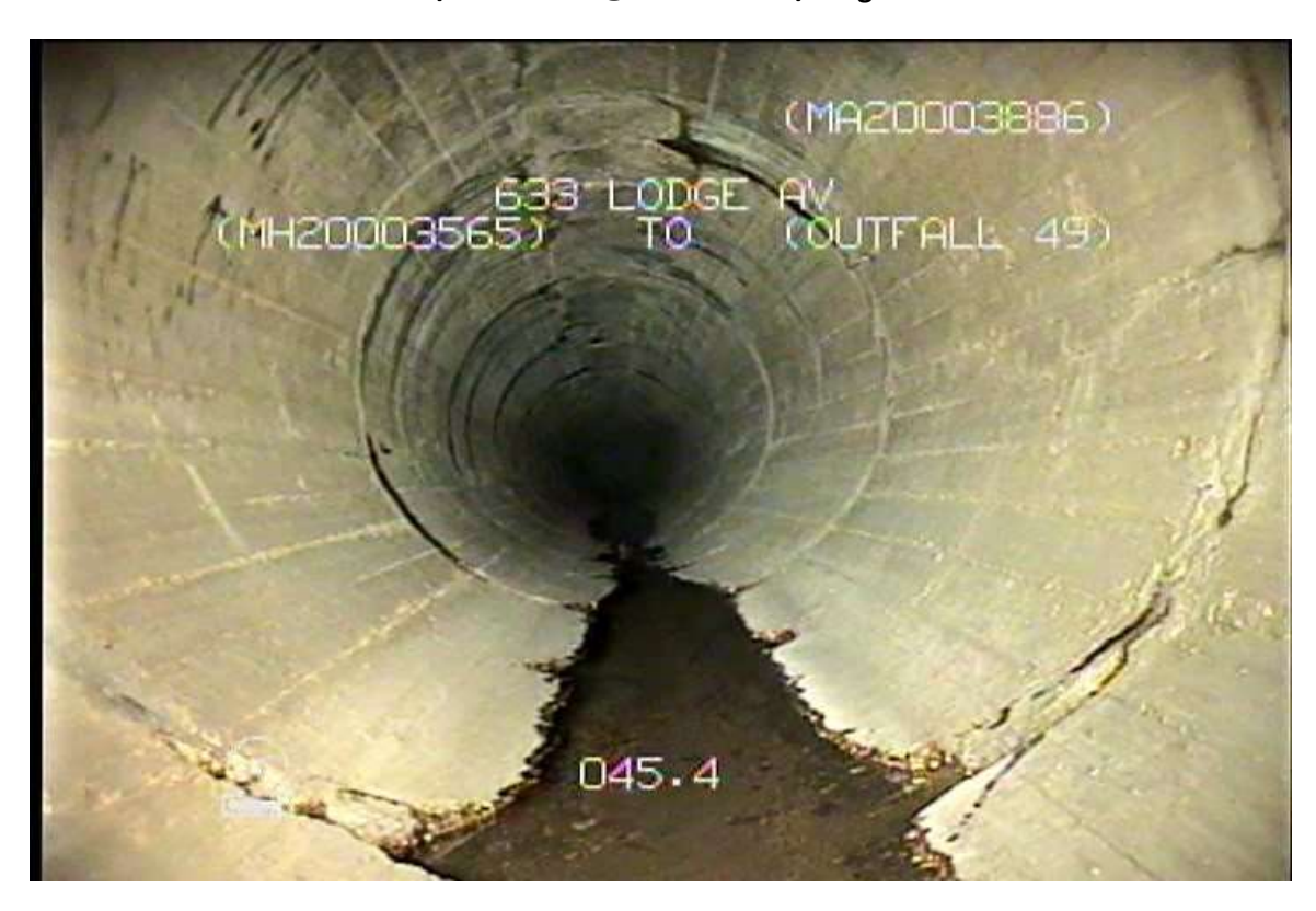
63.8 M D/S from MH @ Booth Drive/Lodge Avenue