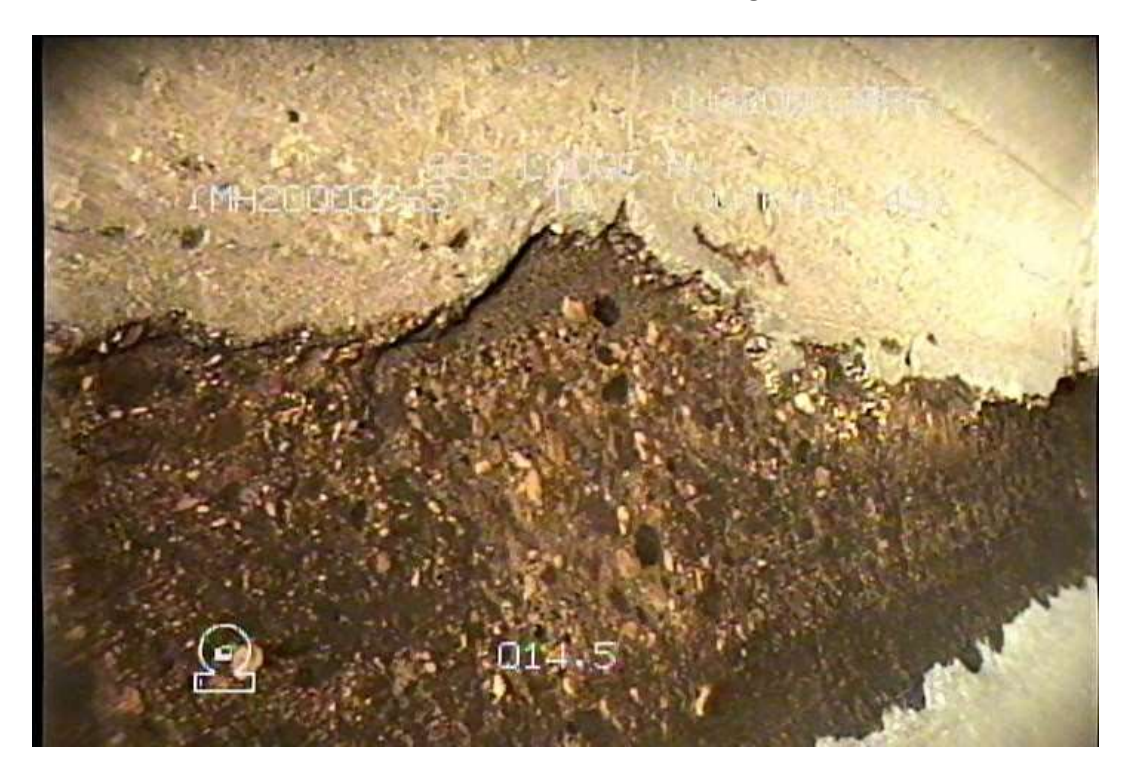
19.2 M D/S from MH @ Booth Drive/Lodge Avenue