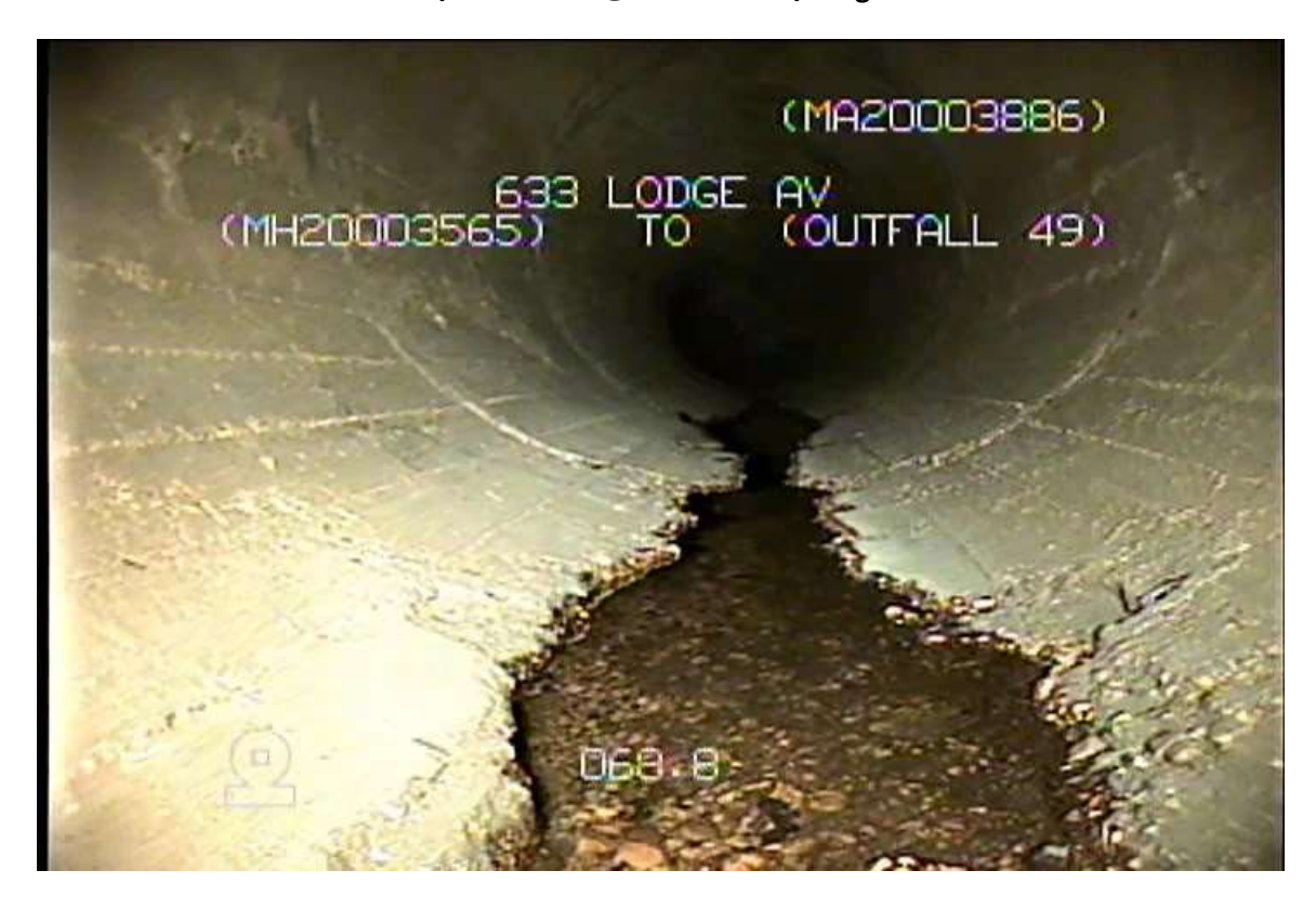
79.4 M D/S from MH @ Booth Drive/Lodge Avenue