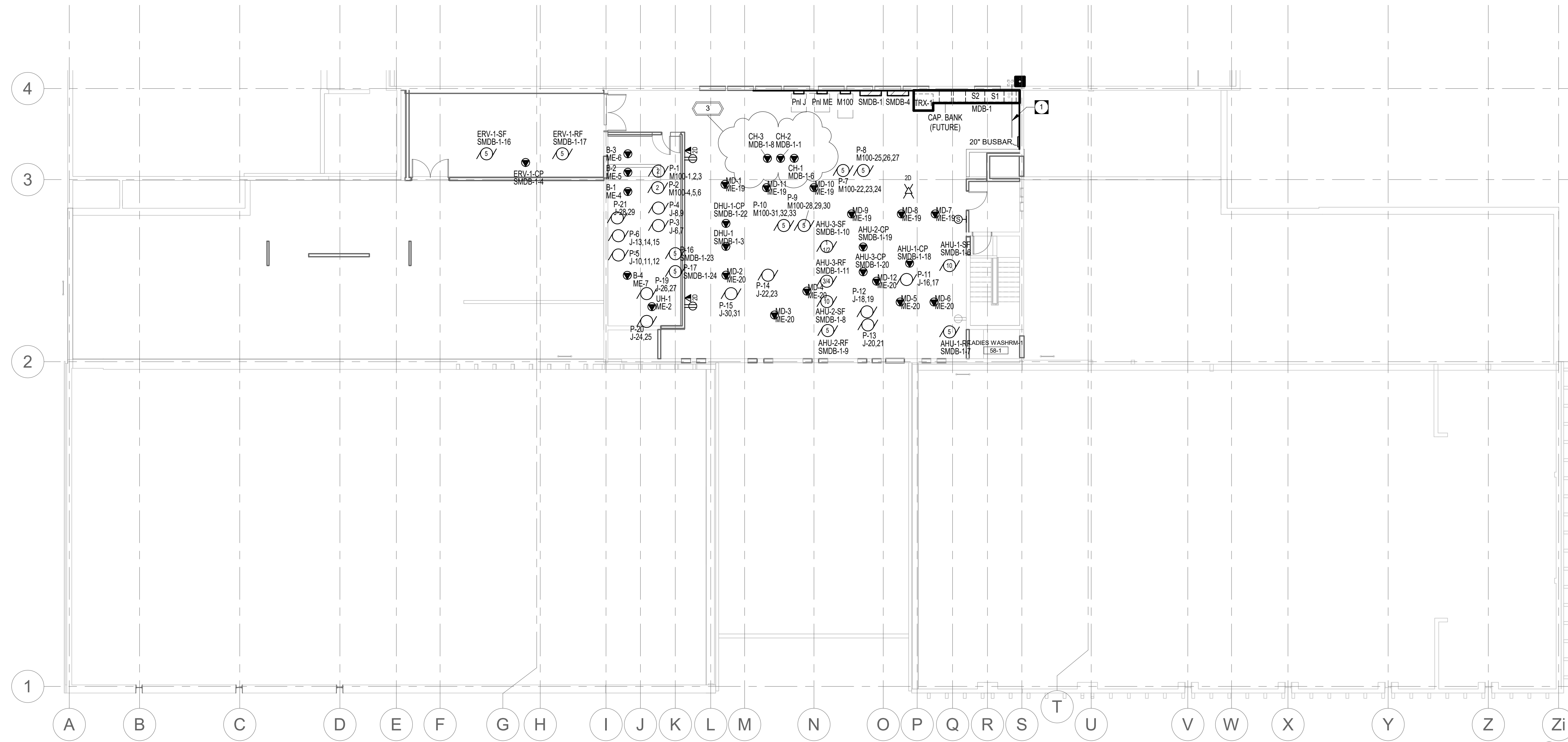
LEVEL 2 - POWER RENOVATION 1 3/32" = 1'-0" EP2.2-R1