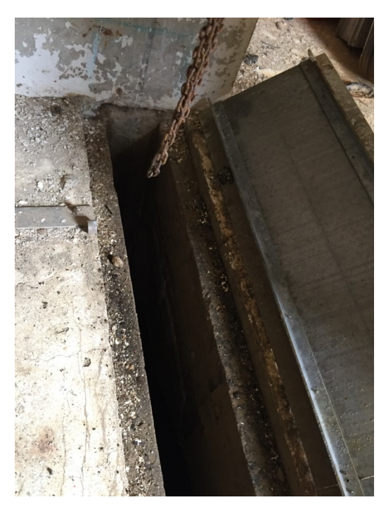
Photograph 19. ↑ Mile 73.69 – Existing Stop Log Opening and Cover