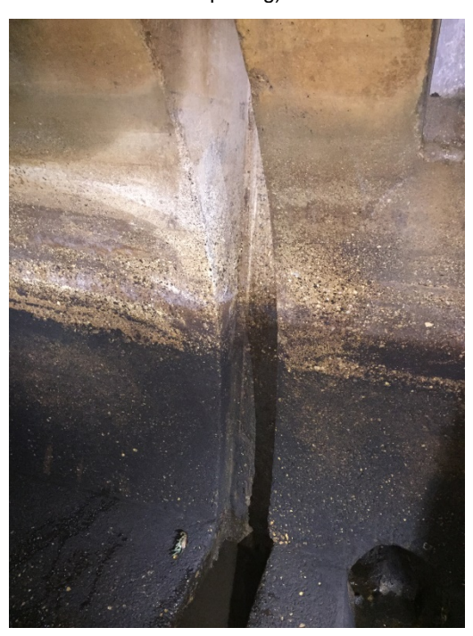
Photograph 24. ↑ Mile 73.69 – Existing Groove (Side of Aqueduct)