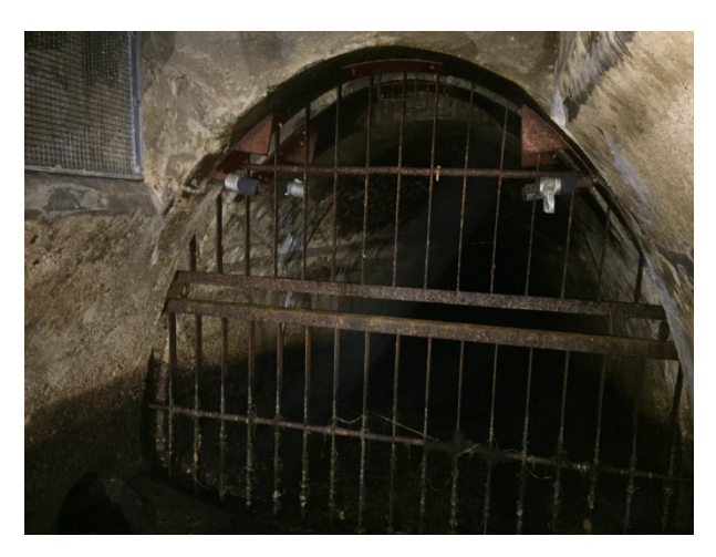
Photograph 8. ♠ Mile 17.05 – Existing Groove (Grating to be Removed)