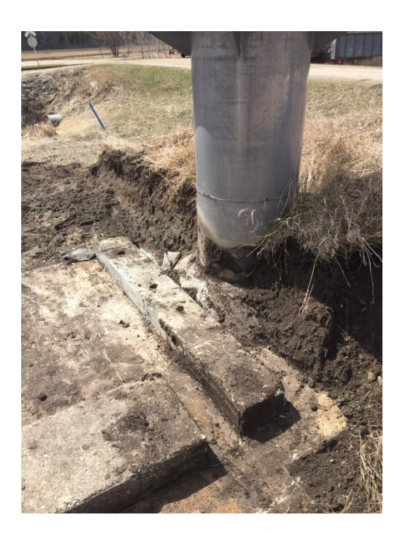
Photograph 11. ↑ Mile 64.14 – Concrete Cover on Stop Log Opening (To be removed by City prior to construction)