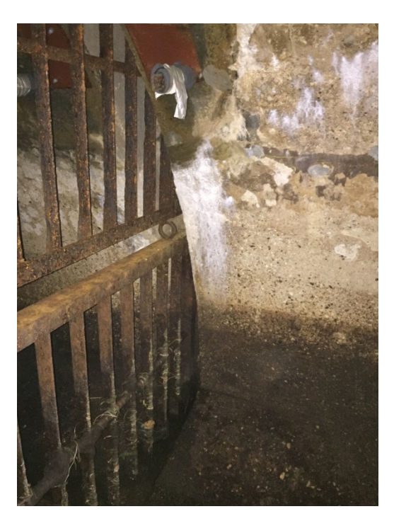
Photograph 7. ↑ Mile 17.05 – Existing Groove (Grating to be Removed)