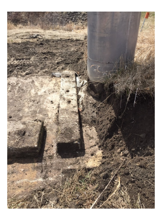
Photograph 10. ↑ Mile 64.14 – Concrete Cover on Stop Log Opening (To be removed by City prior to construction)