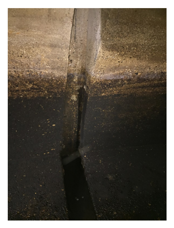
Photograph 21. ↑ Mile 73.69 – Existing Groove (Side of Aqueduct)