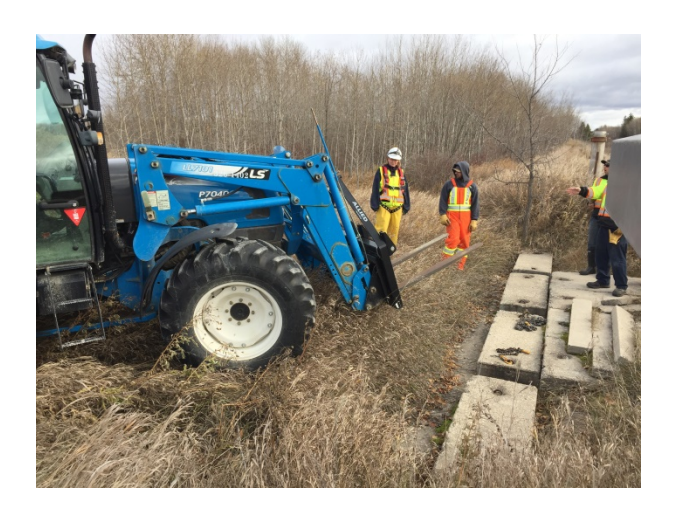
Photograph 9. ↑ Mile 64.14 – General Site (Concrete Cover not Shown – To be Removed by City prior to Construction)