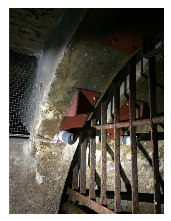
Photograph 5. ↑ Mile 17.05 – Existing Groove (Grating to be Removed)