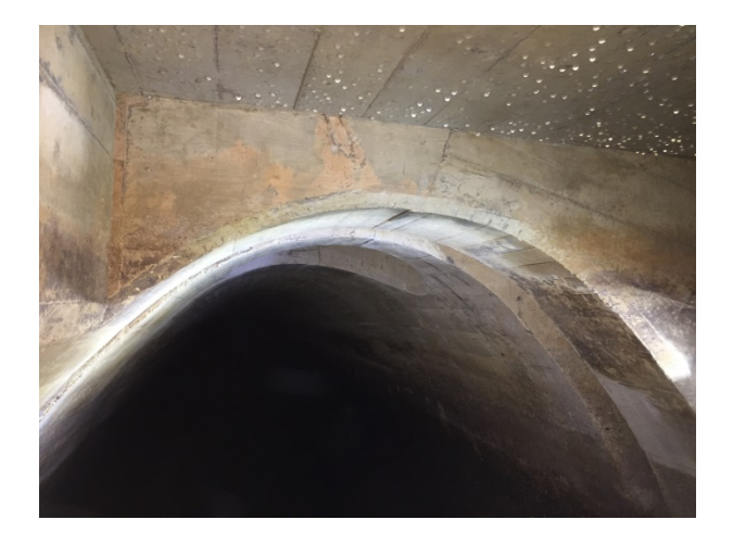
Photograph 14. ↑ Mile 64.14 – Existing Groove (Top of Aqueduct)