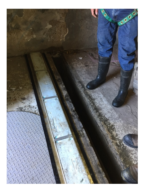
Photograph 1. ↑ Mile 17.05 – Existing Stop Log Opening and Cover