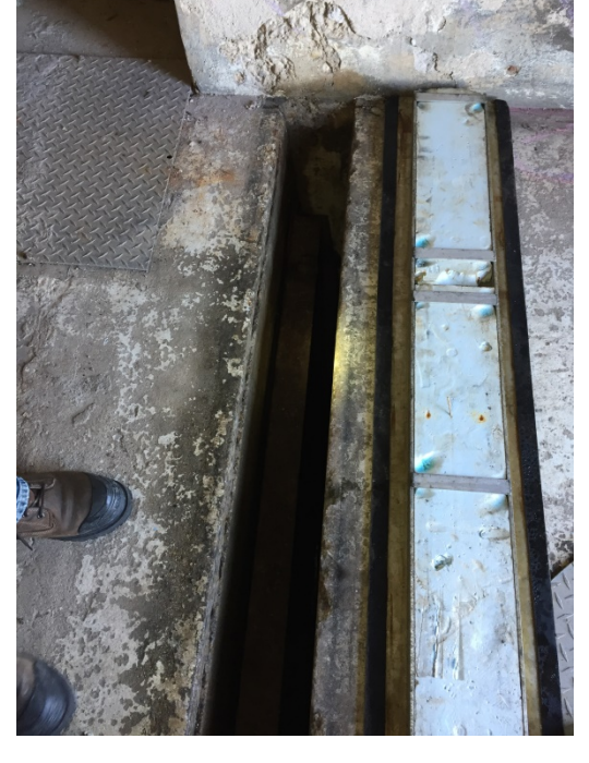
Photograph 2. ↑ Mile 17.05 – Existing Stop Log Opening and Cover