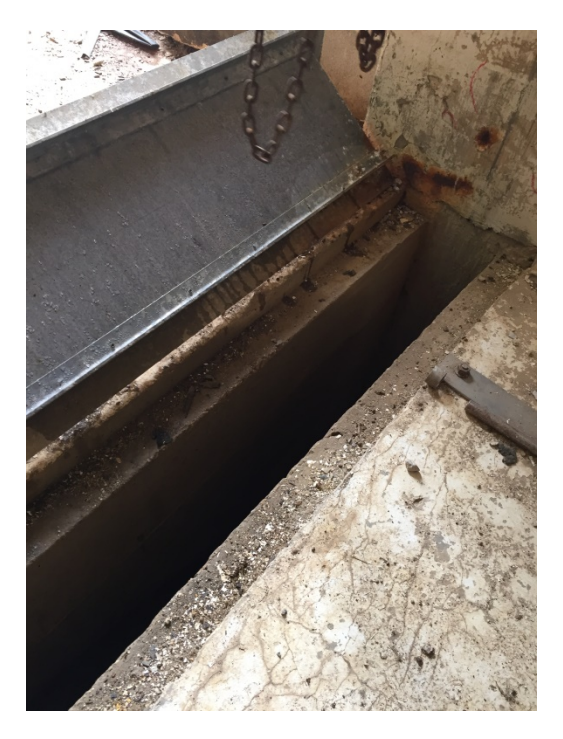
Photograph 20. ↑ Mile 73.69 – Existing Stop Log Opening and Cover