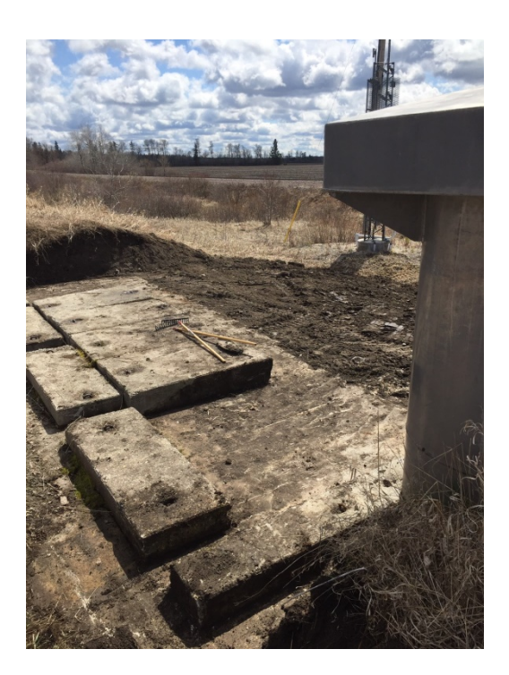
Photograph 12. ↑ Mile 64.14 – General Site