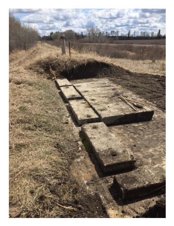
Photograph 13. ↑ Mile 64.14 – General Site