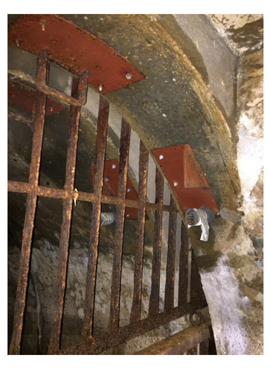
Photograph 6. ↑ Mile 17.05 – Existing Groove (Grating to be Removed)