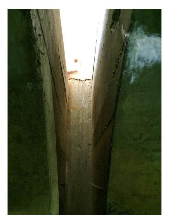
Photograph 22. ↑ Mile 73.69 – Existing Groove (Top Corner, Below Floor Opening)