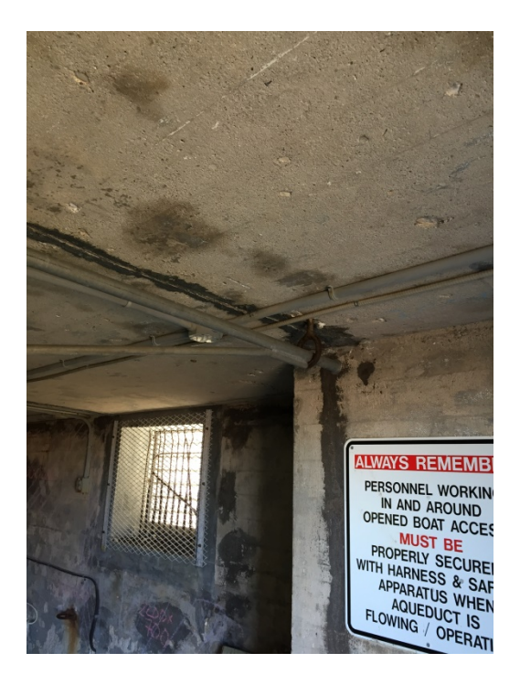
Photograph 4. ↑ Mile 17.05 – Boathouse Interior Wall and Roof