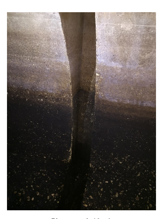
Photograph 16. ↑ Mile 64.14 – Existing Groove (Side of Aqueduct)