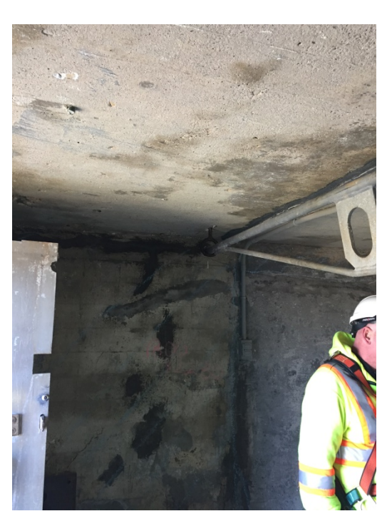
Photograph 3. ↑ Mile 17.05 – Boathouse Interior Wall and Roof