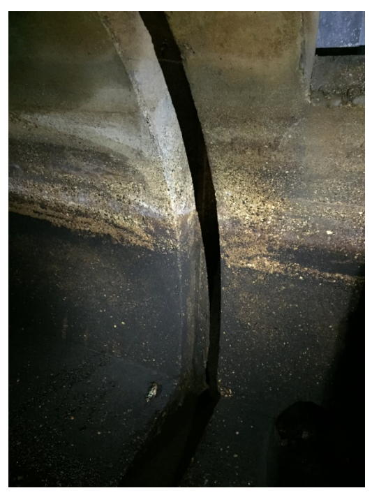
Photograph 23. ↑ Mile 73.69 – Existing Groove (Side of Aqueduct)