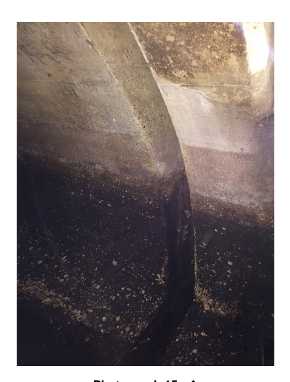
Photograph 15. ↑ Mile 64.14 – Existing Groove (Side of Aqueduct)