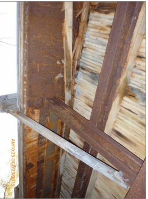
EXISTING CONDITION OF A TIMBER NAILER ON SPAN 8