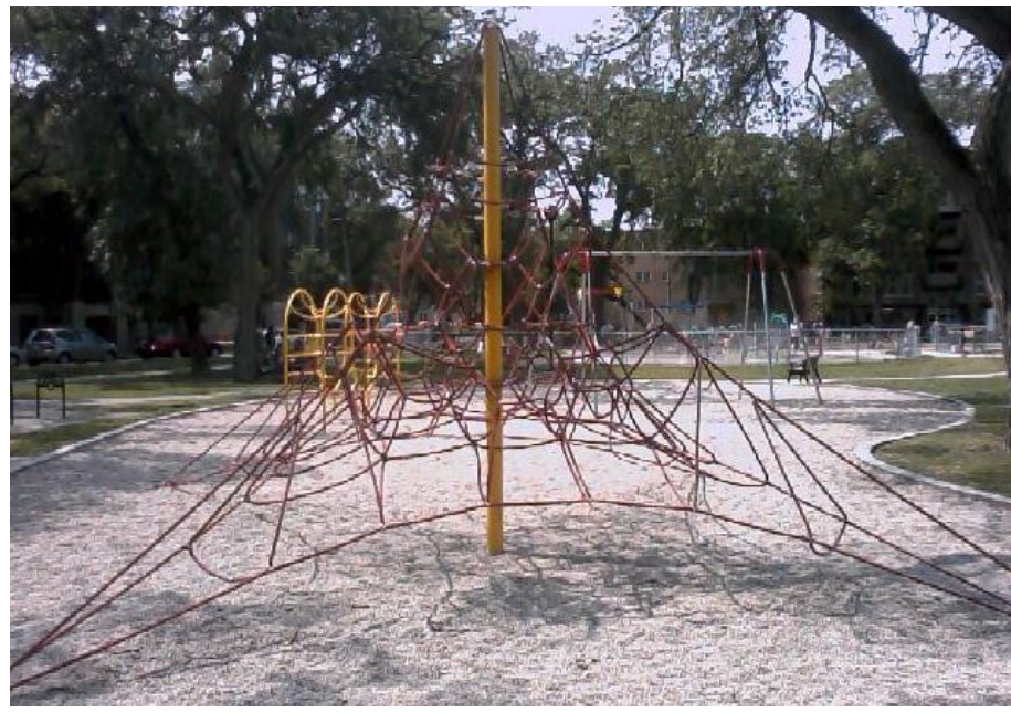
NET CLIMBER TO BE REMOVED