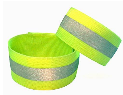
Example of ankle band meeting retroreflective standard