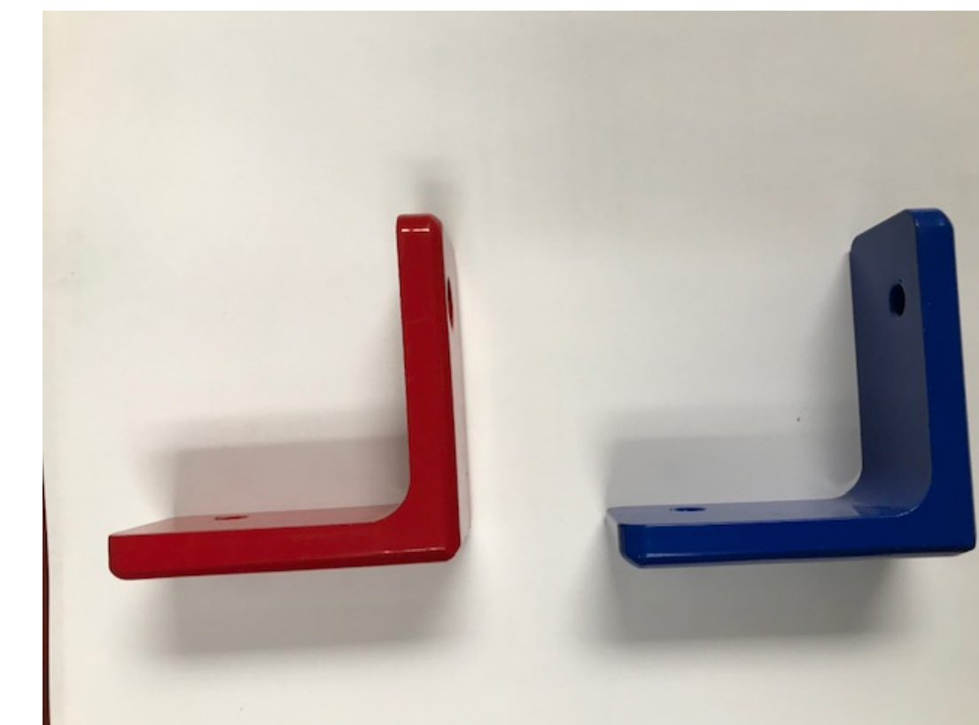
Skate Stops Typ.