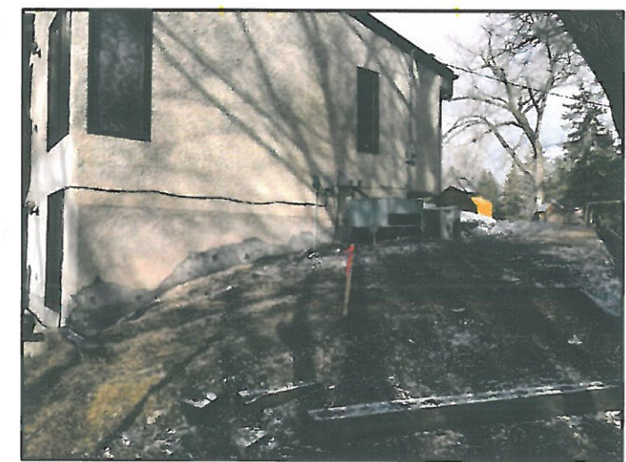
PHOTO 2 - FACING NORTHWEST, SHOWING GRADE ON THE EAST SIDE OF THE EXISTING HOUSE, WHICH CAN BE USED FOR SITE ACCESS.