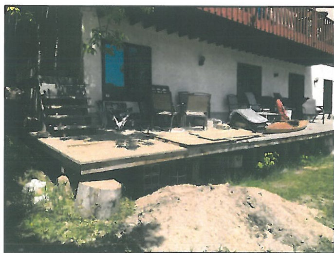
PHOTO 3 - FACING NORTH, SHOWING EXISTING DECK AND GRADE AT THE FRONT OF THE DECK.