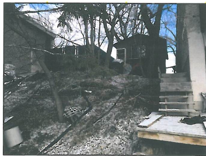
PHOTO 1 - FACING NORTHWEST, SHOWING EXISTING GRADE AND TREES ON THE WEST SIDE OF THE EXISTING HOUSE.