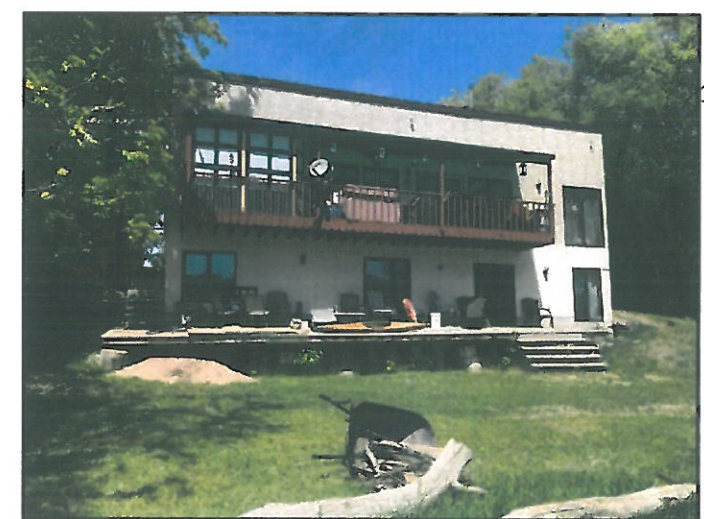
PHOTO 4 - FACING NORTH, SHOWING EXISTING GRADE NEAR THE PROPOSED FLOOD WALL.