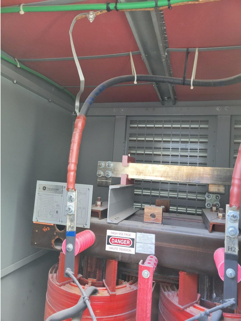
Transformer LST-4 Photo 1