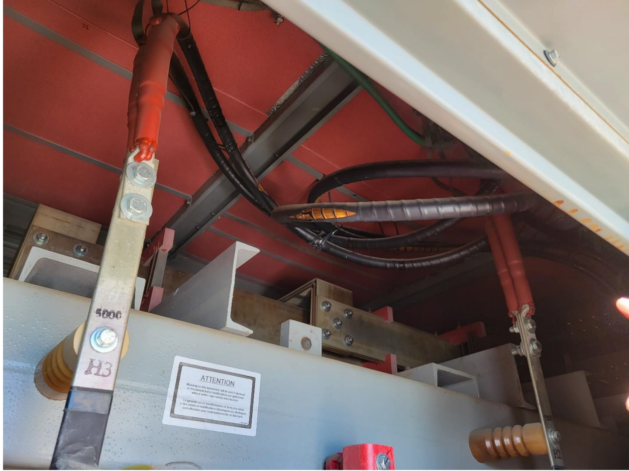
Transformer UVT-2 Photo 1

These photos are from 2023-03-17 and are more recent than the photos shown on Drawing 1-0101U-E0021-001.