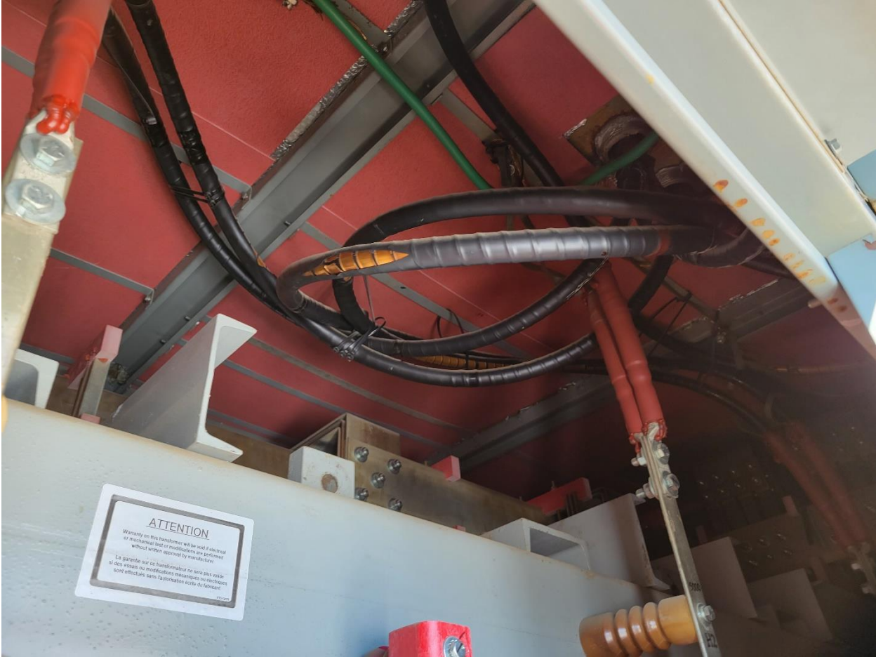
Transformer UVT-2 Photo 2