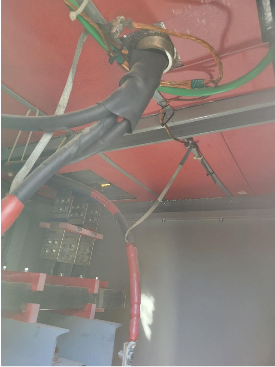
Transformer LST-4 Photo 2