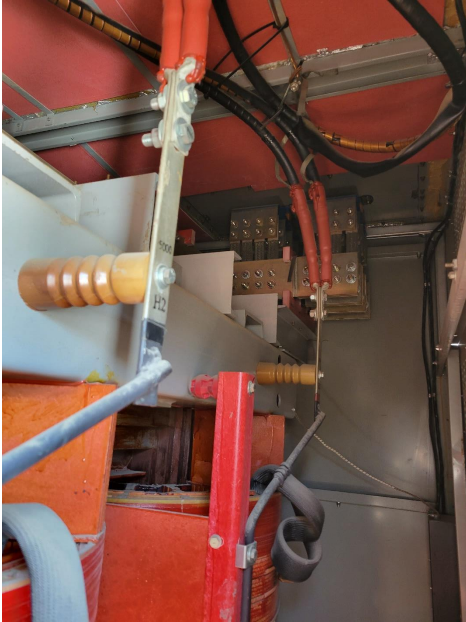
Transformer UVT-2 Photo 3