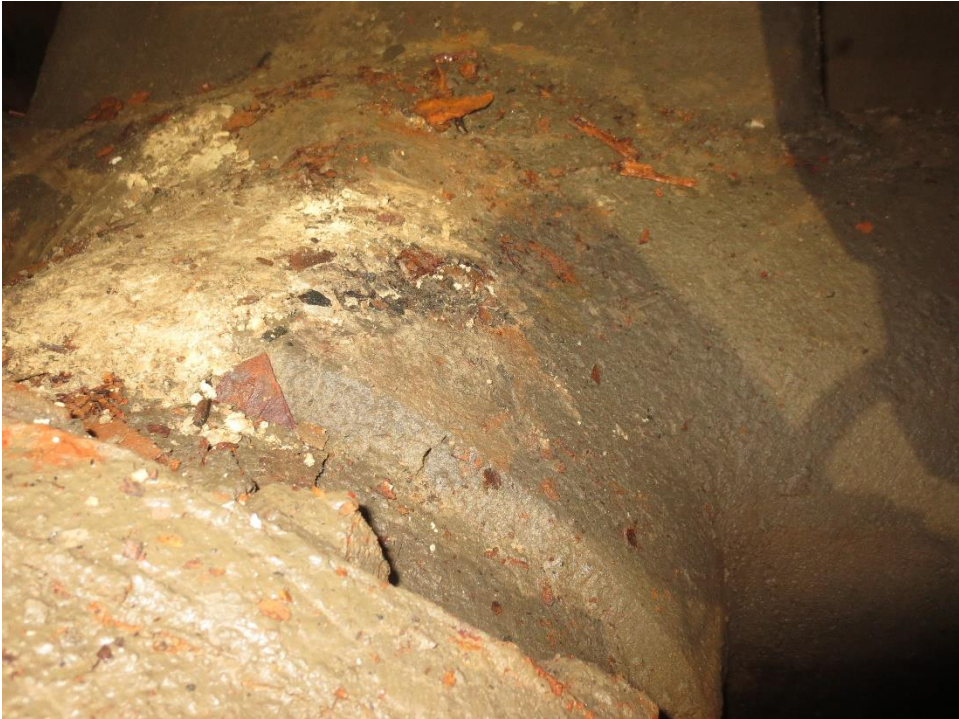
Valve Pit 139 – Feeder Main