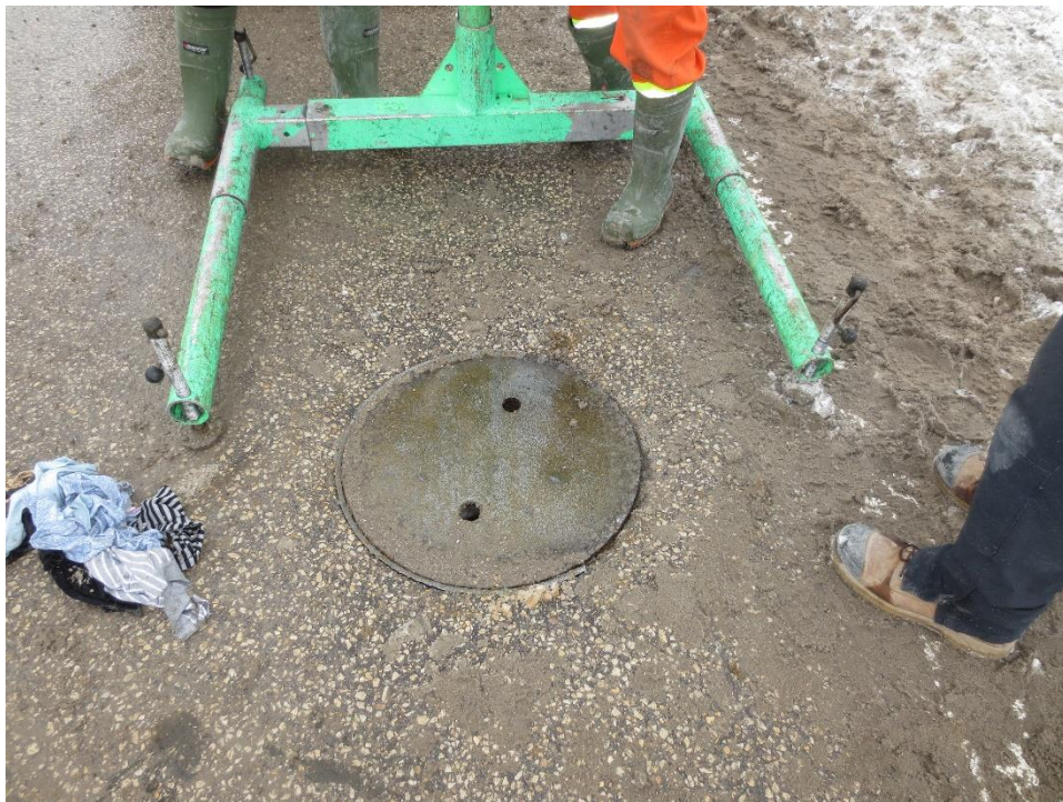
Valve Pit 138 – Manhole Cover