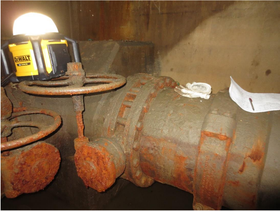
Valve Pit 139 – Flanged Butterfly Valve (2)