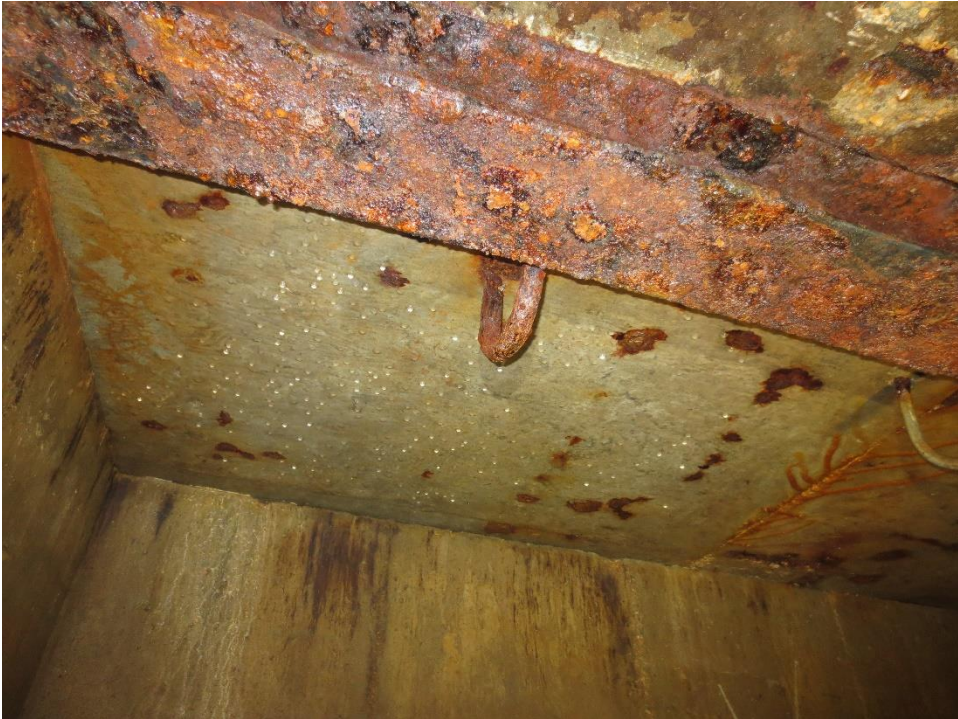
Valve Pit 139 – Steel Support Beam