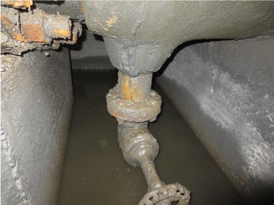
Valve Pit 138 - Drain Valve