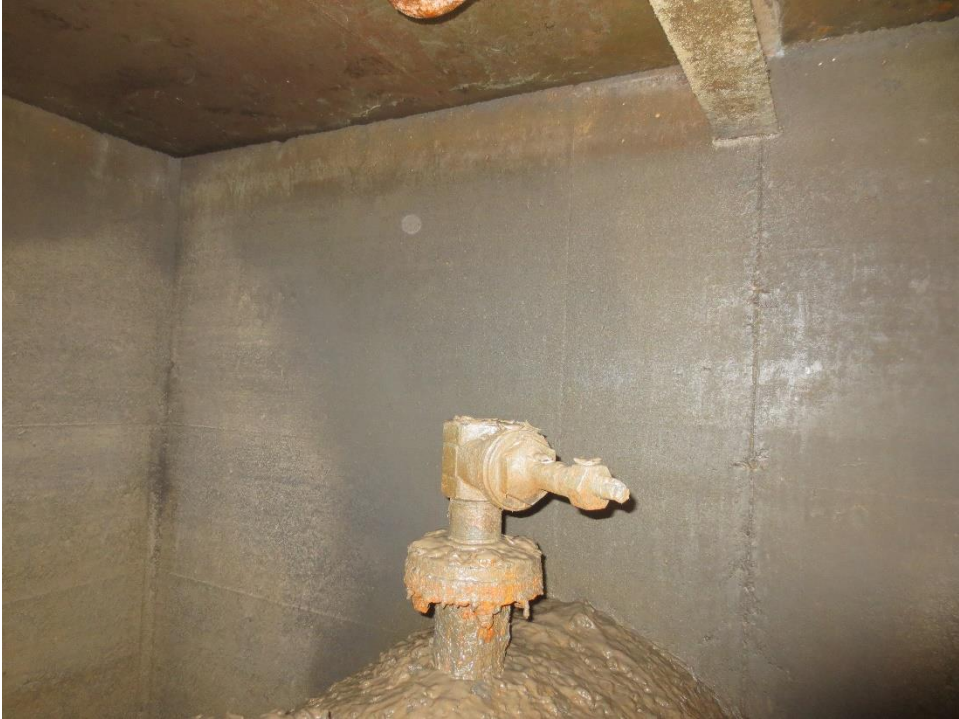
Valve Pit 138 - Blow off Valve