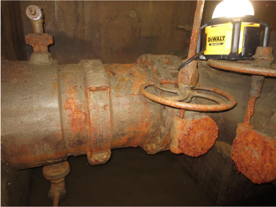
Valve Pit 139 – Flanged Butterfly Valve (1)