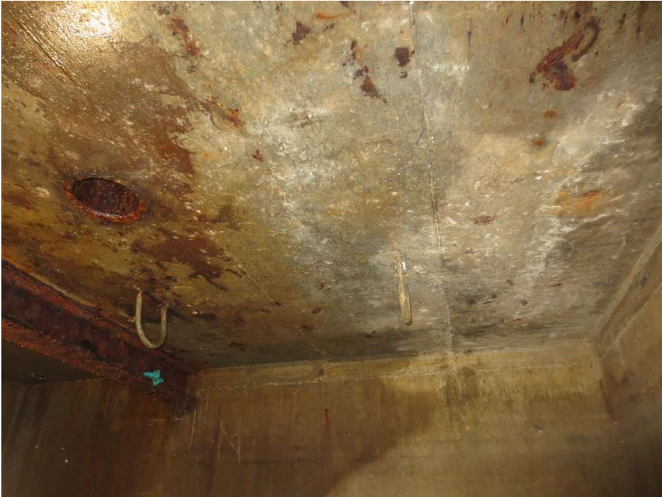
Valve Pit 139 – Ceiling