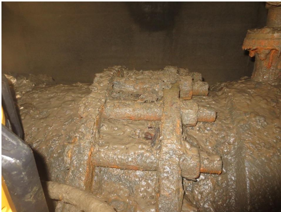
Valve Pit 138 – Flanged Butterfly Valve (2)