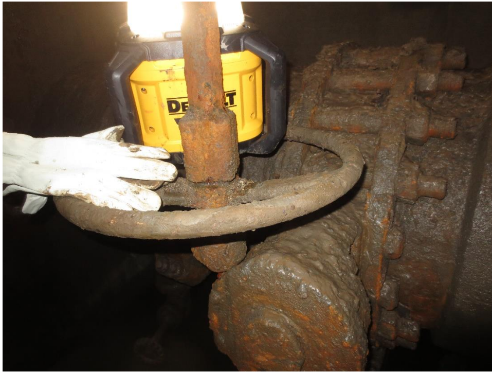
Valve Pit 138 – Flanged Butterfly Valve (1)