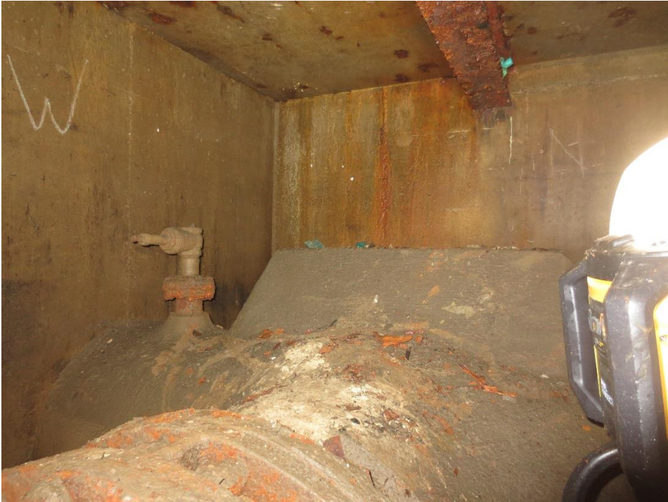
Valve Pit 139 – Corner