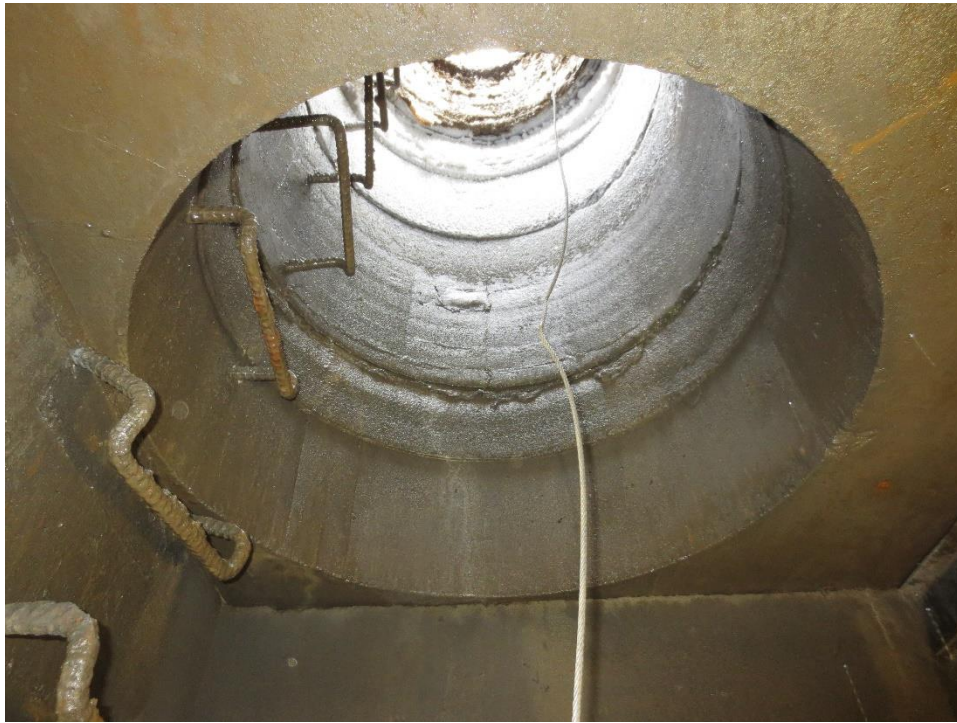
Valve Pit 138 – Access Shaft