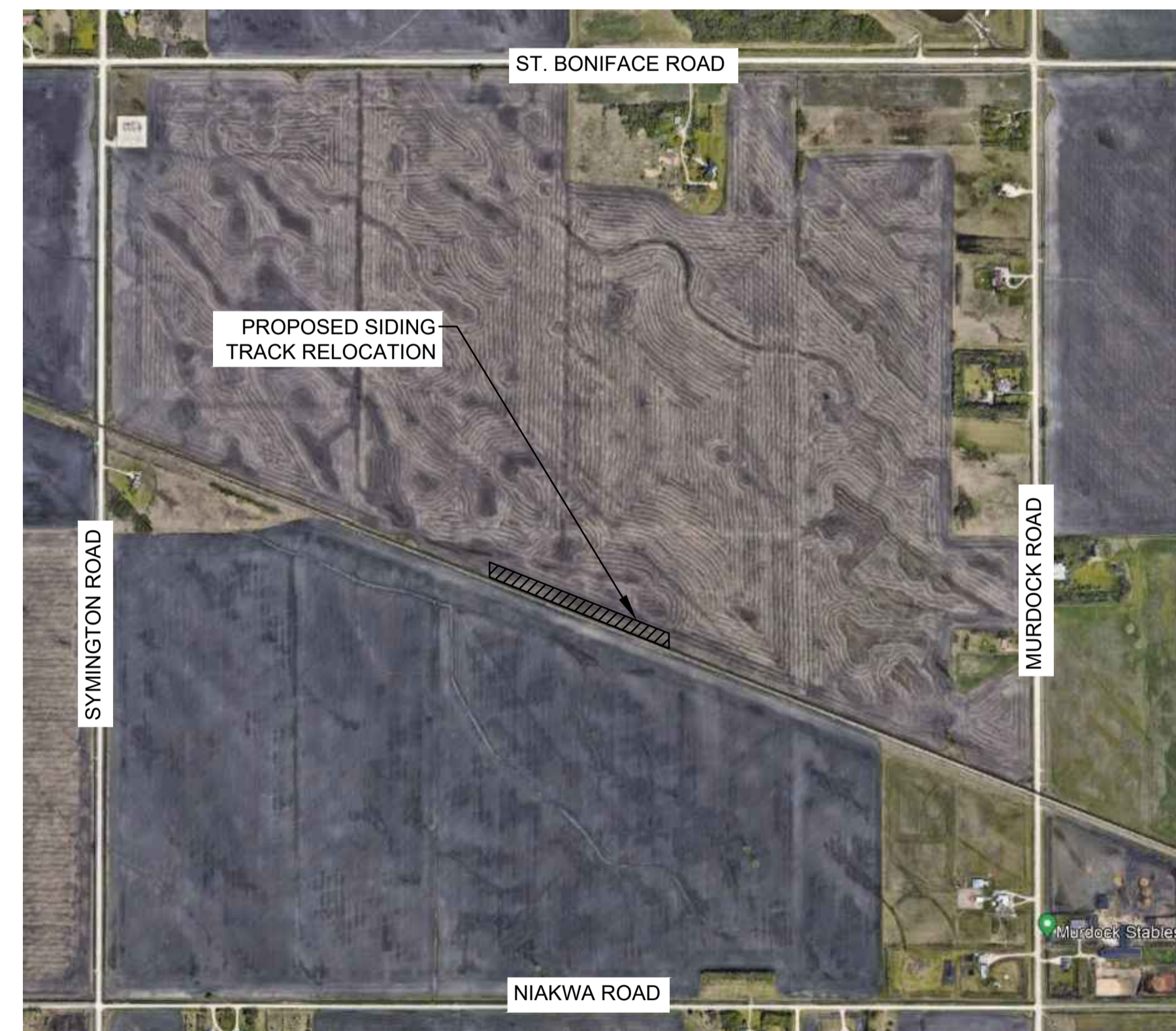
SITE LOCATION MAP N.T.S