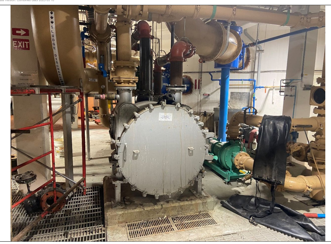
Digester Spiral Exchanger 11

Tomplete Version: Combined CSC 2022 0F 10