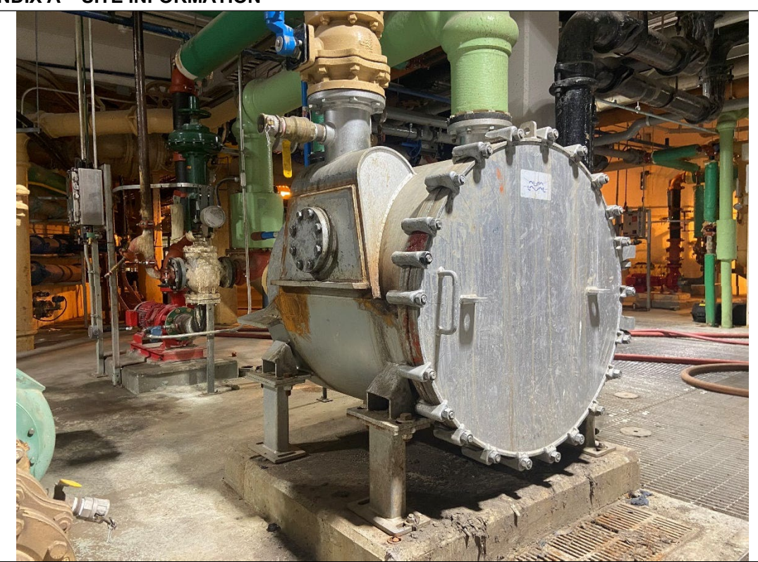
Digester Spiral Exchanger 09