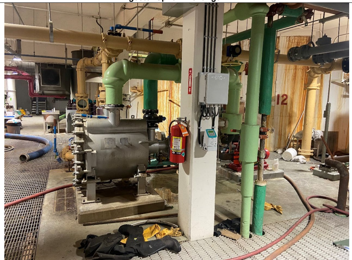
Digester Spiral Exchanger 12