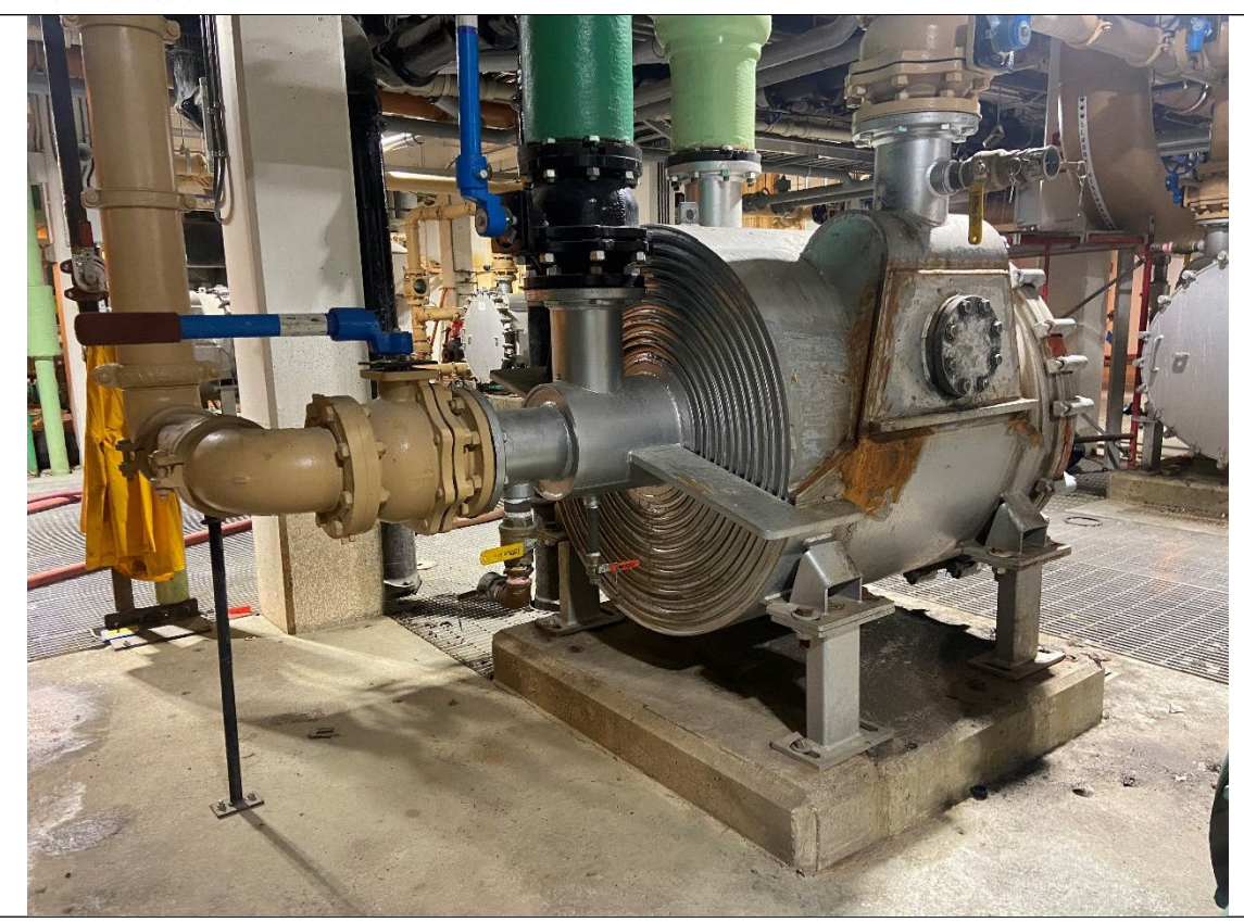
Digester Spiral Exchanger Rear Connections