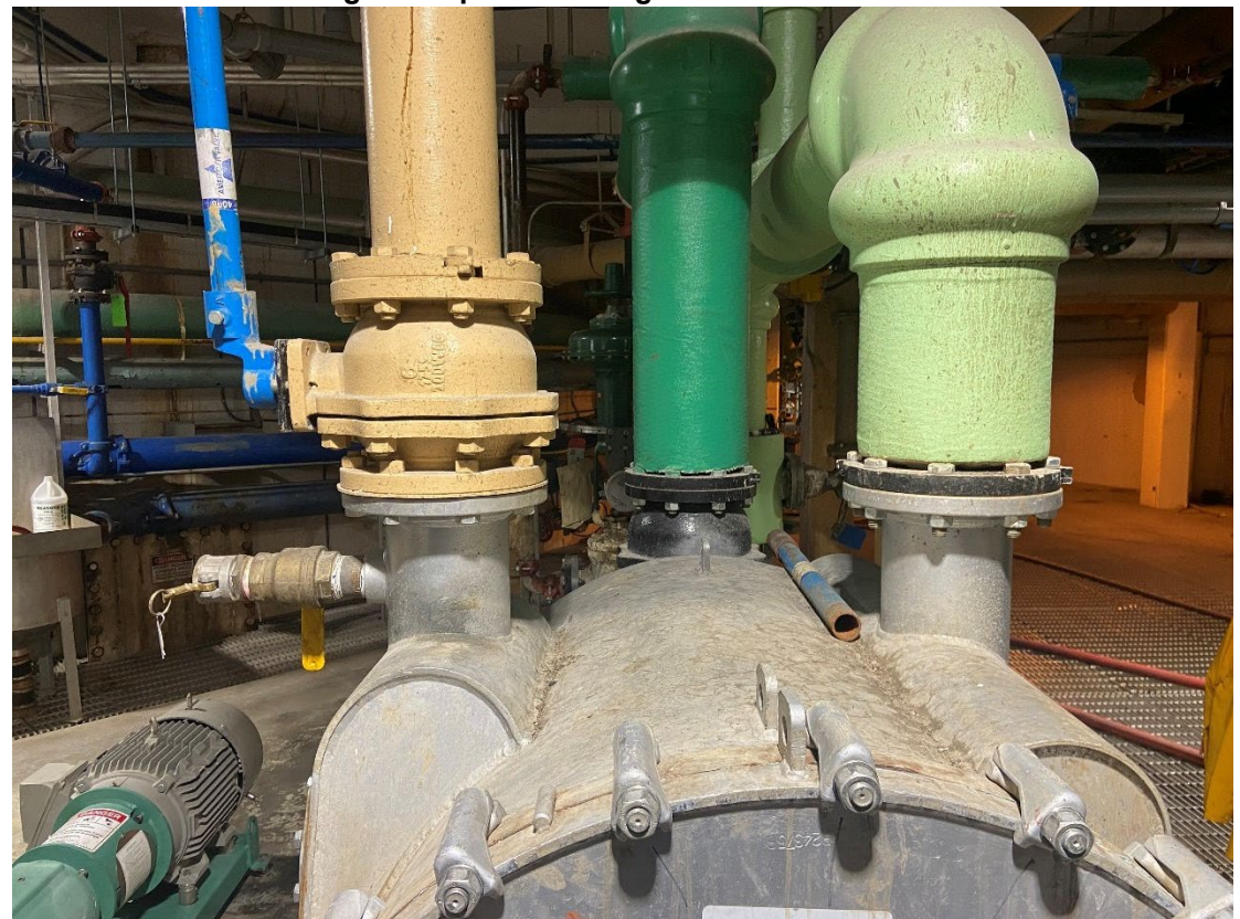
Digester Spiral Exchanger Top Connections