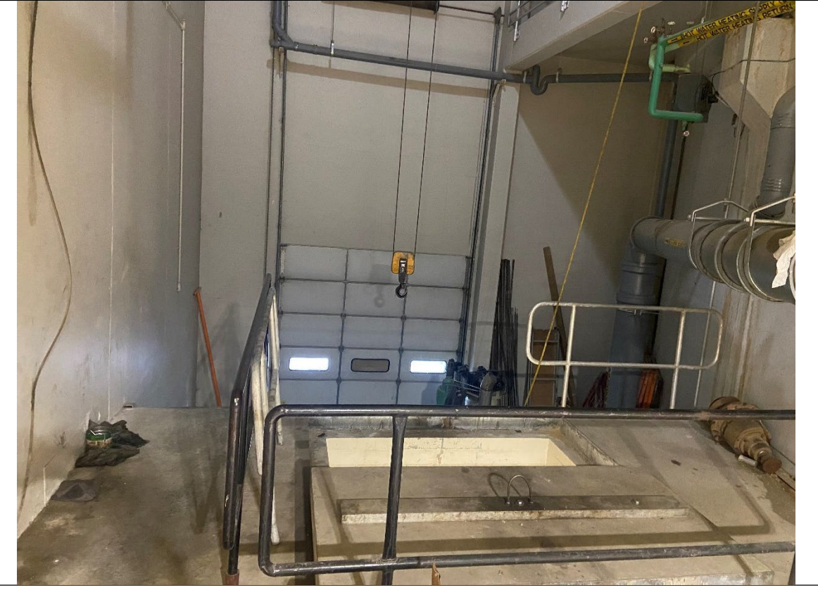
Exchanger Unload Location Inside