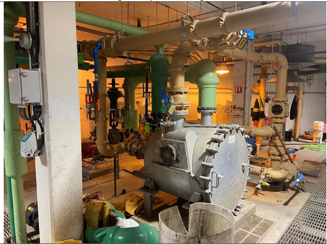
Digester Spiral Exchanger 10