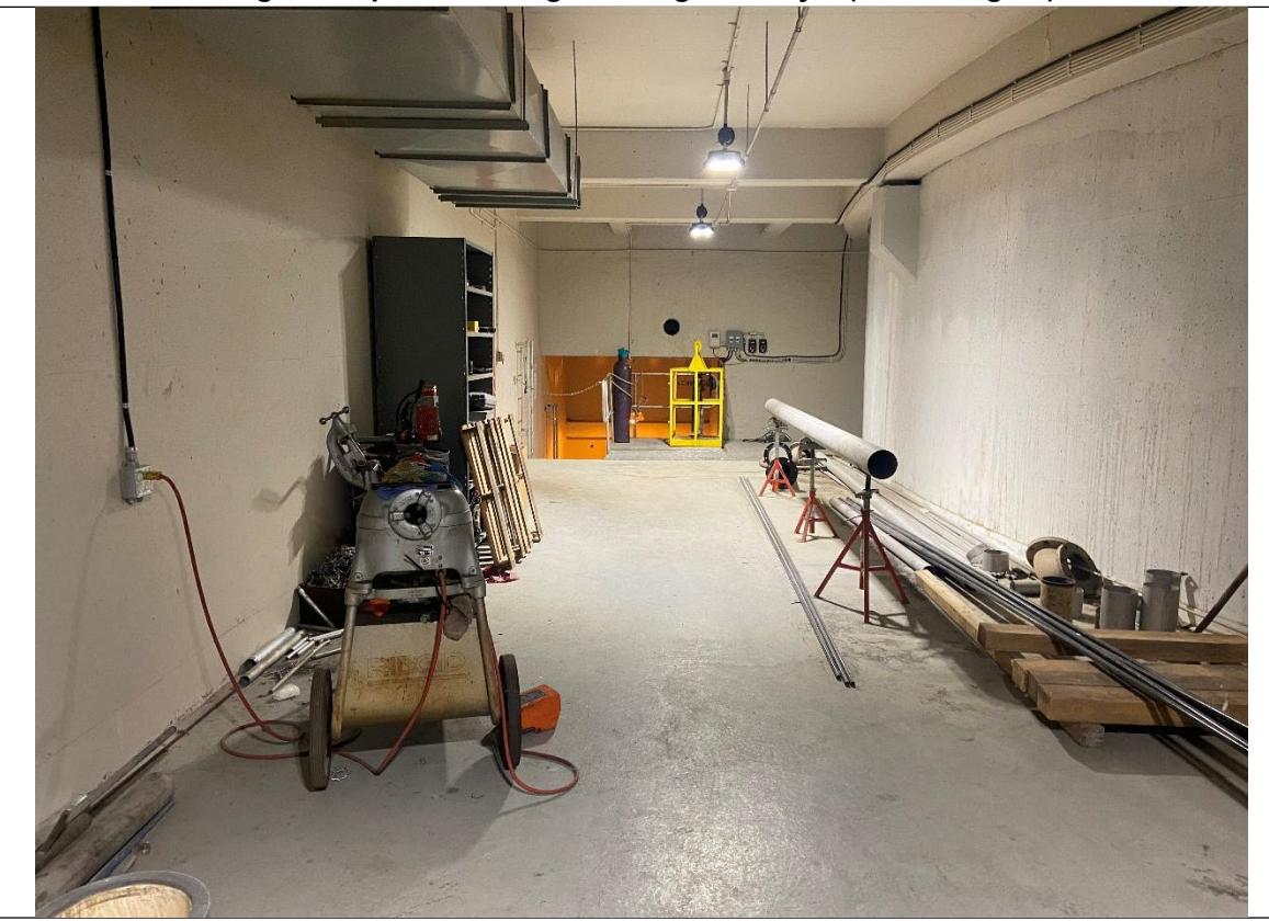
Digester Spiral Exchanger Storage Gallery 2 (4 Exchangers)