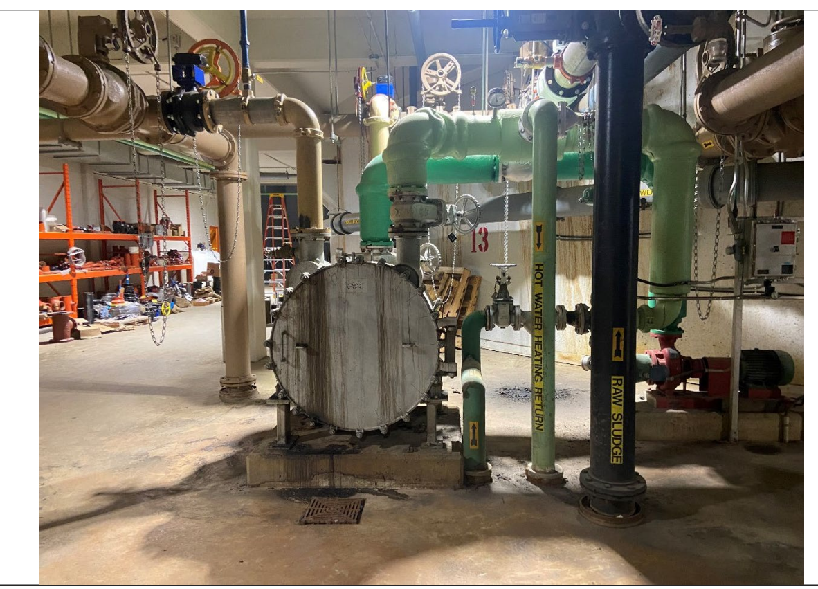
Digester Spiral Exchanger 13