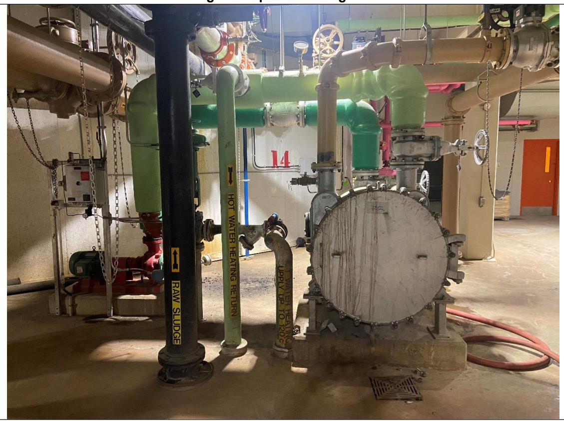
Digester Spiral Exchanger 14