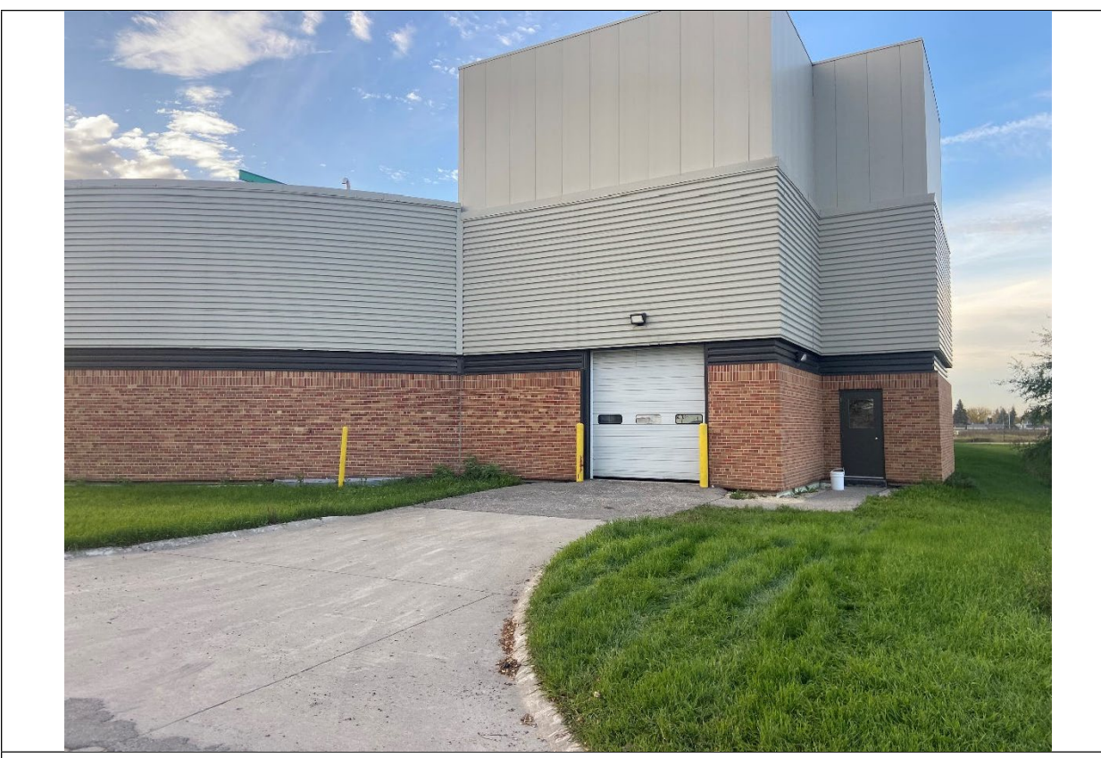
Exchanger Unload Location Outside