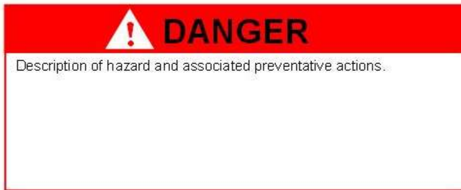
Figure 1: Sample Danger Notice

B.8.2 Contractor shall provide warning notices throughout each of the Operations & Maintenance Manuals where there is a hazard that can cause serious personal injury, death, or major property damage.