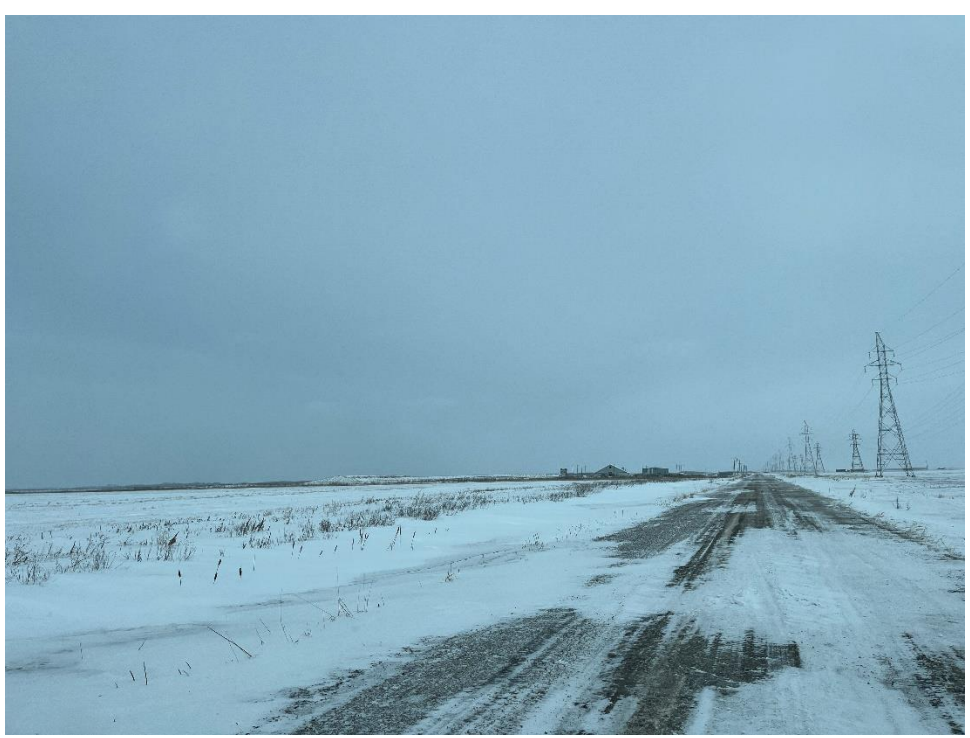
View of the Subject City Property Looking East (from the South Boundary)