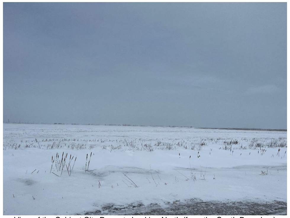
View of the Subject City Property Looking North (from the South Boundary)