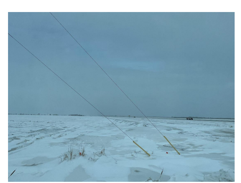
View of the Subject City Property Looking North (from the Southeast Boundary)