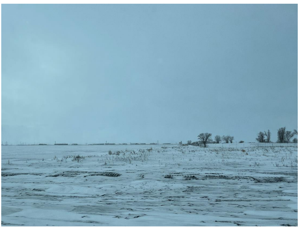
View of the Subject City Property Looking West (from the East Boundary)