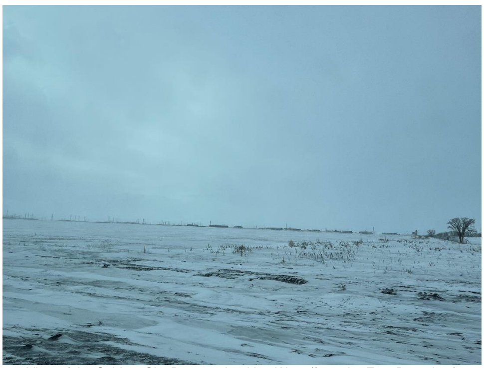
View of the Subject City Property Looking West (from the East Boundary)