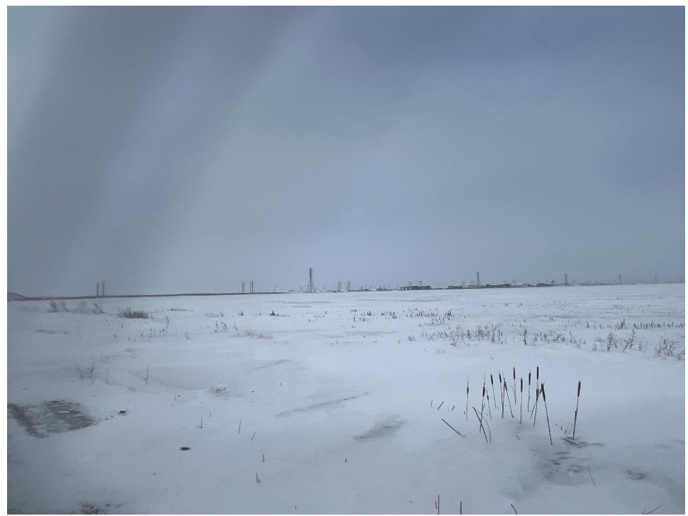
View of the Subject City Property Looking Northwest (from the South Boundary)