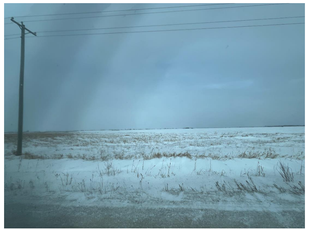
View of the Subject City Property Looking North (from the South Boundary)

Tomplate Variani a Real Estate Capitago RED2021020