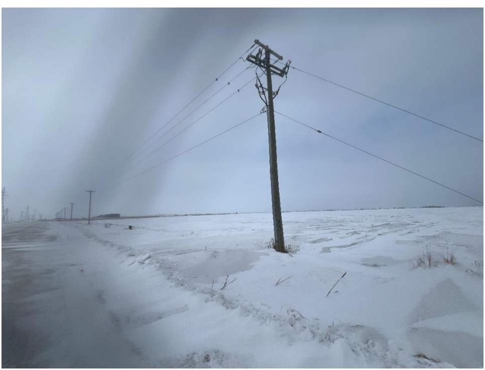
View of the Subject City Property Looking Northwest (from the Southeast Boundary)