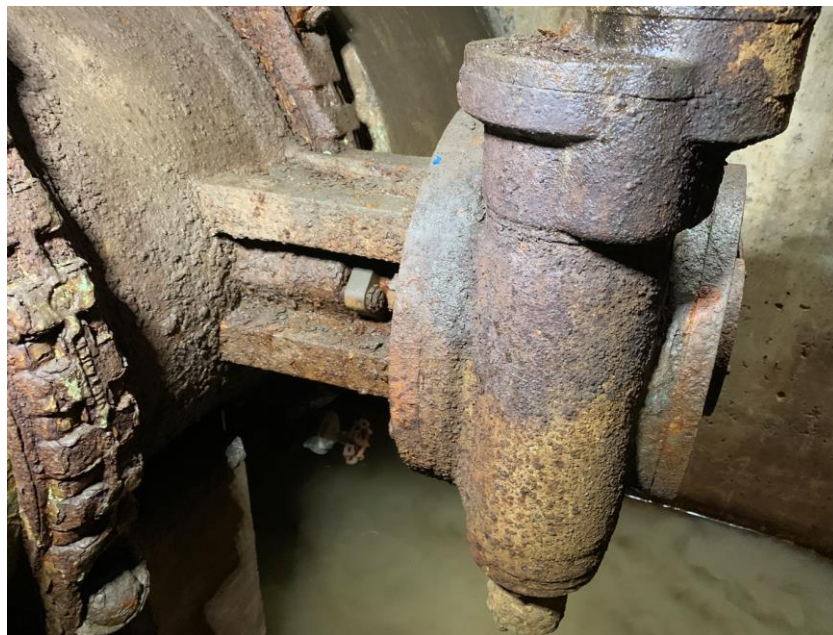
Figure 8: South Valve Chamber Internal View