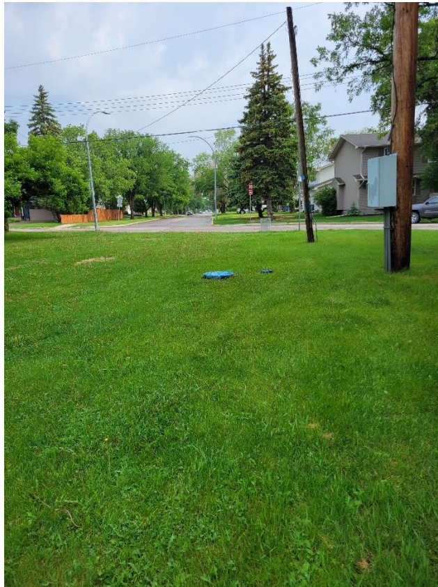
Figure 12: View of Easement on North Side of Assiniboine River Looking North at Assiniboine Av