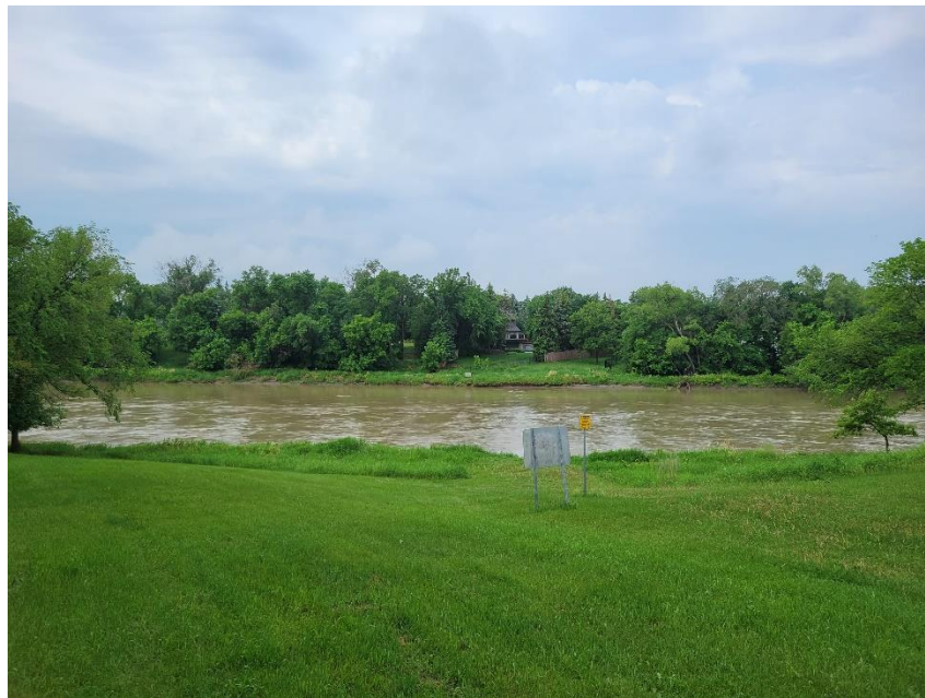
Figure 10: View of Easement on North Side of Assiniboine River Looking South at River