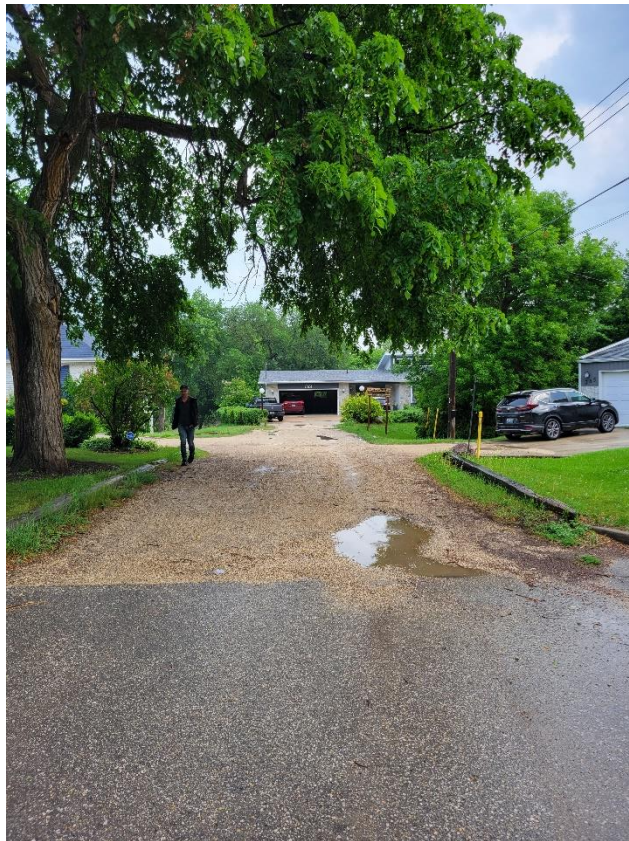
Figure 4: View of Access Road Looking North at Intersection of Berkley St and Southboine Dr