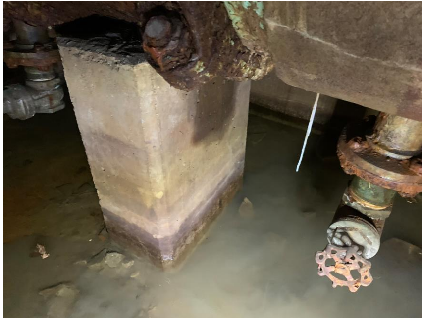
Figure 5: South Valve Chamber Internal View