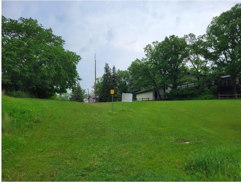
Figure 11: View of Easement on North Side of Assiniboine River Looking North