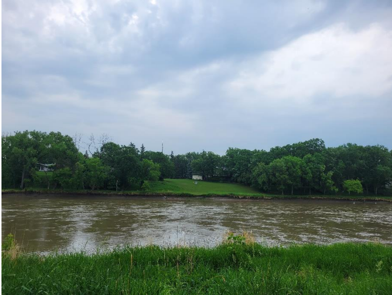
Figure 1: South Side of Assiniboine River Facing North