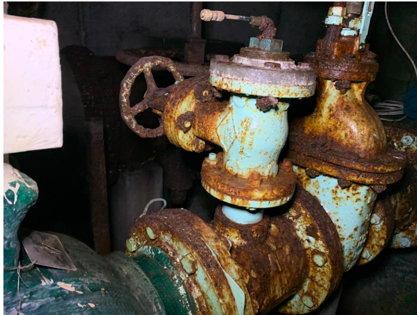
Figure 15: North Valve Chamber Internal View