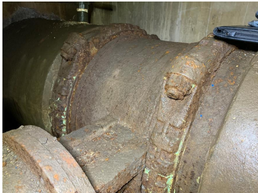
Figure 6: South Valve Chamber Internal View