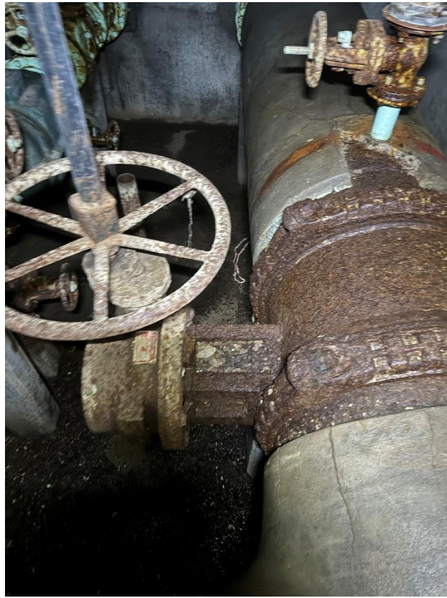
Figure 17: North Valve Chamber Internal View