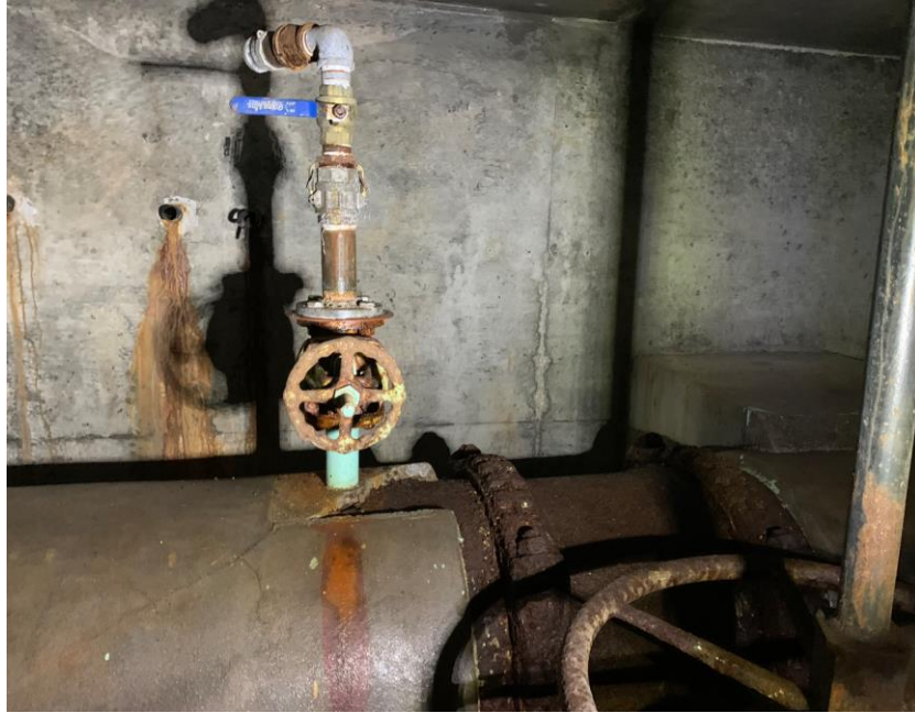
Figure 13: North Valve Chamber Internal View