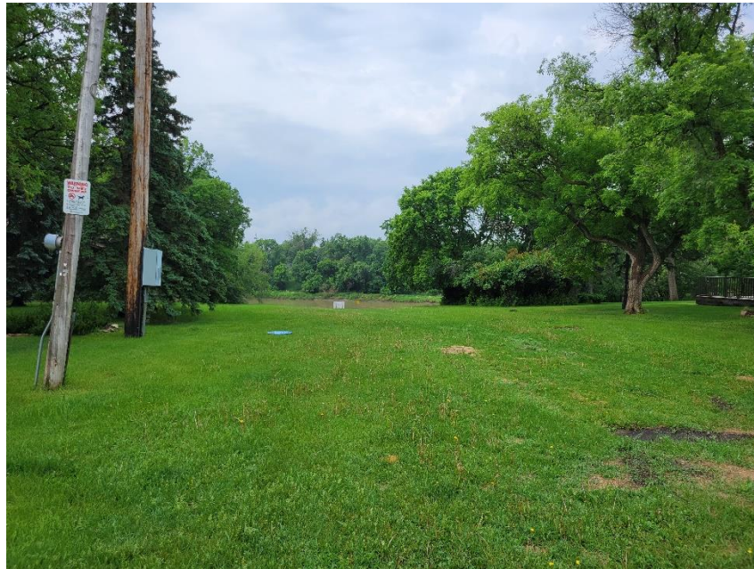
Figure 9: View of Easement on North Side of Assiniboine River Looking South