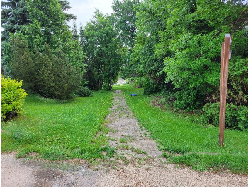
Figure 3: West End of Access Path on South Side of Assiniboine River