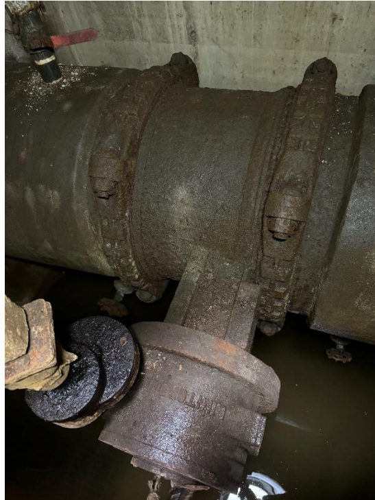
Figure 20: Existing valve Condition (typ.)