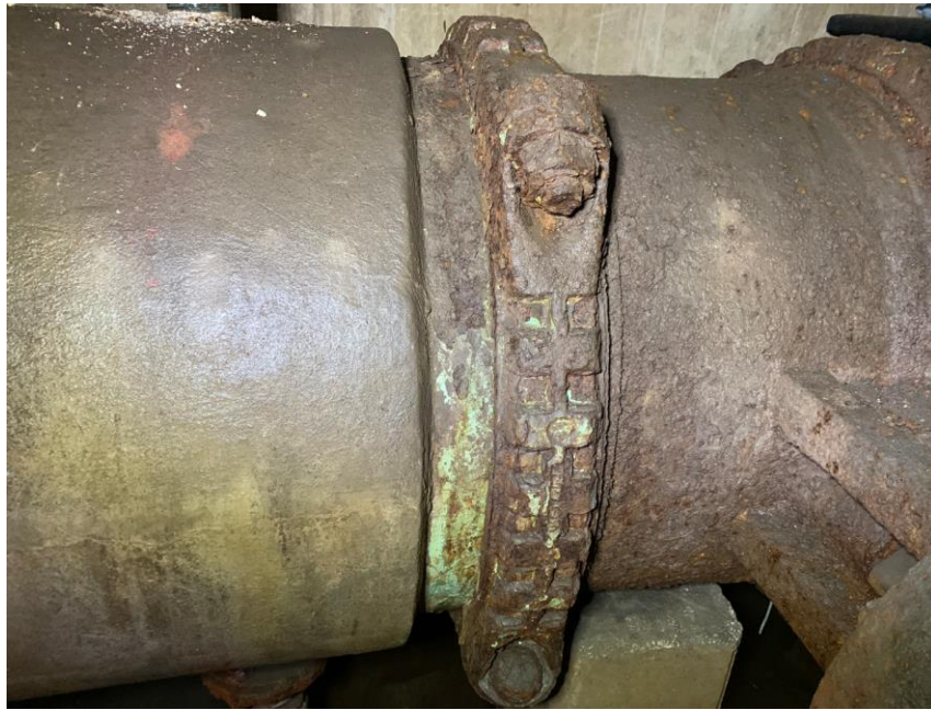
Figure 7: South Valve Chamber Internal View