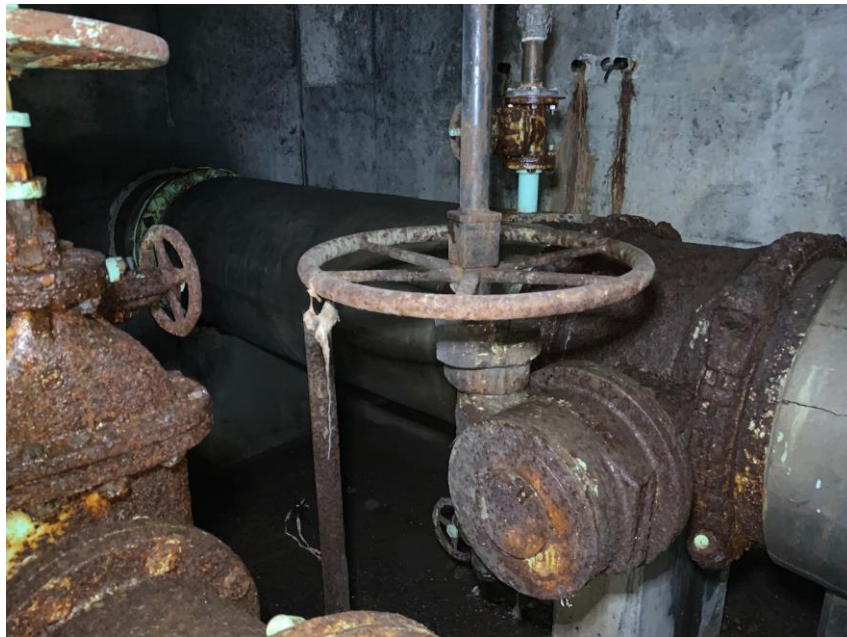
Figure 14: North Valve Chamber Internal View