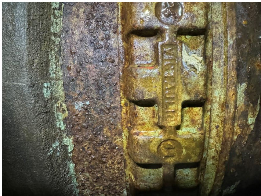
Figure 18: Existing Victaulic Coupler Style (typ.)