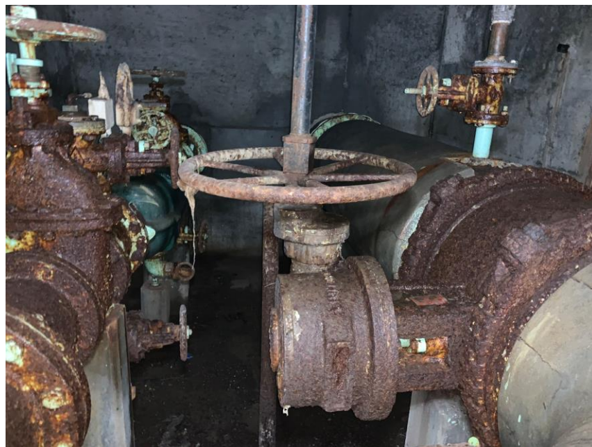
Figure 16: North Valve Chamber Internal View