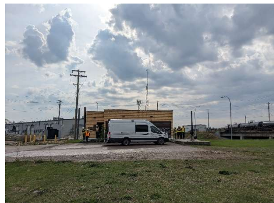
Photo 18: Roland Outfall – looking east from upper bank towards pumping station