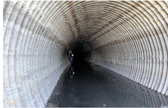
Photo 14: Roland Outfall – emergency repair/slip joint (photo taken looking upstream from outlet)