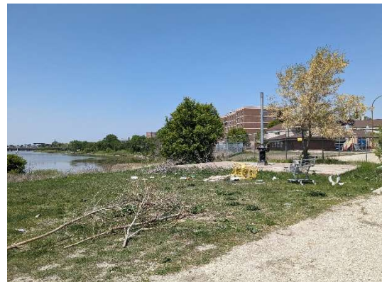
Photo 4: Roland Outfall – Looking north towards chamber at upper bank