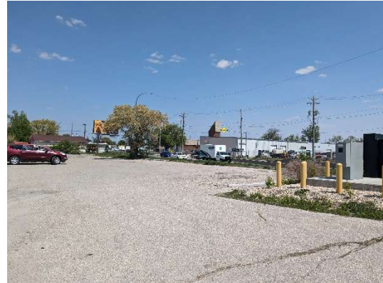
Photo 2: Roland Outfall – Looking northeast towards Watt Street from parking lot