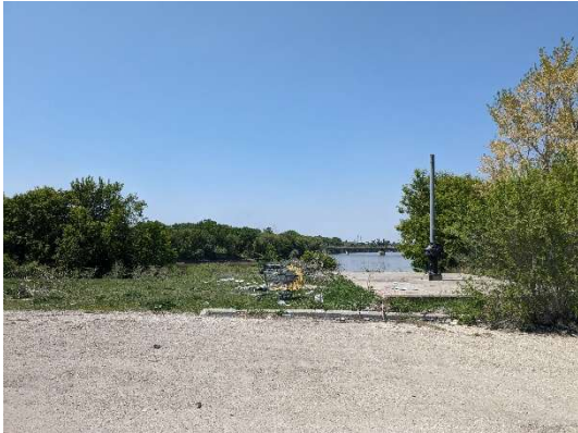
Photo 1: Roland Outfall – Looking west towards chamber at upper bank