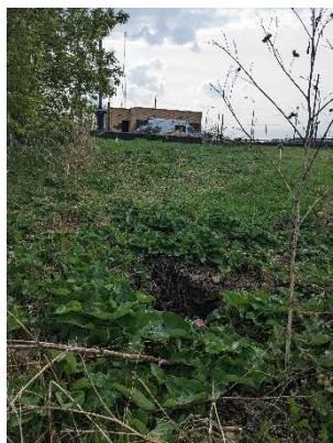
Photo 15: Roland Outfall – small sinkhole observed at grade along mid to upper bank