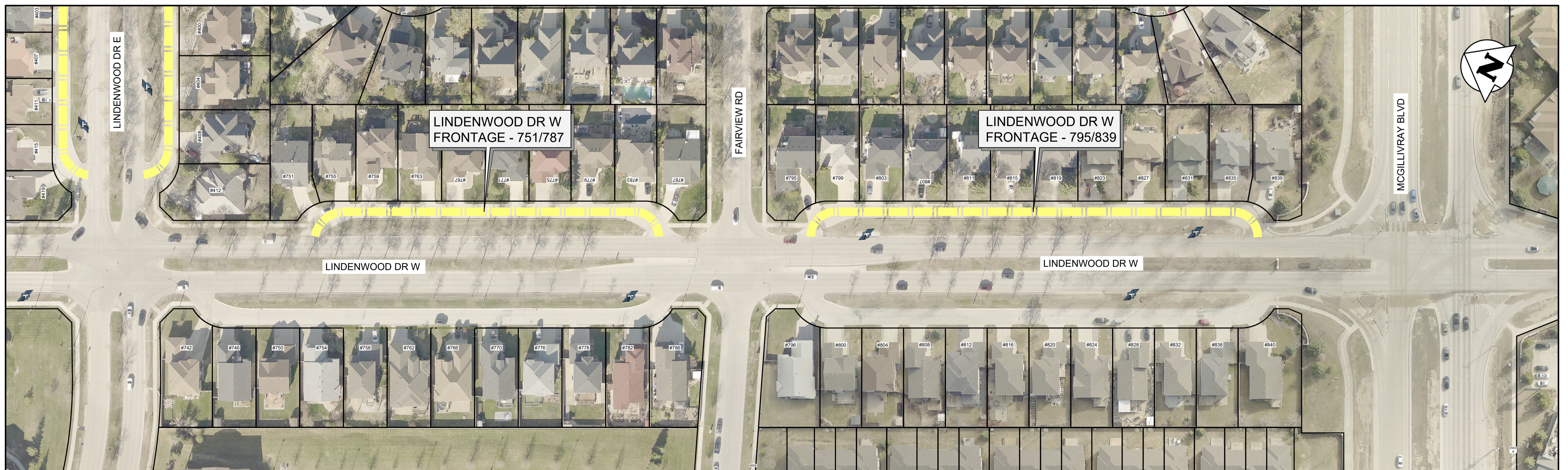
2 LINDENWOOD DR W/FRONTAGE (751/787, 795/839) SCALE 1 : 750