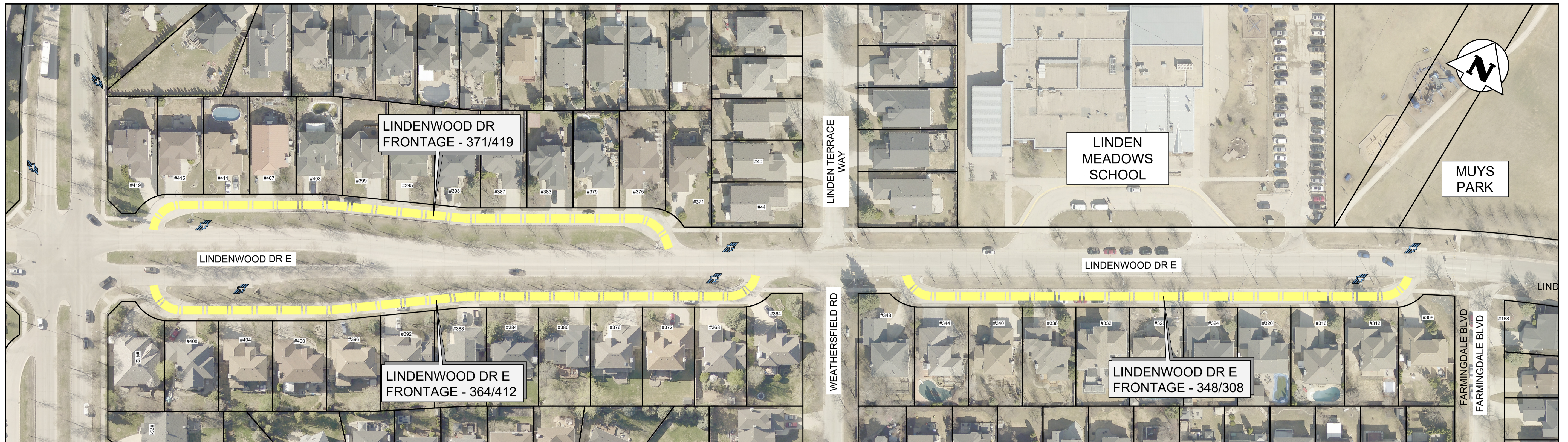
1 LINDENWOOD DR E/FRONTAGE (348/308, 364/412, 371/419) SCALE 1 : 750