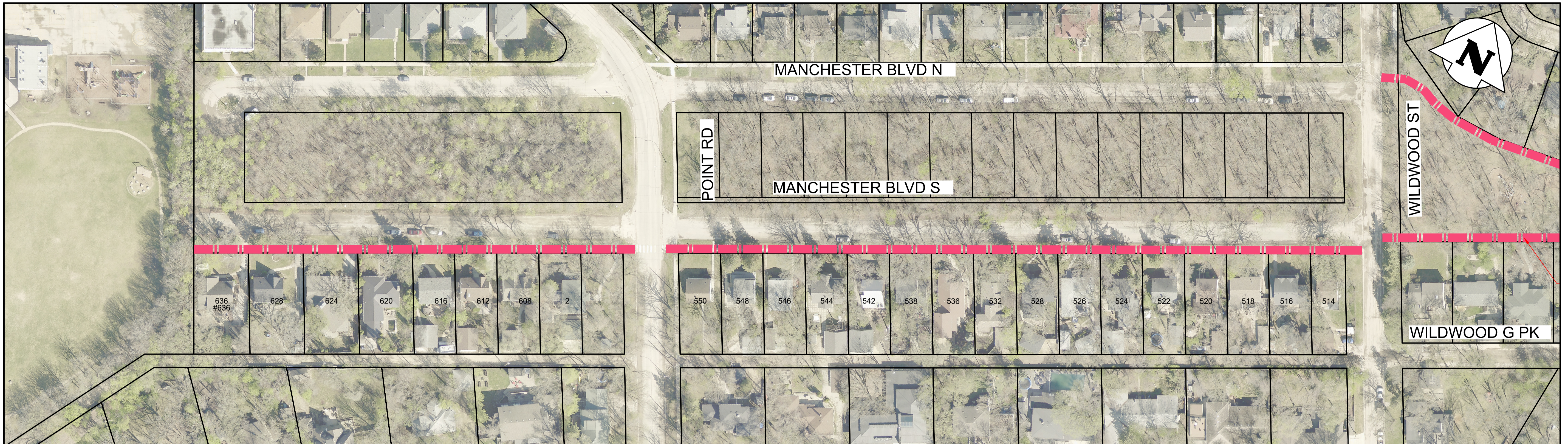
1 MANCHESTER BLVD. S.-WEST LIMIT TO WILDWOOD ST. SCALE 1 : 750