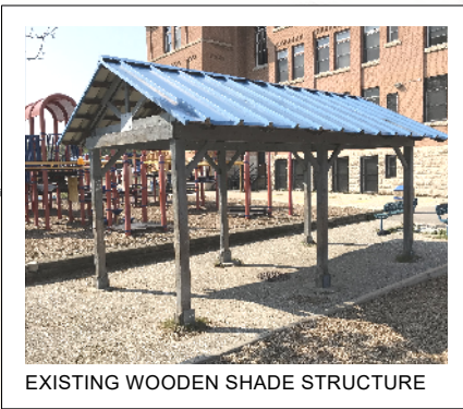
EXISTING WOODEN SHADE STRUCTURE