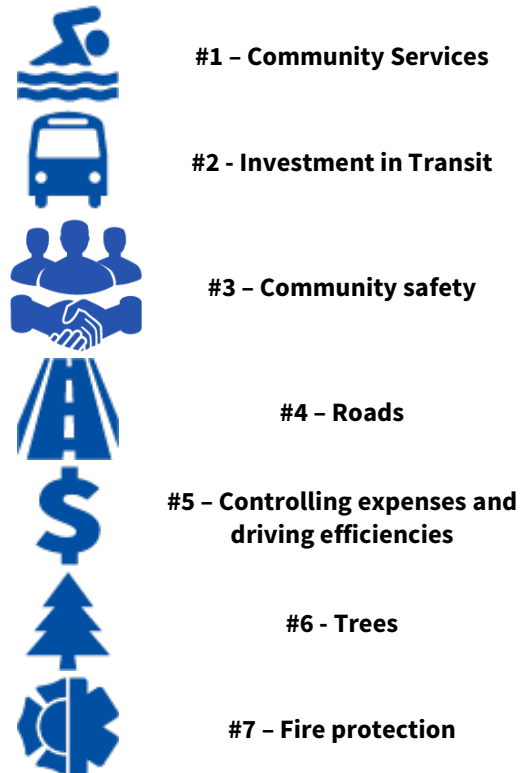
Table 1 Ranking of importance of seven multi-year budget priorities

Of the seven multi-year budget priorities, please select the one that you feel is the most important for you now.