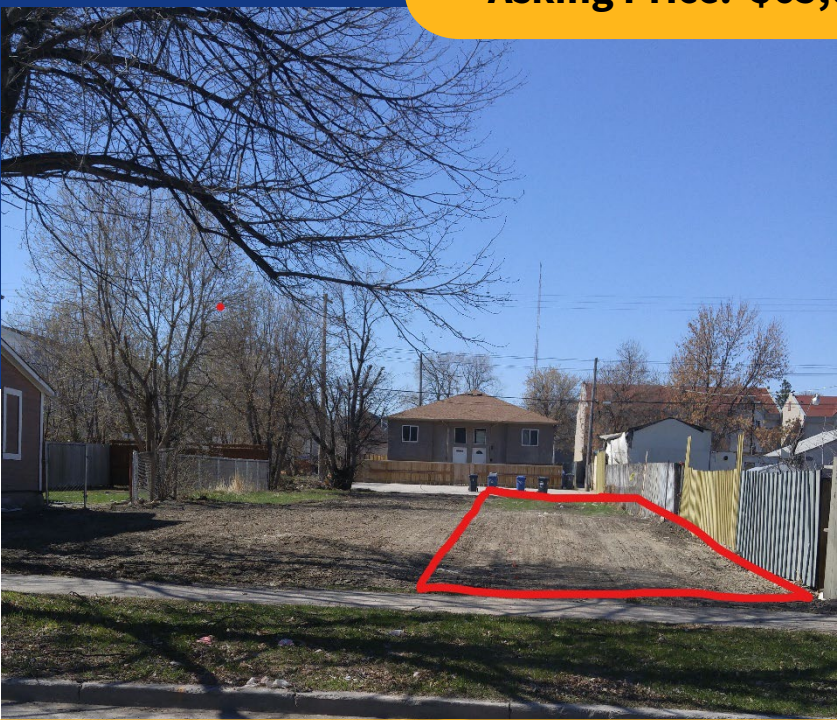
Offers to Purchase the Subject Property will be received until: Offers will be reviewed as received.

Any group or agencies including non-profit groups which can provide proof of non-profit status, are welcome to submit a bid. All offers will be considered.