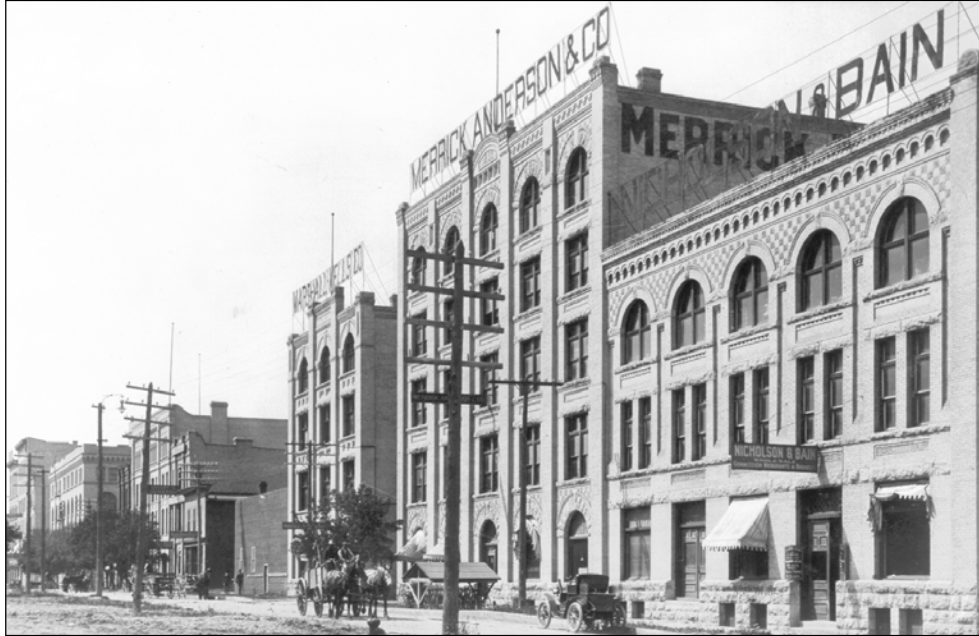
Plate 3 – Bannatyne Avenue looking west from Bertha Street, ca.1910.