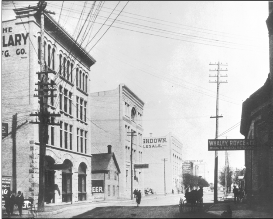
Plate 1 – Bannatyne Avenue looking east from Main Street, 1900, McClary Building in left foreground.