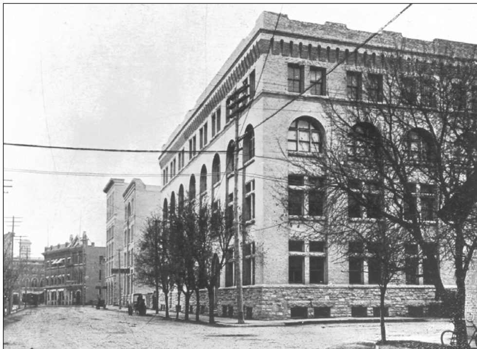
Plate 2 – Bannatyne Avenue looking east from Rorie Street, c. 1903.