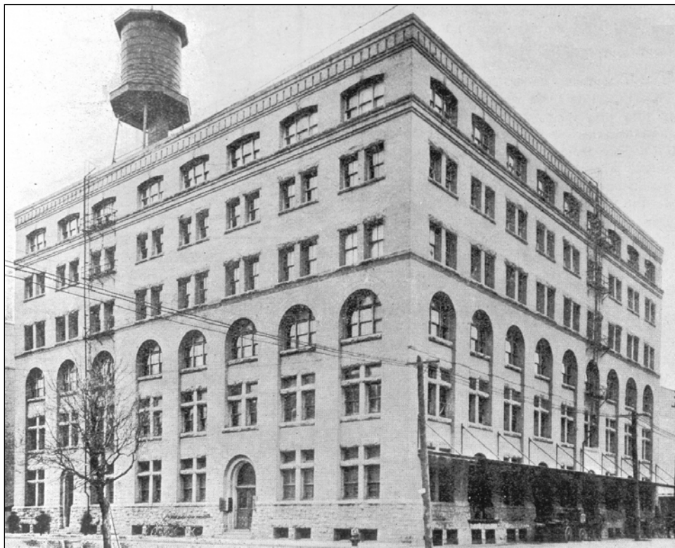
Plate 4 – J.H. Ashdown Warehouse, 157-179 Bannatyne Avenue, c.1912.