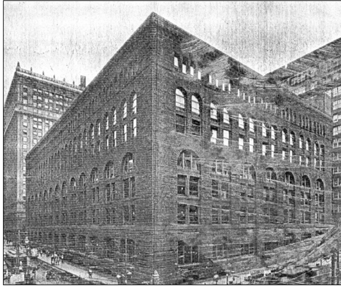
Plate 5 – Marshall Field Wholesale Store, Chicago, H.H. Richardson, architect. ( Reproduced from H.R. Hitchcock, The Architecture of H.H. Richardson and His Times, Plate 127. )