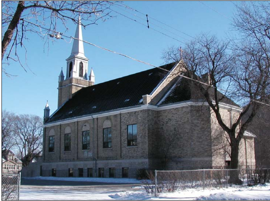
Rear (south) and west façades, 2002

although many of the original arched windows on the east and west façades have had the window units replaced and the arched areas bricked in.