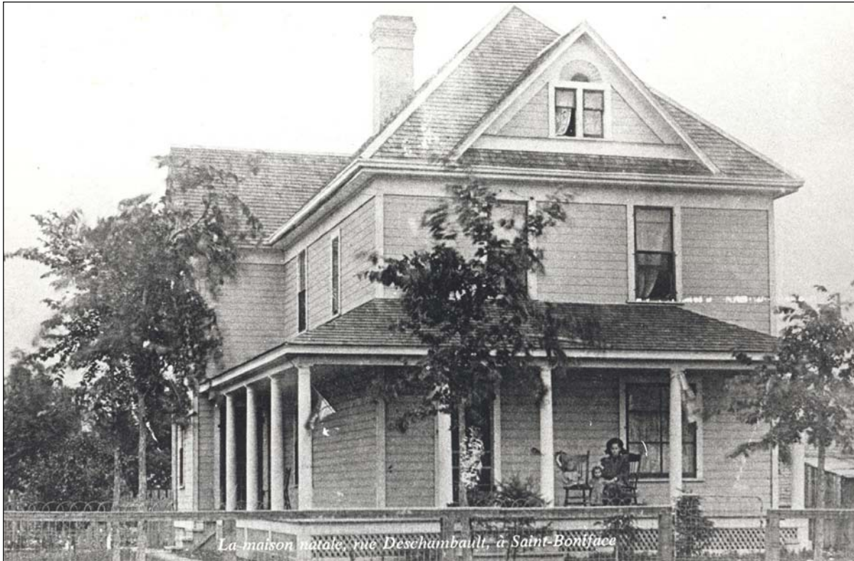
Plate 1 – 375 Rue Deschambault in c.1910. The child standing on the veranda may be Gabrielle Roy