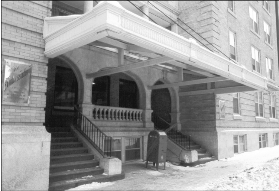
Plate 3 – Detail of the Hargrave Street entrance, no date.