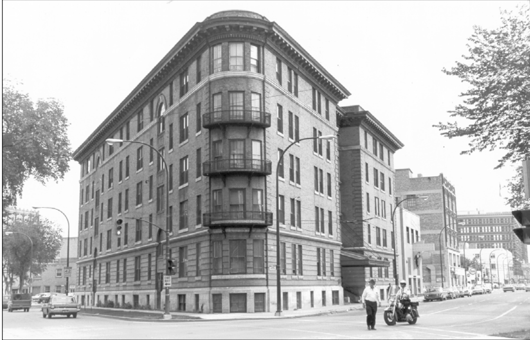
Plate 1 – 379 Hargrave Street, Ambassador Apartments, Hargrave Street and Cumberland Avenue façades, 1969.