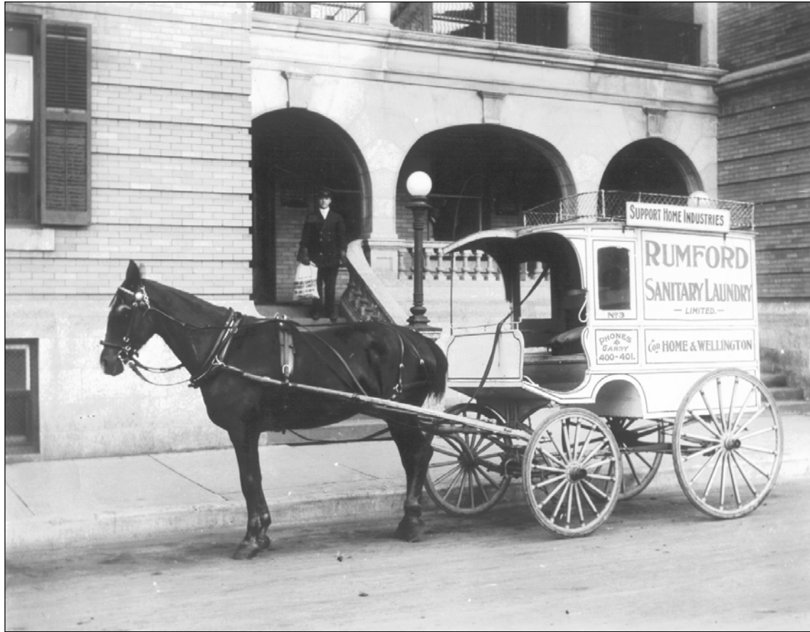
Plate 5 – Laundry wagon parked in front of the Hargrave Street entrance of the Breadalbane Apartments, 1914.