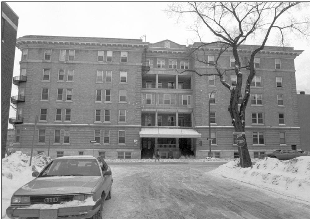
Plate 2 – 379 Hargrave Street, Ambassador Apartments, Hargrave Street façade, no date.